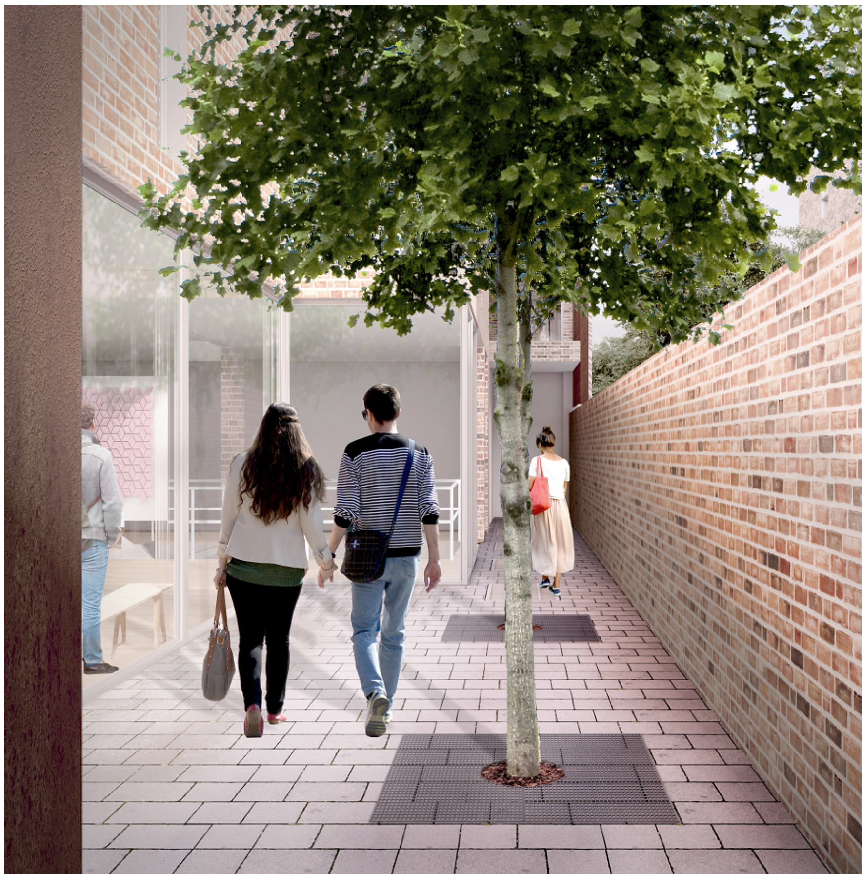
Proposed Entrance View - Ground Floor