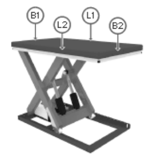
LS = Lift stroke, CH = Closed height, L = Length, W = Width