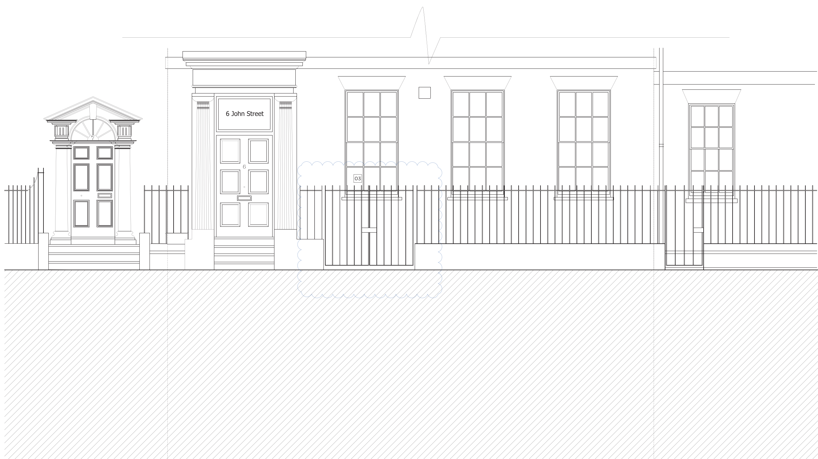
Proposed West Street Elevation