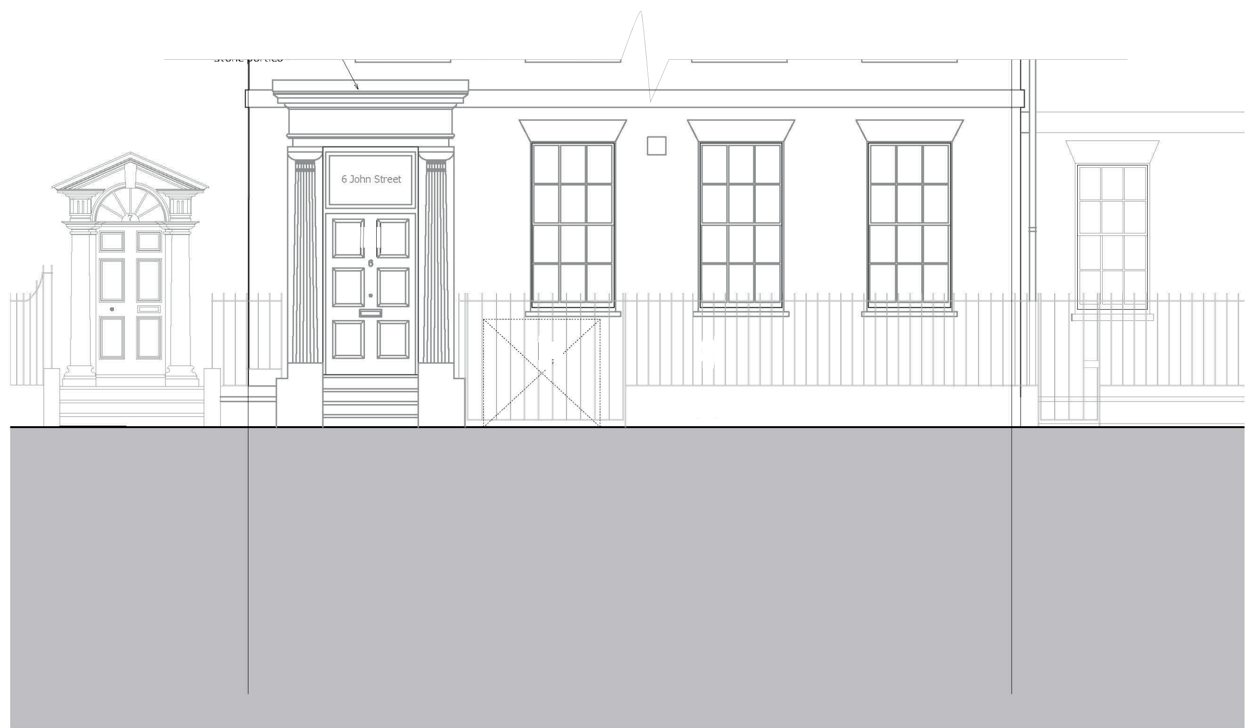
Consented/Demolition West Street Elevation 2015/3149/P by Coffey Architects