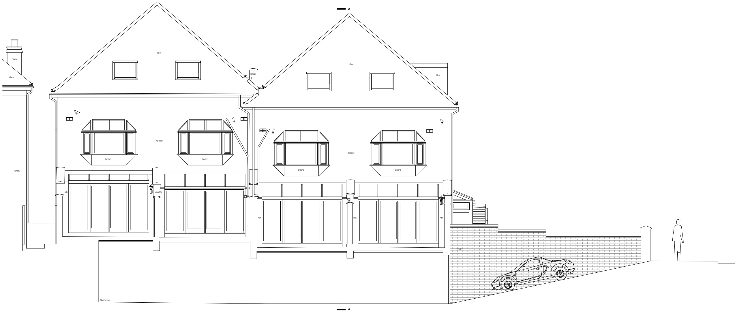
Existing rear / north elevation