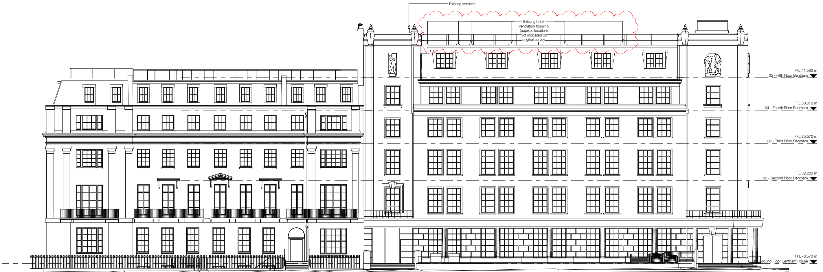
1 Existing North West Elevation 1 : 100