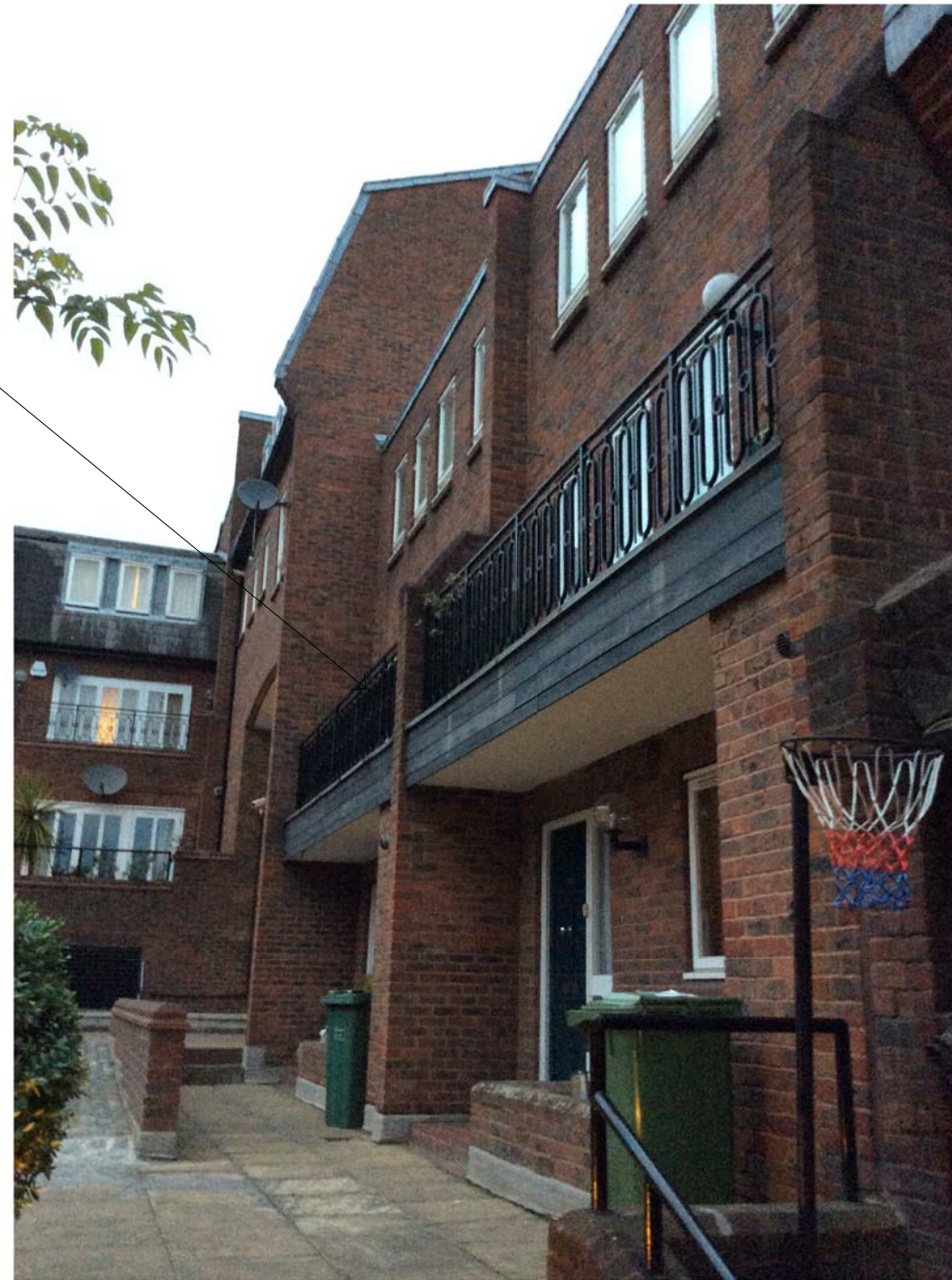
3 Timber floor balcony with metal hand