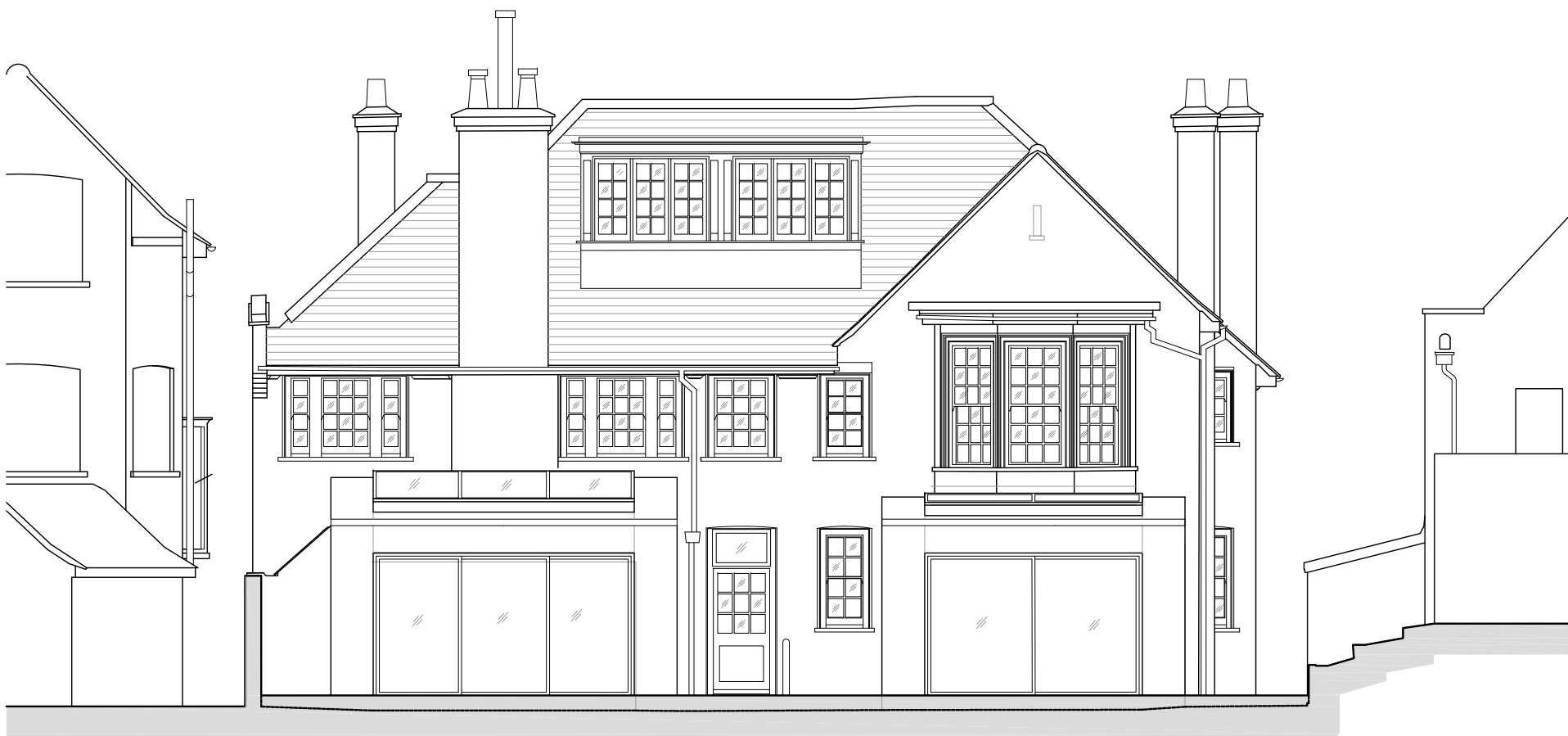
REAR EXTENSIONS AS CONSENTED, REF: 2017/0699/P