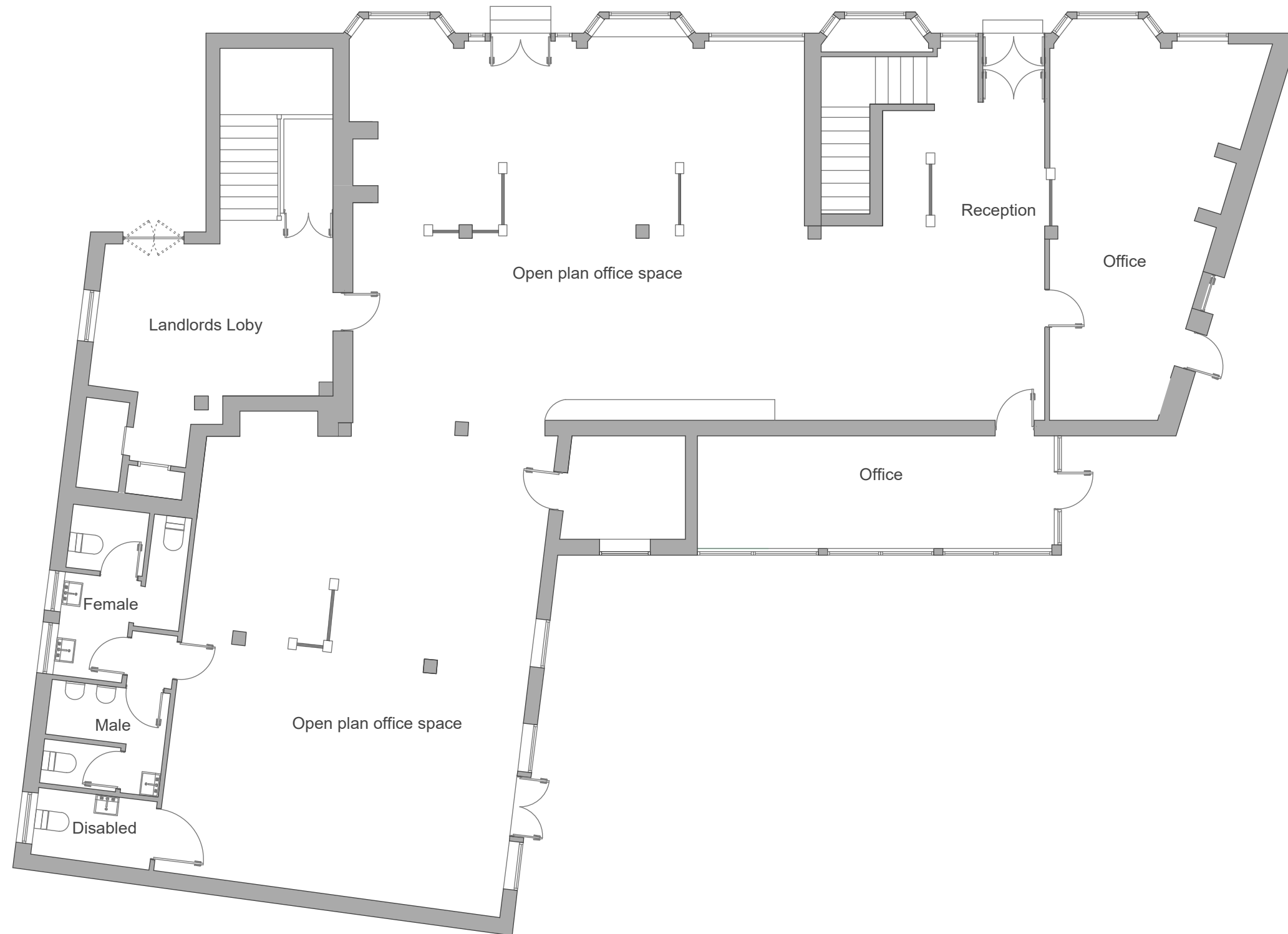
Proposed Ground Floor_Scale 1:100