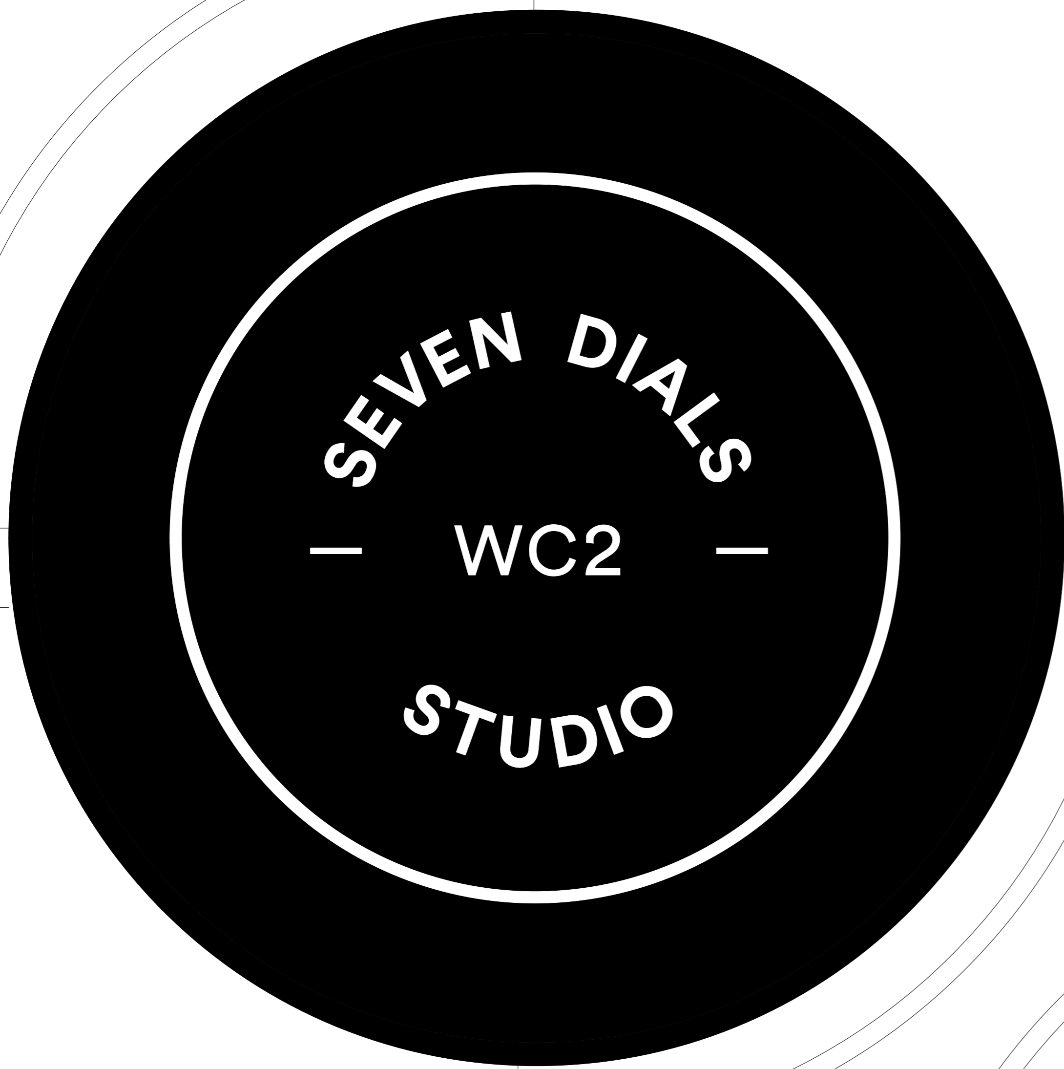
SEVEN DIALS STUDIO

Metal profile frame, projecting external sign. Frame fixed to brick using anchor bolts (sized by fabricator). Frame finish; Powder coated in graphite black RAL 9011. Opal acrylic panels to both sides. Background is masked with solid (blackout) external grade vinyl film, finished in graphite black RAL 9011 See fabricators drawing: Ref: 14182-03 for further details.