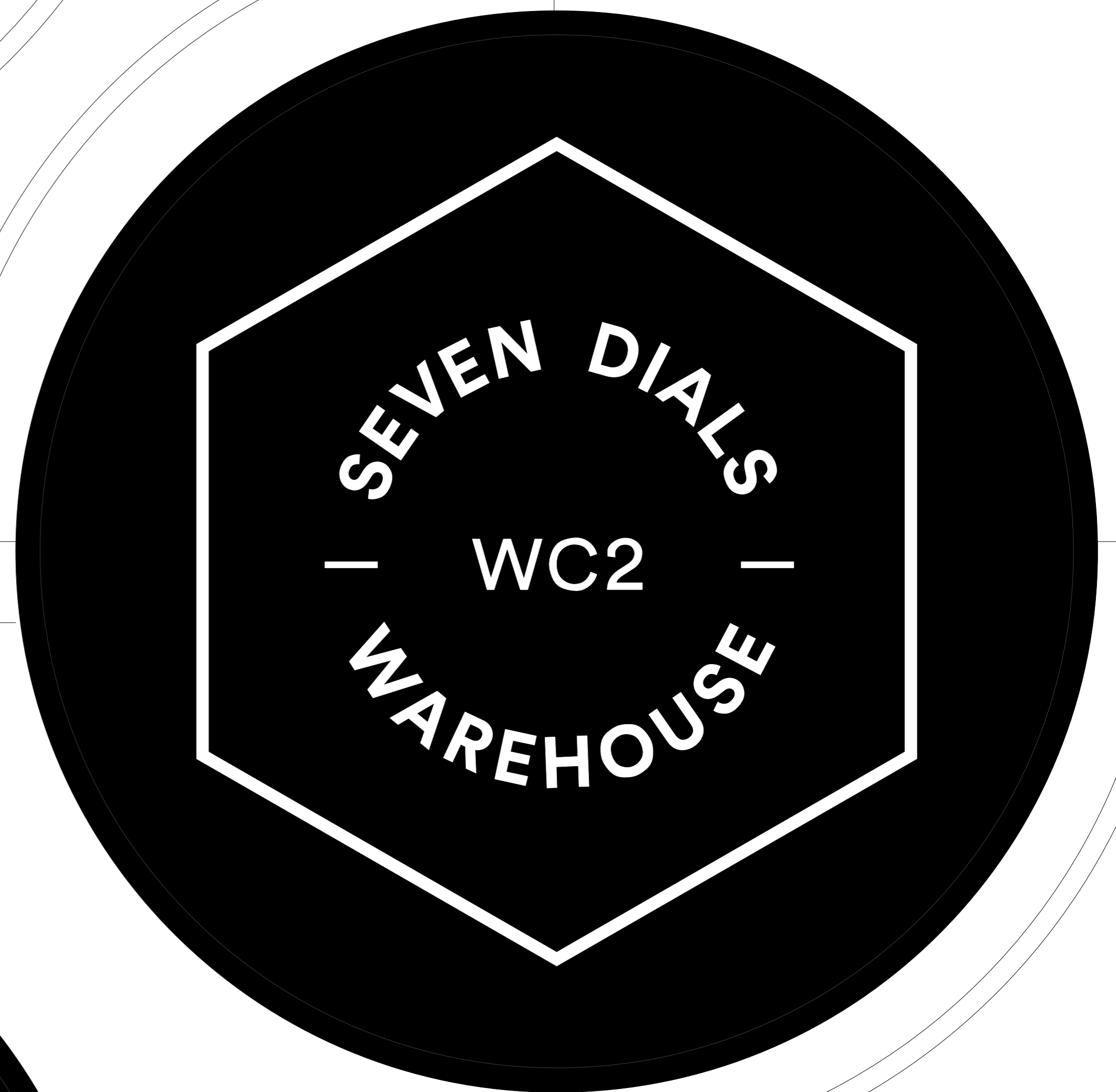
SEVEN DIALS WAREHOUSE