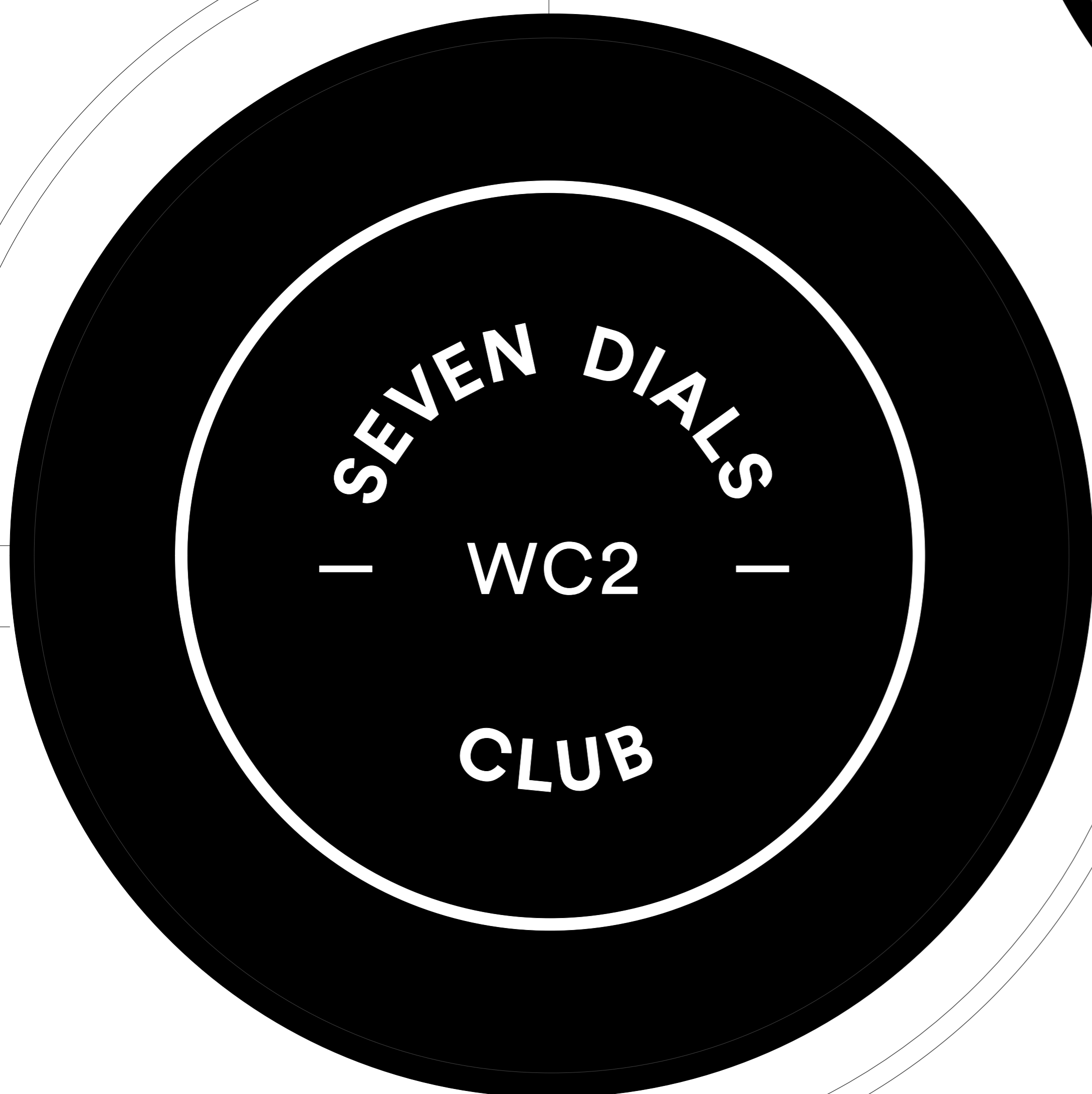
SEVEN DIALS CLUB