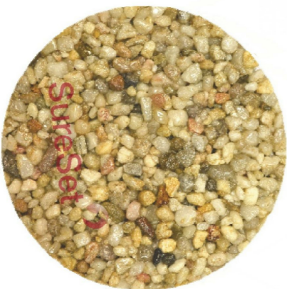
Example of 'Norwegian pearl' resin bound permeable paving