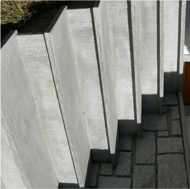
Example of proposed grey cast stone finish to treads - risers will be in brick to match the existing house