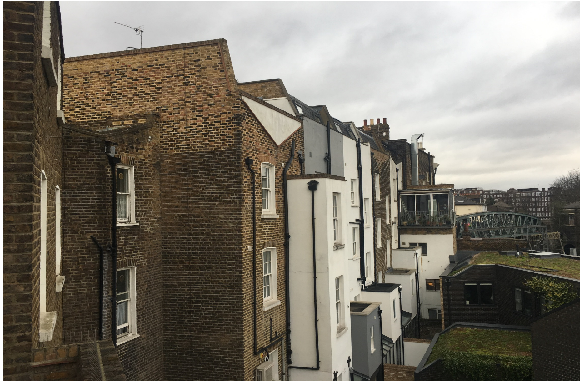
Figure 2 – Rear view looking North