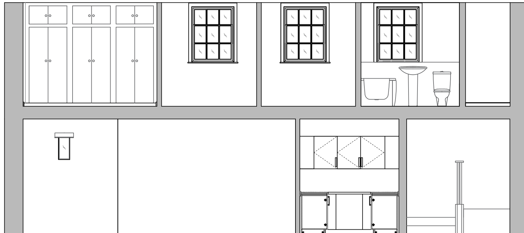
2 EXISTING SECTION AA SCALE 1:50