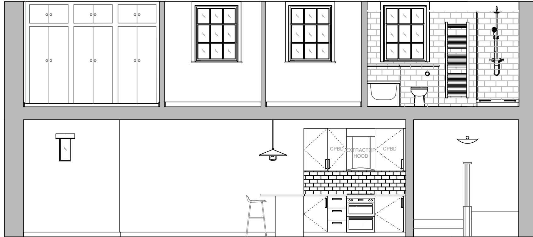
1 PROPOSED SECTION AA SCALE 1:50

COPYRIGHT THE HONOURABLE SOCIETY OF LINCOLN'S INN.