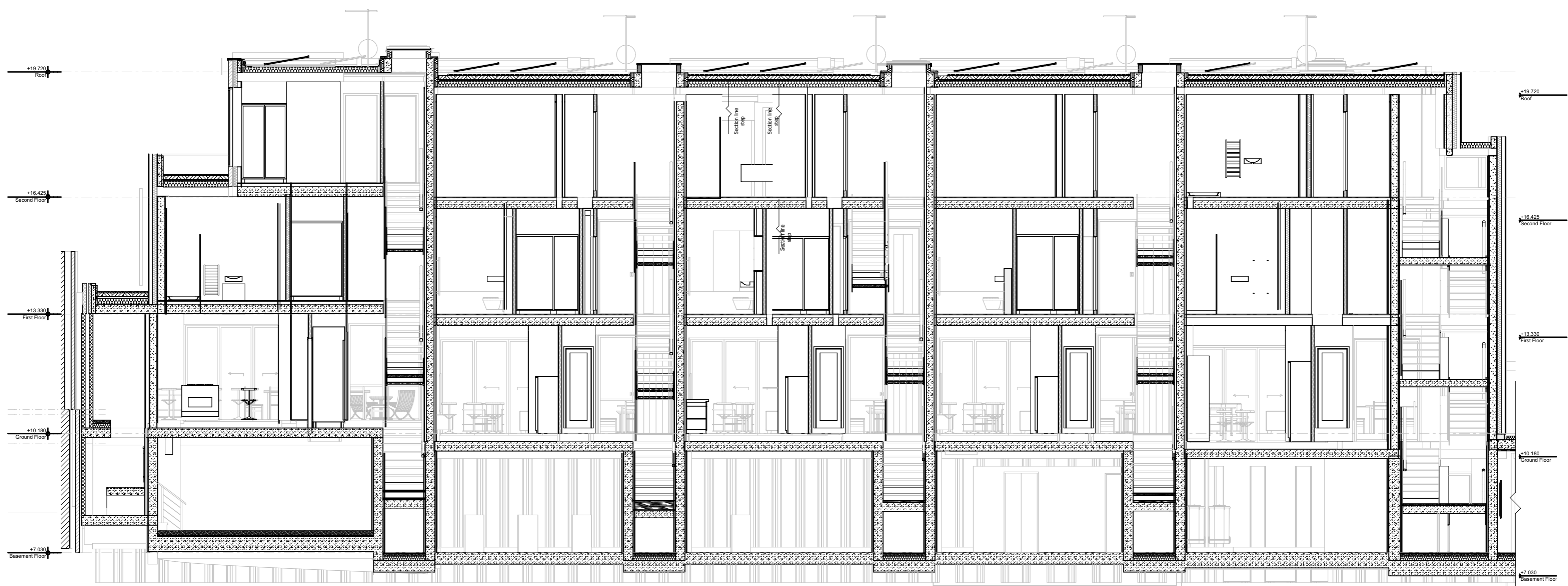
Section AA Scale @A3 - 1:100

Notes: Do not Scale from this drawing Use figured dimensions only This drawing is the copyright of the architect and may not be reproduced without permission. This scheme is subject to all necessary consents. Dimensions, areas and levels where given are approximate and subject to site survey. All dimensions are to be checked on site. Any discrepancies are to be reported to the architect before the work commences. Figured dimensions only are to be taken from this drawing. This drawing is to be read in conjunction with all relevant consultants' and/or specialists drawings/documents and any discrepancies or variations are to be notified to the architect before the affected work commences.