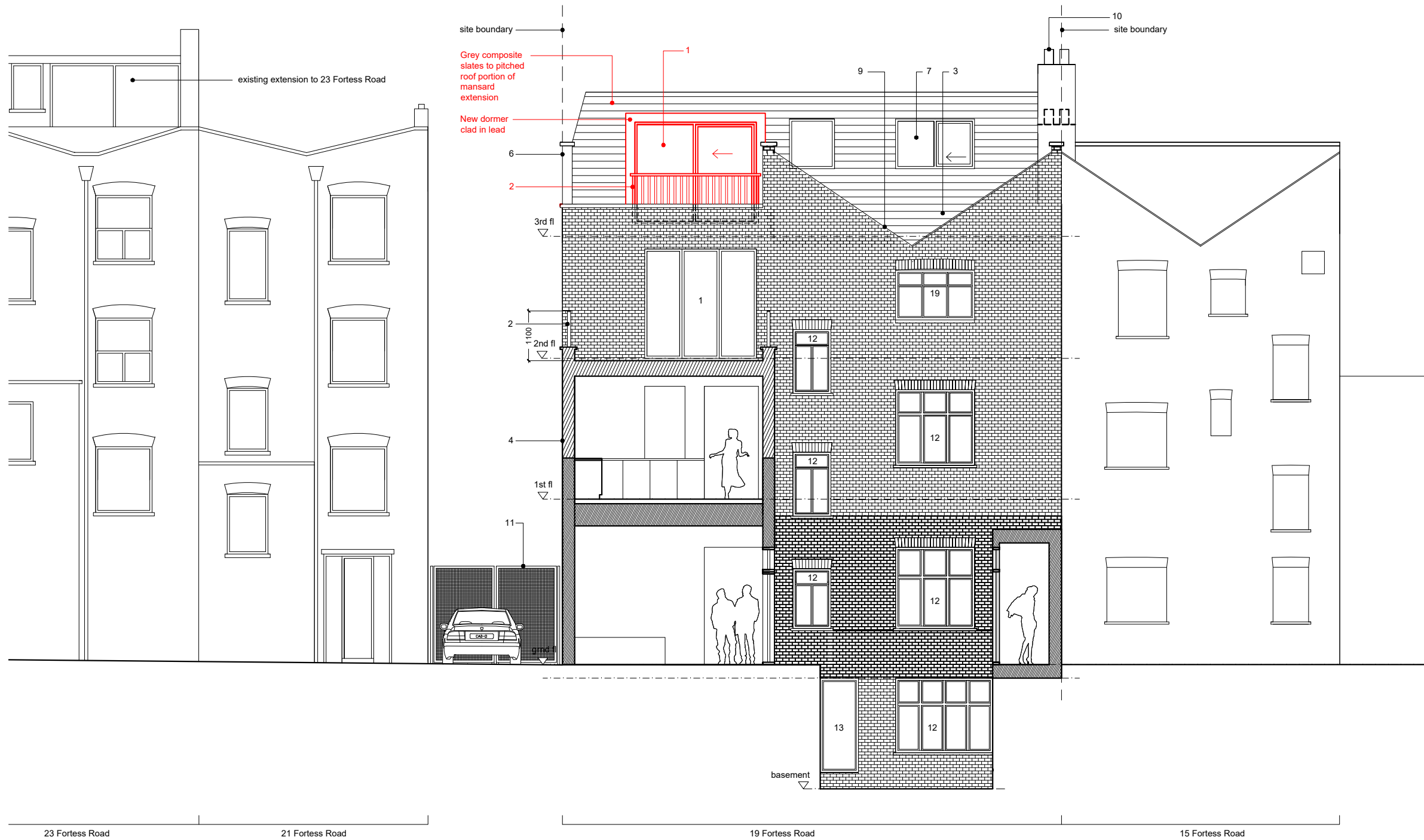
Proposed rear sectional elevation BB Scale 1:100 @A3