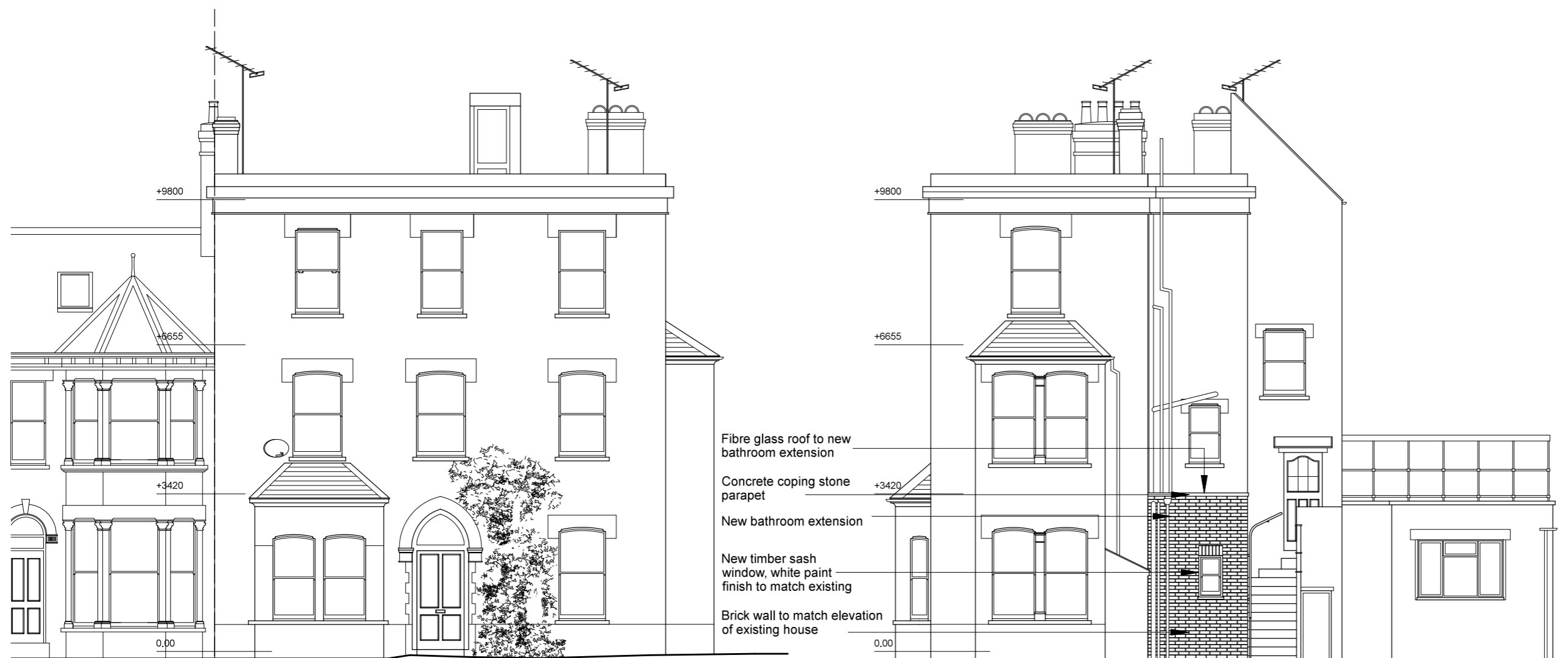
NORTH EAST SIDE ELEVATION