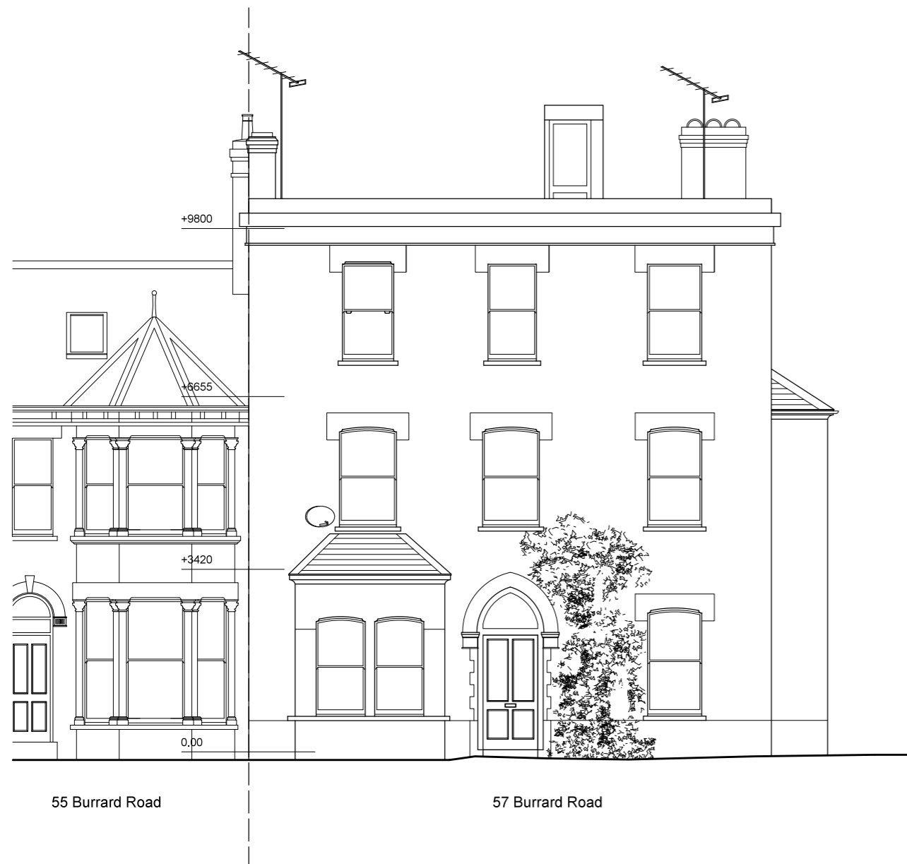
NORTH EAST SIDE ELEVATION