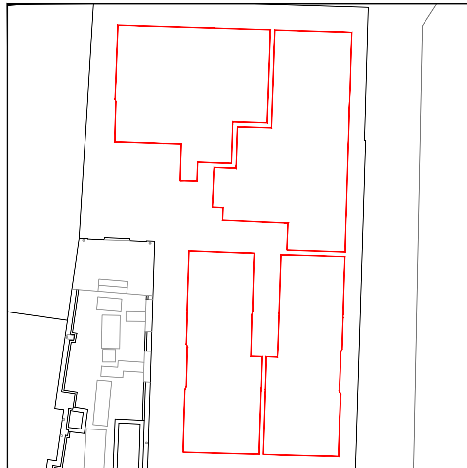
1 SITE PLAN SCALE 1:200 @ A3