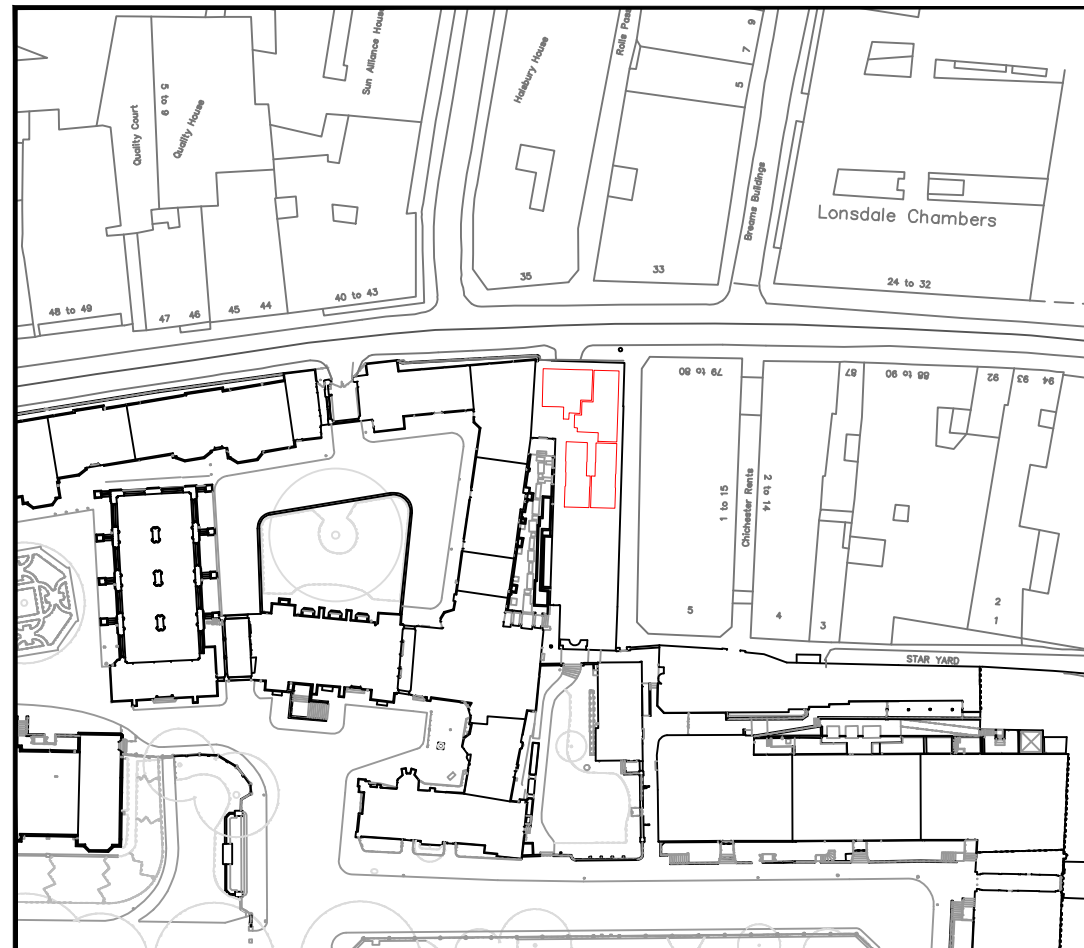
2 ORDNANCE SURVEY LOCATION PLAN SCALE 1:1250 @ A3