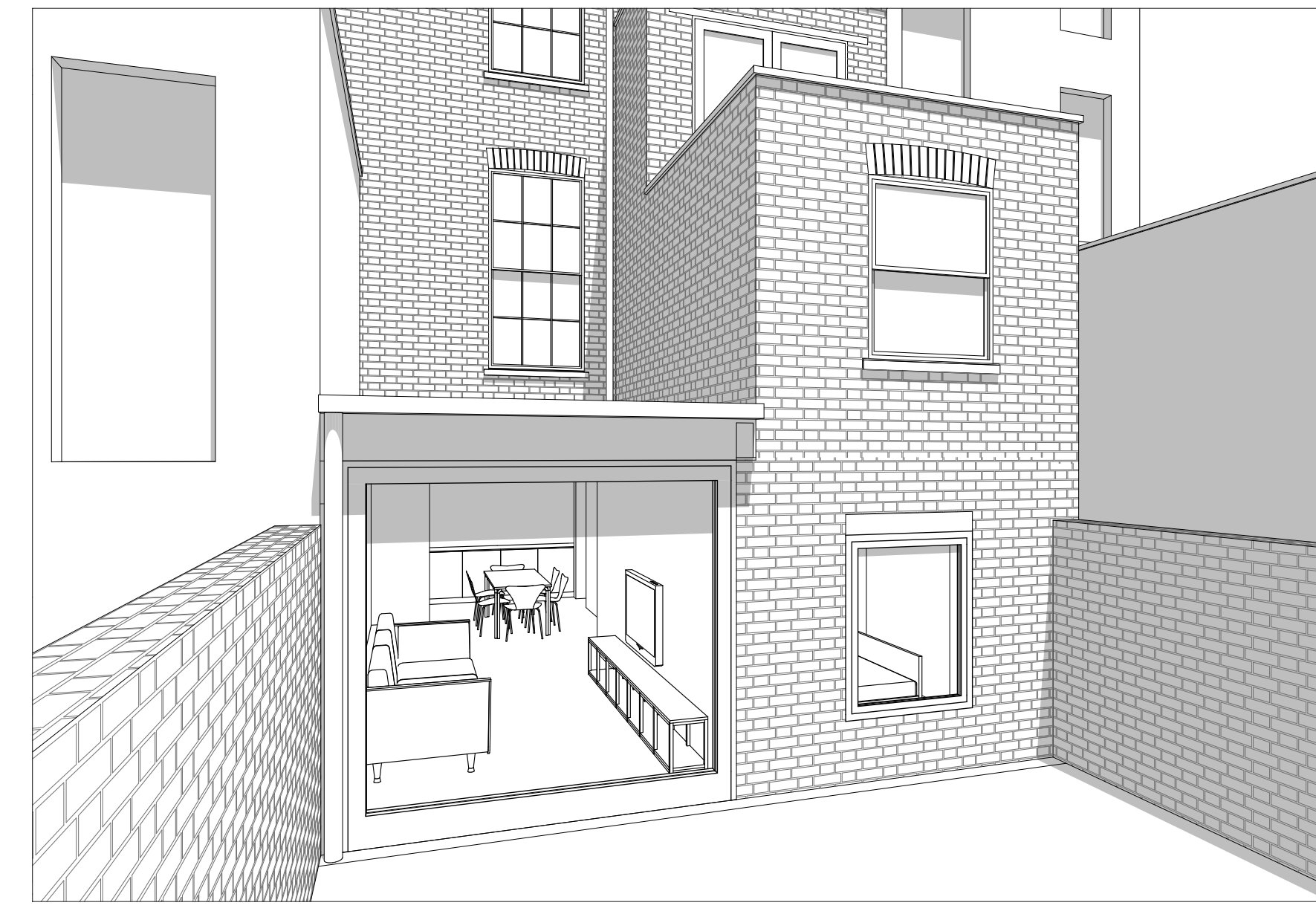
View to rear extension

Do not scale, work to annotated dimensions only. Read drawings in conjunction with relevant consultants' drawings. Confirm all dimensions before commencement of work. Apparent discrepancies to be raised with Friend & Co. before commencement of works.