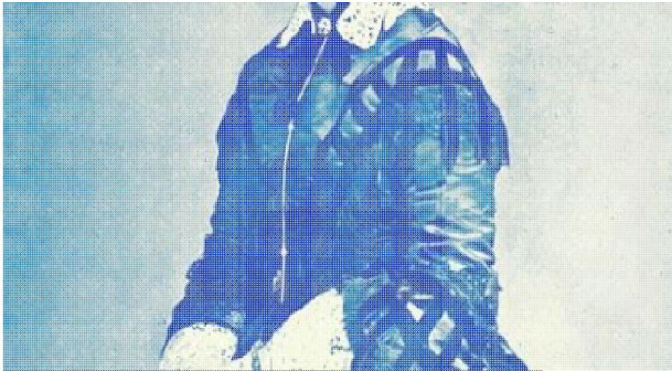
Florence Nightingale in Cleveland St | Spitalfields Life