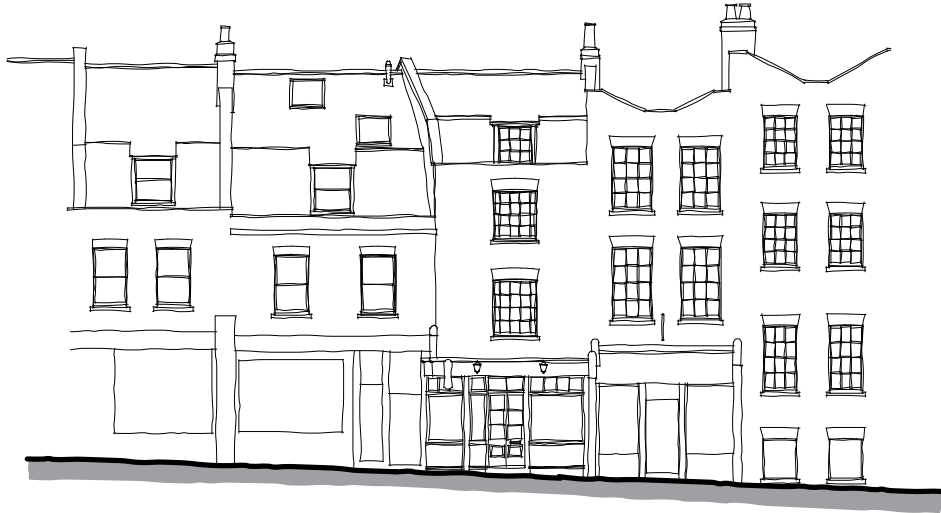
PROPOSED FRONT ELEVATION - NORTH WEST