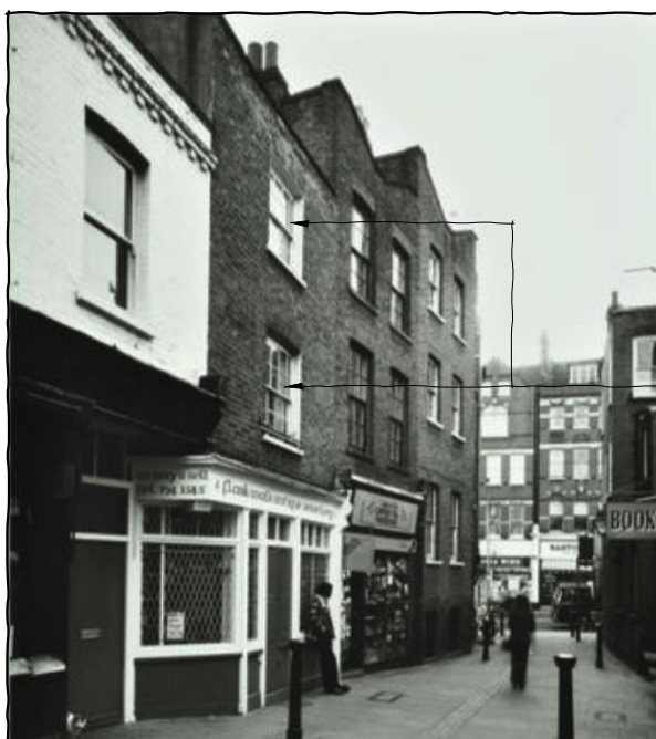
margin barred sash window fenestration

The window fenestration design takes reference from the photograph below taken in 1978.