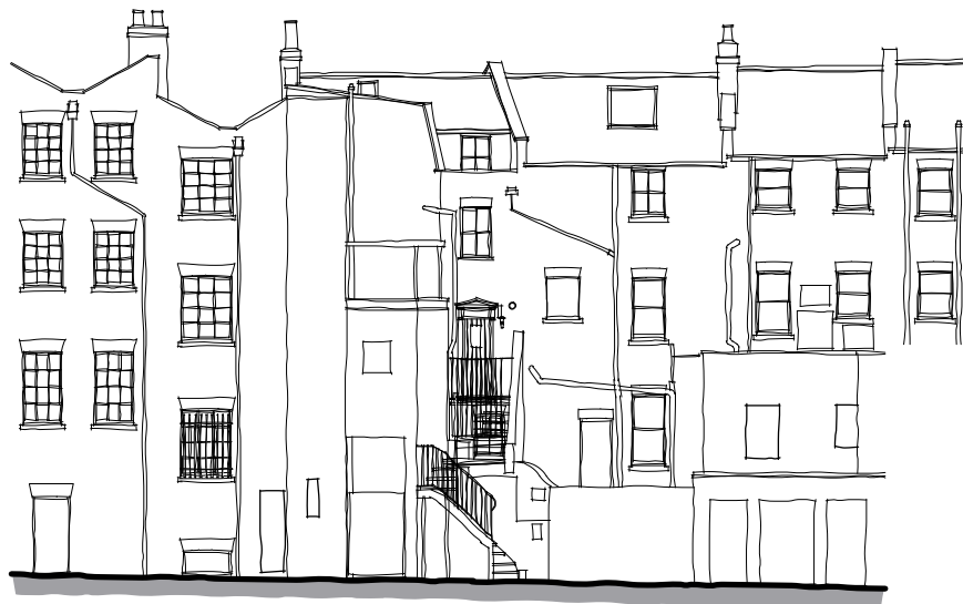
PROPOSED REAR ELEVATION - SOUTH EAST