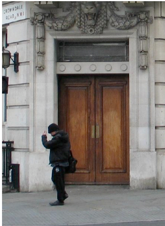
Original doors at corner

The doors are set back into the reveals, providing modeling to the elevation. The doors open outwards over a stone threshold. The doors are hardwood, with a raised panel surrounded by a strong moulding.