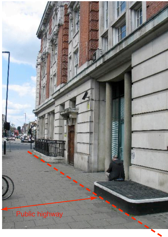
View looking north

The red dashed line indicated the demise of the building (the front area lightwells provide natural lighting to the basement storey). The new outward opening door will not impinge on the public highway.