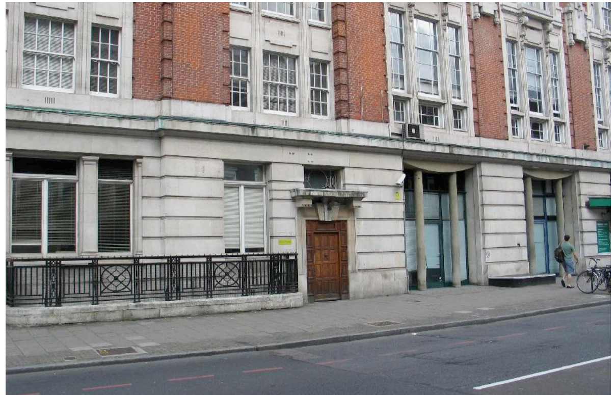
View of final exit door to Staircase J, Eversholt Street

The red dashed line indicated the demise of the building (the front area lightwells provide natural lighting to the basement storey). The new outward opening door will not impinge on the public highway.