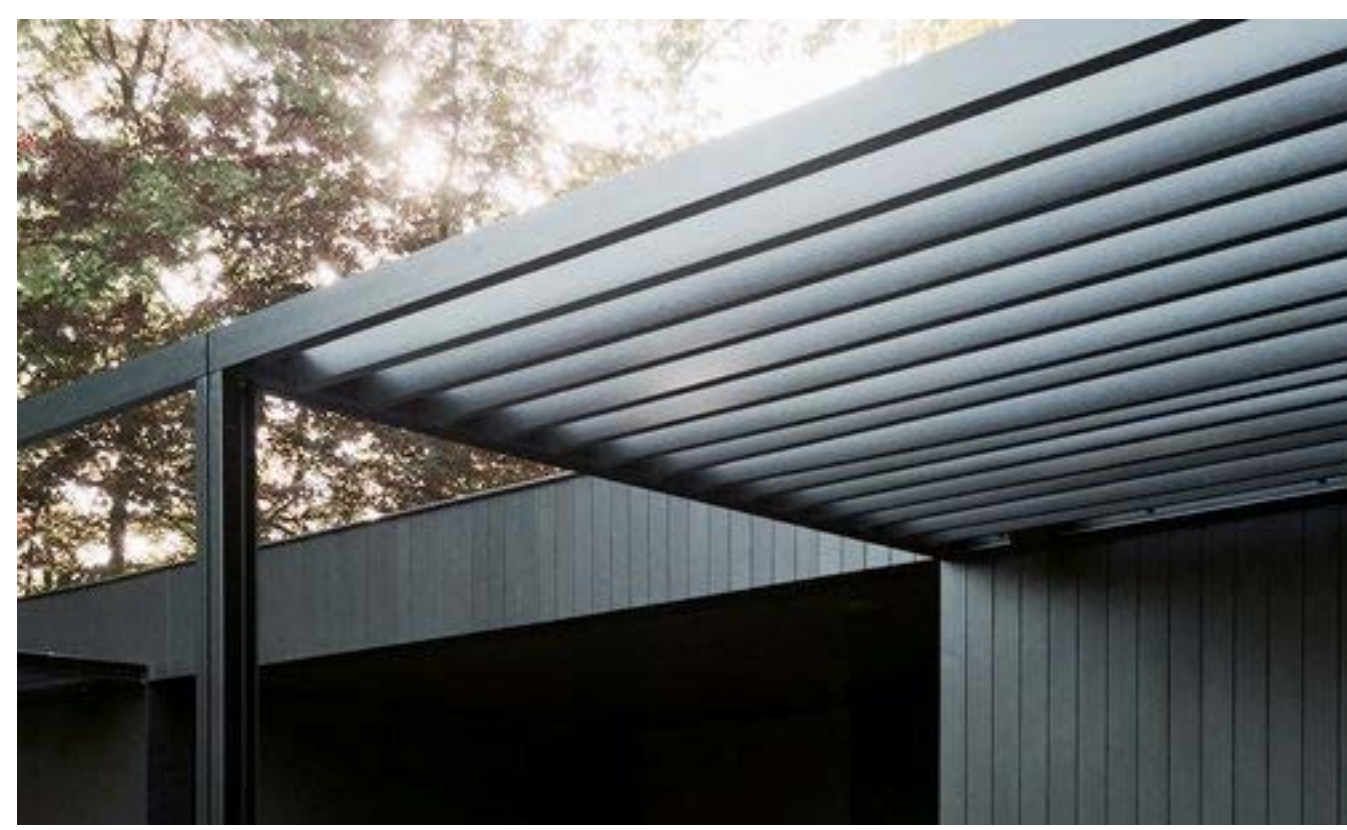
Black painted pergola to work with colours of new house and window frames