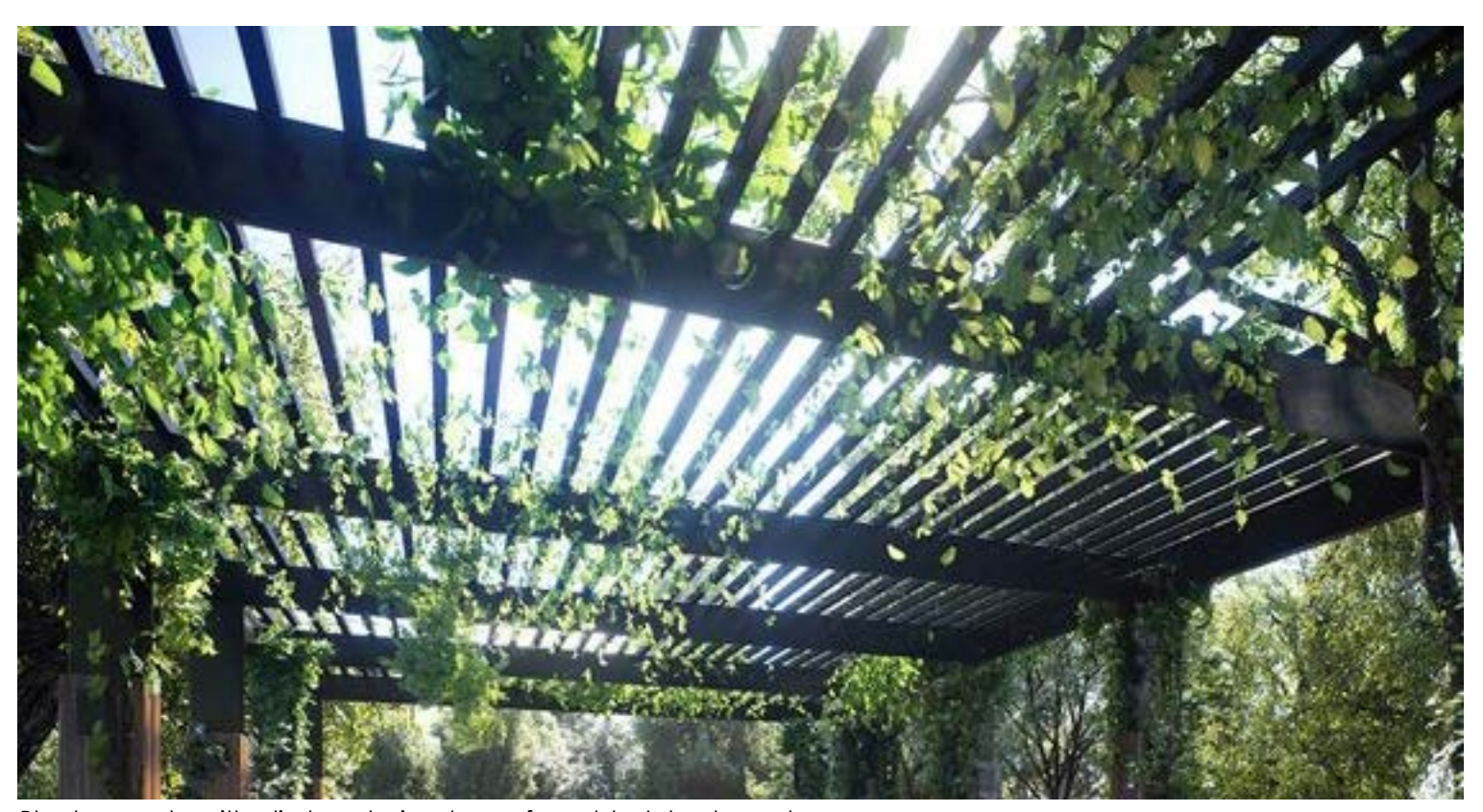
Black pergola with climbers trained over for added shade and greenery