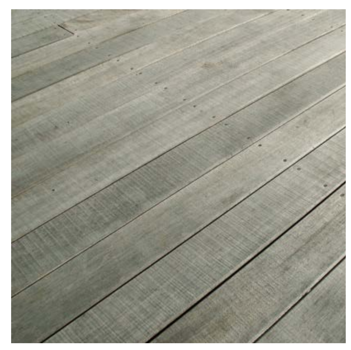
Weathered timber decking