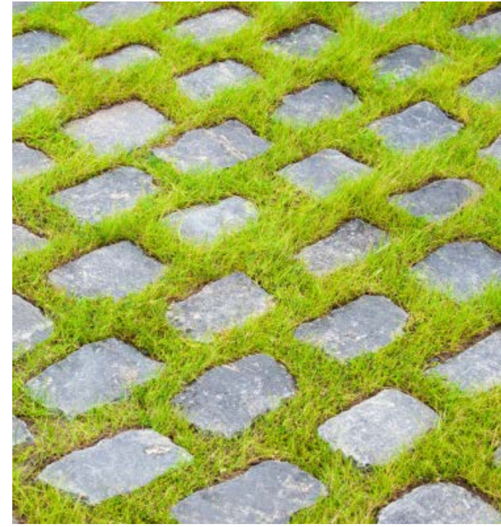
Setts with wide joints of grass