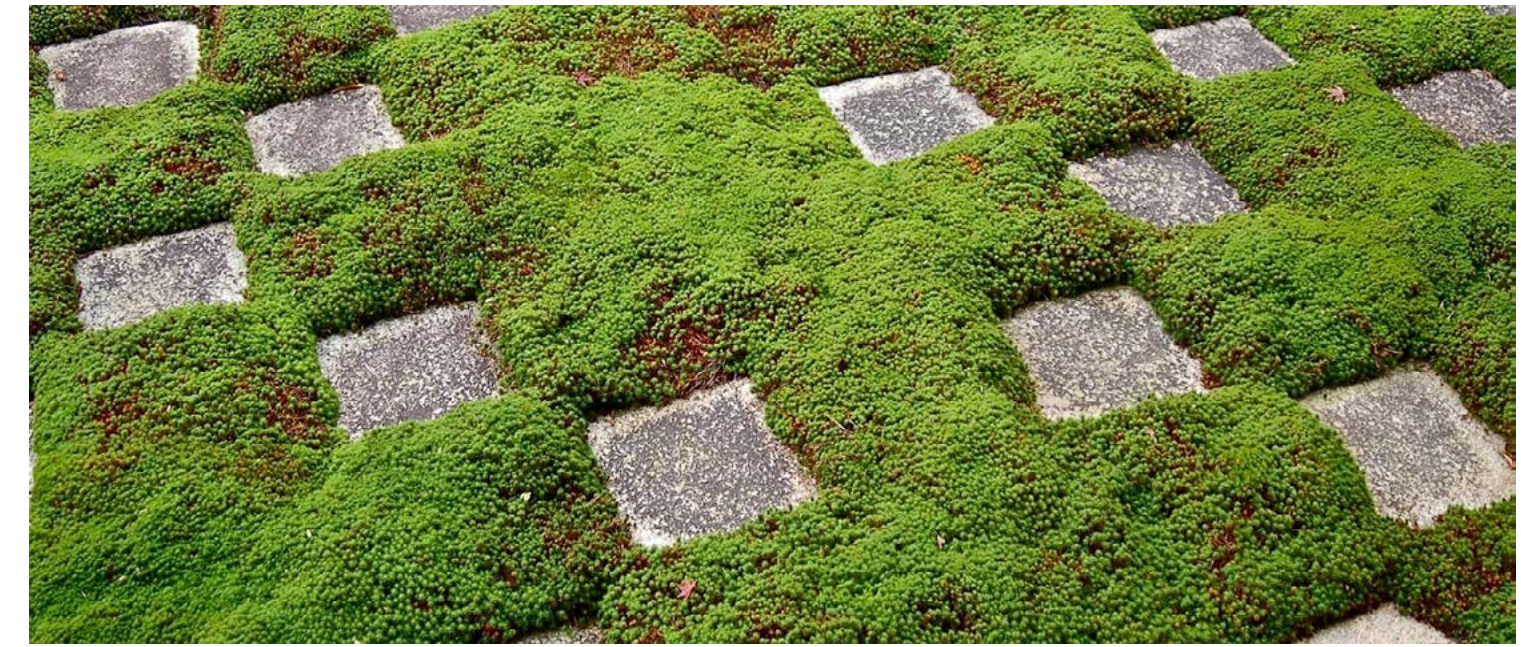
Large stone setts sparsley spaced - possible transition option at drive edge with planting bed