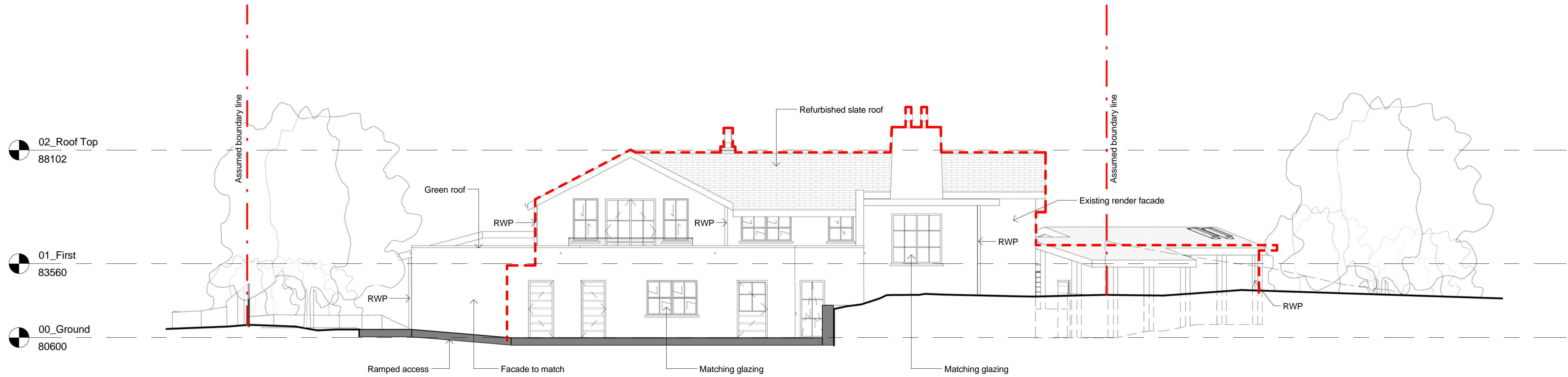
1 Proposed North Elevation 1:100 @ A1