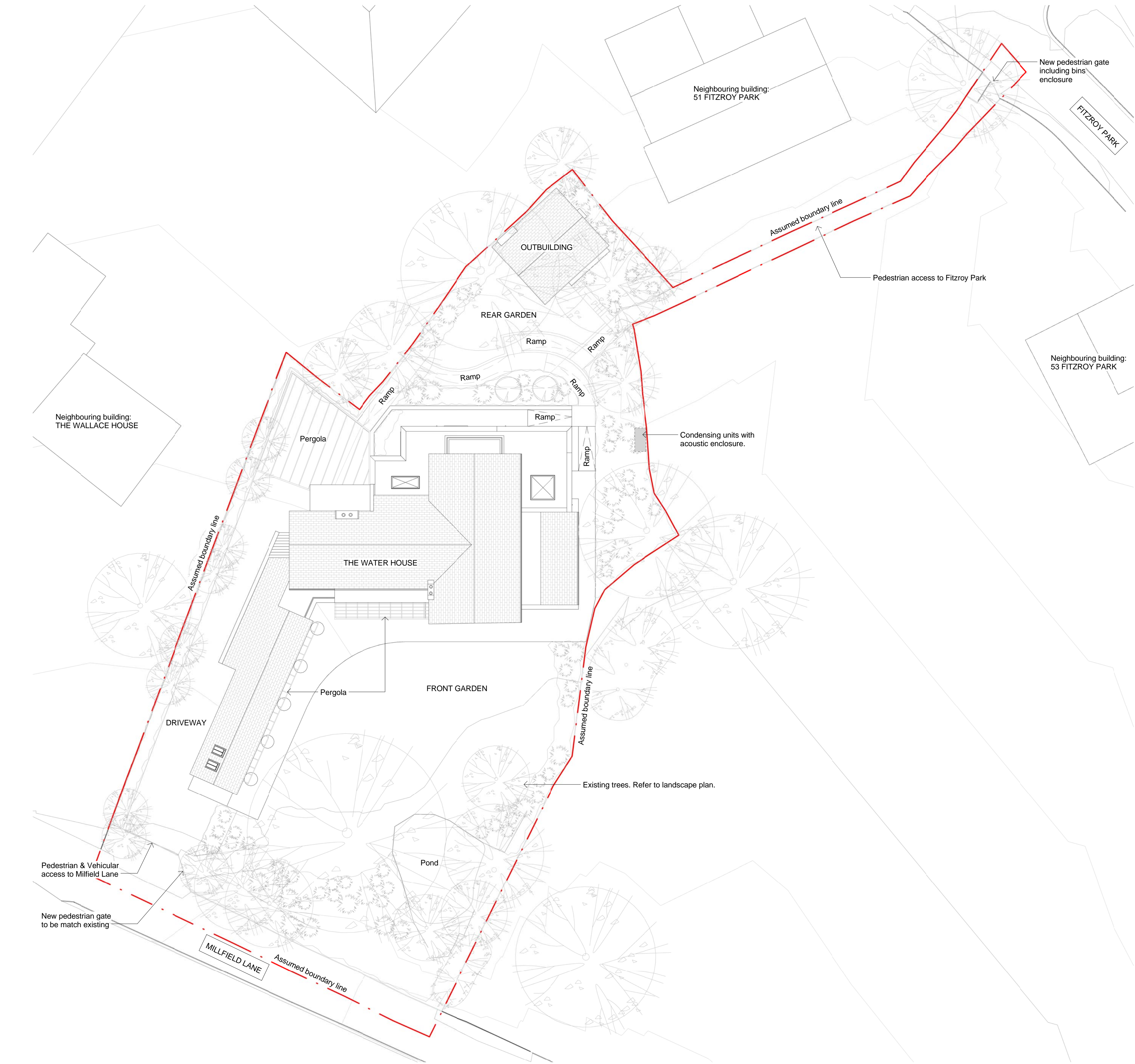
1 Proposed Site Plan 1:200 @ A1