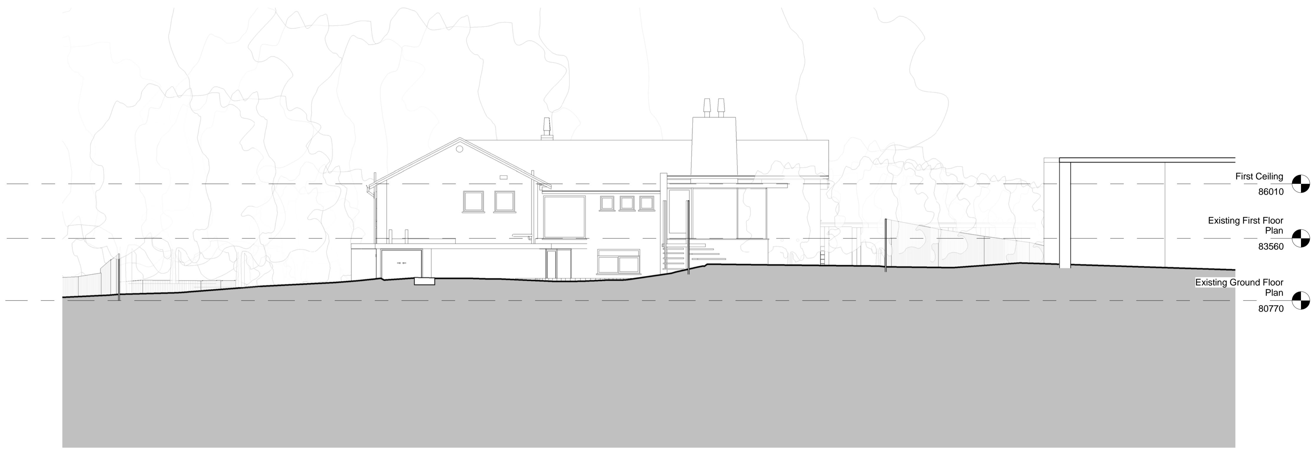
1 North Elevation 1:100 @ A1

Notes/Legends Existing drawings supplied by Laser Surveys. All dimensions, sizes and positions as per Laser Surveys survey. KSR Architects can not take responsibility for any discrepancies on existing building elements.