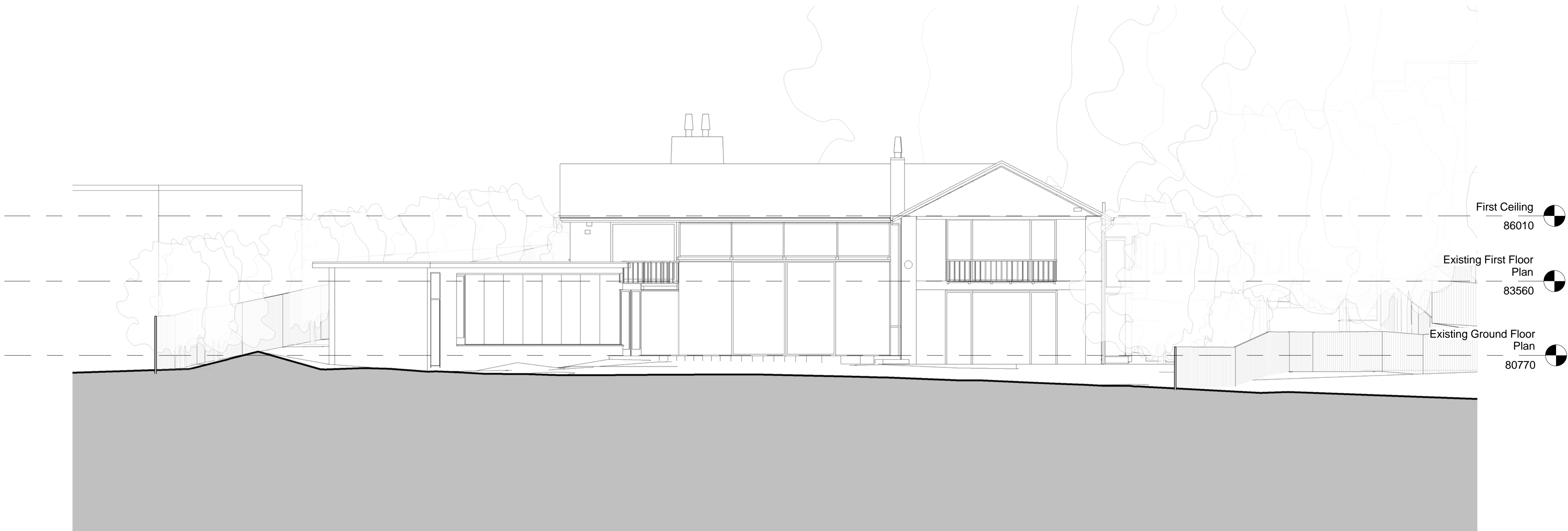
1 South Elevation 1:100 @ A1