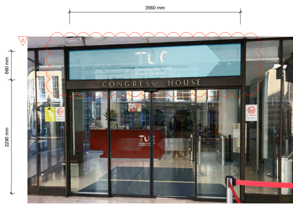
PROPOSED MAIN ENTRANCE NEW SIGNAGE LOCATION 01