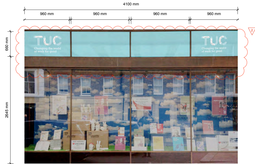
PROPOSED BOOK CASE NEW SIGNAGE LOCATION 02