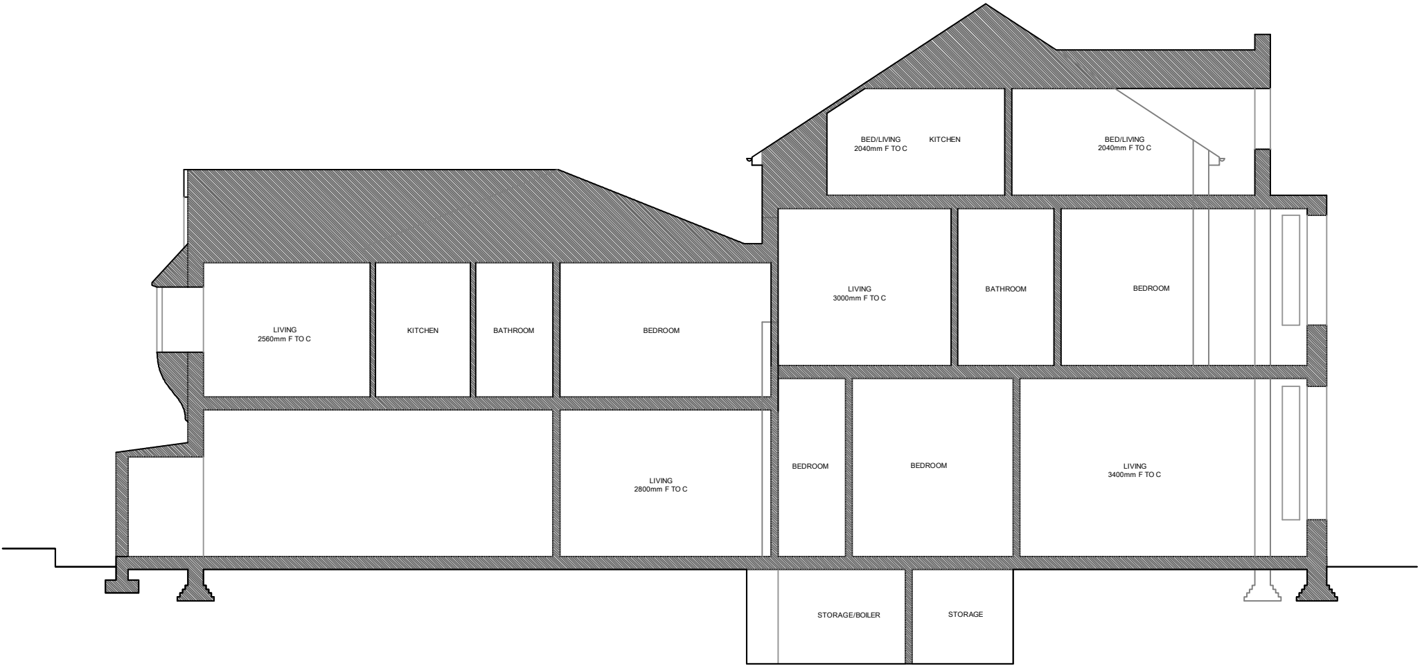
EXISTING SECTION - (Front to Rear)