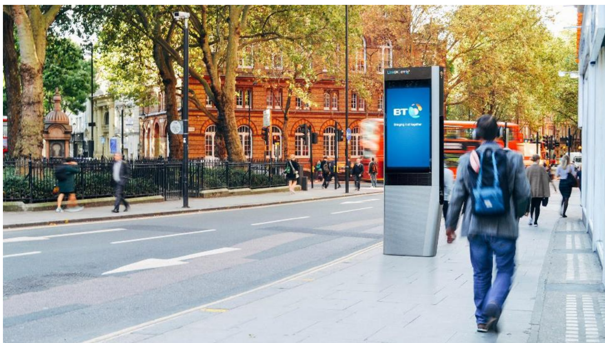
Figure 1: Link unit in Camden

1.4 The Link unit was developed and piloted in New York City and has already begun to be rolled out across New York with transformative results. BT, along with its partners at LinkUK, is seeking to bring the same benefits to the UK, beginning with London.