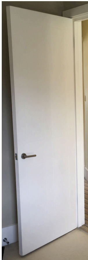
Existing Door- to be replaced with four panel door