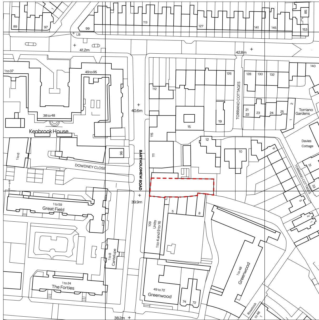
SITE LOCATION PLAN (1:1250)