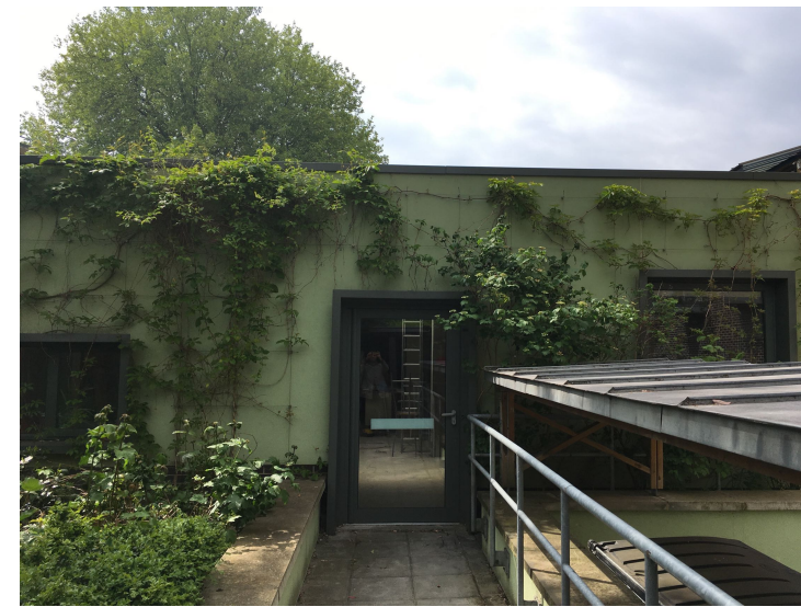
EXISTING ESCAPE DOOR