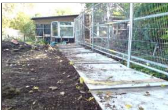
Ground protection image 1: Heavy-duty plywood set onto a compressible woodchip layer and pinned into position is suitable to spread the loading from pedestrian access.

Where it is not practical to protect the CEZ by the use of fencing alone, BS 5837 (6.2.3) allows for the fencing to be set back and the soil protected by ground protection. This allows improved access during construction, with the ground protection preventing damage to the CEZ outside the protection of the fencing. A range of methods can be used, including retaining existing hard surfacing or structures that already protect the soil, installing new materials, or a combination of both. Whatever the choice of method, the end result must be that the underlying soil (rooting environment) remains undisturbed and retains the capacity to support existing and new roots. Ground protection images 1–8 illustrate a range of practical surface coverings that can effectively protect CEZs of retained trees.