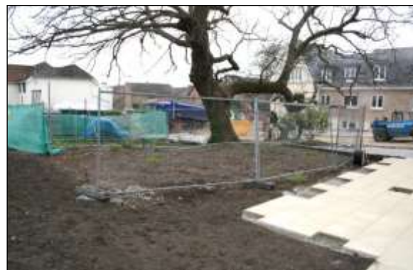
Landscaping image 2: This tree had tarmac parking within its RPA that was removed and replaced with an organic mulch near the trunk and limited no-dig surfacing on the outer edges of its RPA.