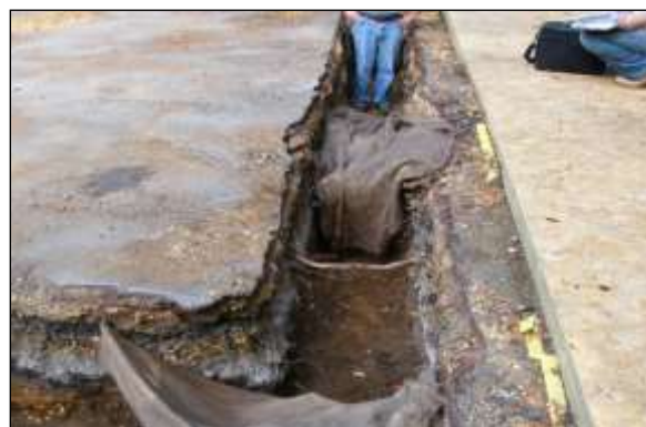
Excavation image 4: Exposed roots must be protected from light, drying out and extremes of temperature by covering with hessian sacking and boards until they can be covered back with soil.