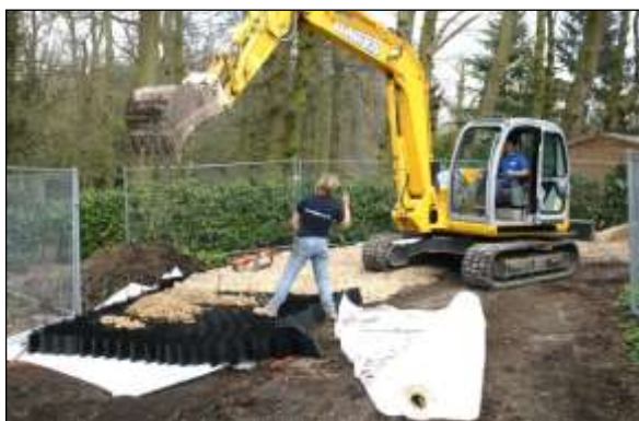
Ground protection image 5: Cellular products are a very effective means of providing ground protection where heavy vehicle use is expected. Here, it is being used to temporarily widen an existing road, to be removed once the construction is finished.