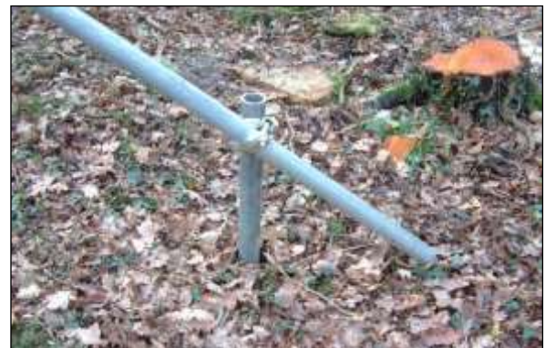
Fencing image 3: Close up of bracing detail, essential for increasing the stability of the vertical framework.

Where individual trunks or branches are vulnerable to impact damage, a framework of scaffold or wood can be constructed to provide protection (Fencing images 4 and 5).