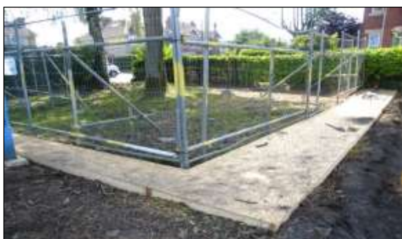
Ground protection image 3: Plywood fixed to a wood frame is another effective method of protecting soil from pedestrian compaction.