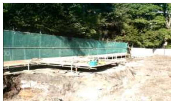
Ground protection image 4: A scaffold framework attached to the main scaffold fencing can be used to support either scaffold planks or plywood to create an elevated platform with a gap beneath.