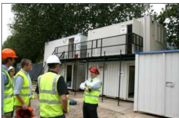
Ground protection image 7: A combination of retaining existing surfacing and using temporary construction cabin accommodation can be a very effective means of preventing damage to sensitive areas.