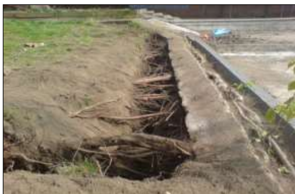
Excavation image 3: Air spades are particularly useful where roots are very dense.