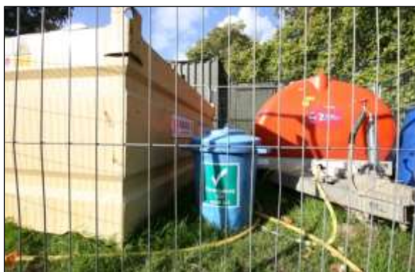
Pollution image 1: Where fuel or other chemicals are stored on site, it is now standard practice to have emergency spillage kits available to restrict the environmental impact of accidents.