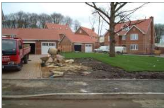
Landscaping image 1: The RPA of this tree was not effectively protected during construction and excessive compaction of the soil meant it died soon after this turf covered up the damage.

the original ground level and have a mulched finish rather than grass to reduce the risk of mowing damage (Landscaping images 1 and 2).