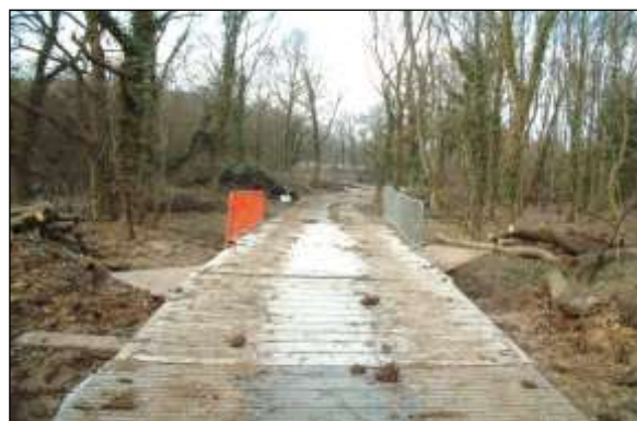
Ground protection image 6: Custom designed sectional tracks can be joined to support very heavy traffic use through sensitive areas.