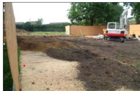
Ground protection image 2: Spreading soil excavated from footings is an effective way of buffering the plywood surface from the wear of light vehicles.