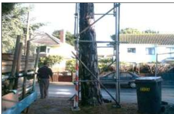
Fencing image 4: A scaffold-braced framework surrounding the trunk reduces the risk of accidental impact.