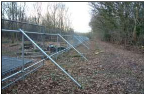
Fencing image 2: Heras fencing wired to scaffold braced posts is a robust and effective interpretation of the BS specification.