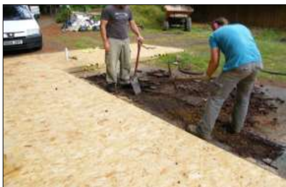
Excavation image 1: Careful hand-digging using conventional tools is acceptable for exposing roots in RPAs.

All soil removal must be done with care to minimise the disturbance of roots beyond the immediate area of excavation. Where possible, flexible clumps of smaller fibrous roots should be retained if they can be displaced temporarily or permanently beyond the excavation without damage. If digging by hand, a fork should be used to loosen the soil and help locate any substantial roots. Once roots have been located, the trowel should be used to clear the soil away from them without damaging the bark. Exposed roots to be removed should be cut cleanly with a sharp saw or secateurs 10–20cm behind the final face of the excavation. Roots temporarily exposed must be protected from direct sunlight, drying out and extremes of temperature by appropriate covering such as dampened hessian sacking (Excavation image 4). If necessary, roots less than 2.5cm in diameter can be cut cleanly without consultation with the supervising arboriculturist. Roots greater than 2.5cm in diameter should be retained where possible and only cut after consultation with the supervising arboriculturist.