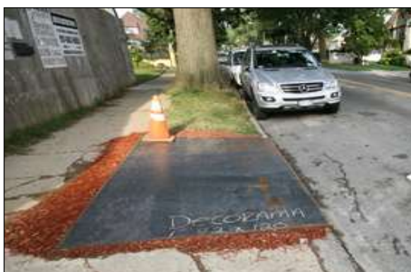
Ground protection image 8: Steel plates can be an effective way of temporarily reinforcing weak surfacing over a construction access during the development activity.

On this site, all the precautionary areas annotated with yellow shading on the tree protection plan should be protected with ground protection while vulnerable to damage, in line with the above examples. Where appropriate, any existing hard surfacing can be retained and utilised. Any surfacing to be retained that is disrupted during the course of the construction activity can be replaced, reconditioned or upgraded as necessary. This work should be subject to arboricultural supervision.