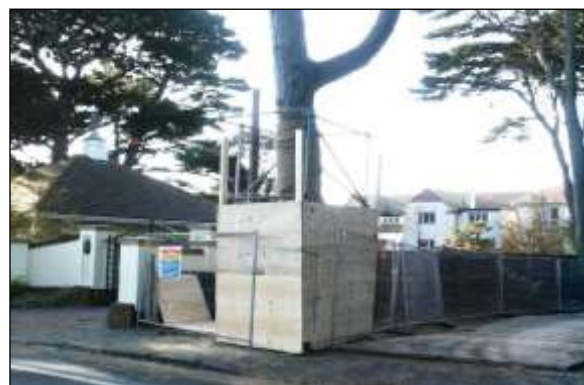
Fencing image 5: Board secured to scaffold framework adds another layer of protection for vulnerable trunks and branches