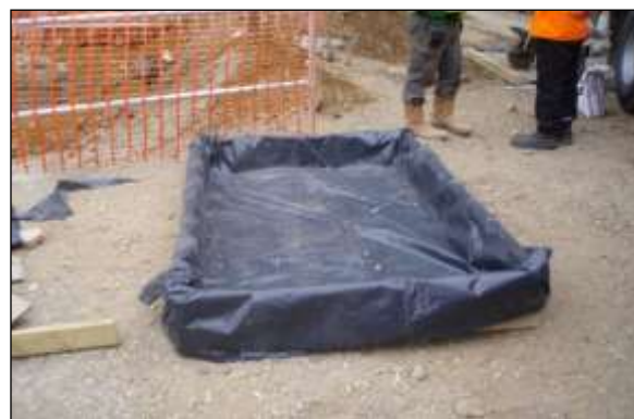
Pollution image 2: Soil bunding or a supporting framework covered in heavy-duty plastic sheeting is essential where there is a risk of spillages contaminating RPAs. This specifically applies to cement mixing areas and vehicle washing facilities.