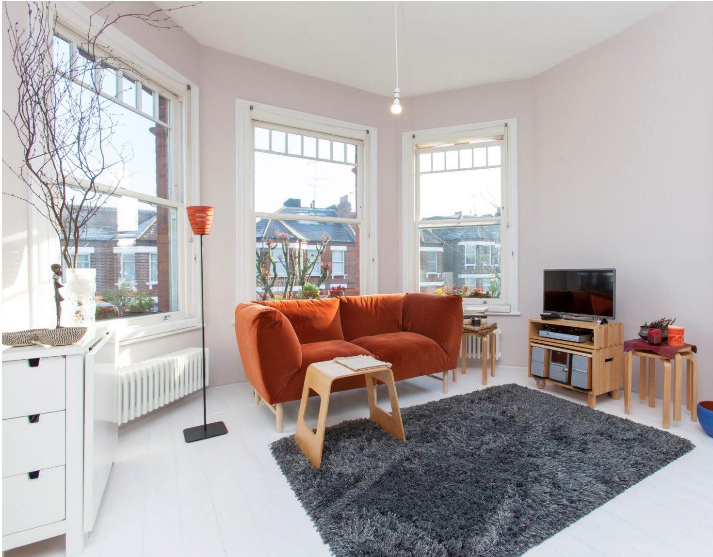
Open living area in flat 5