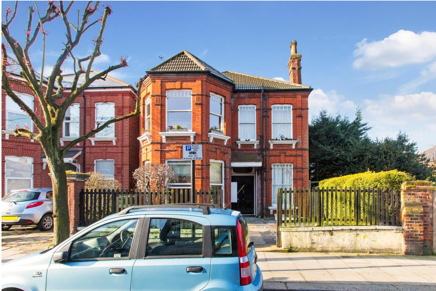
Front elevation of 136 Fordwych road