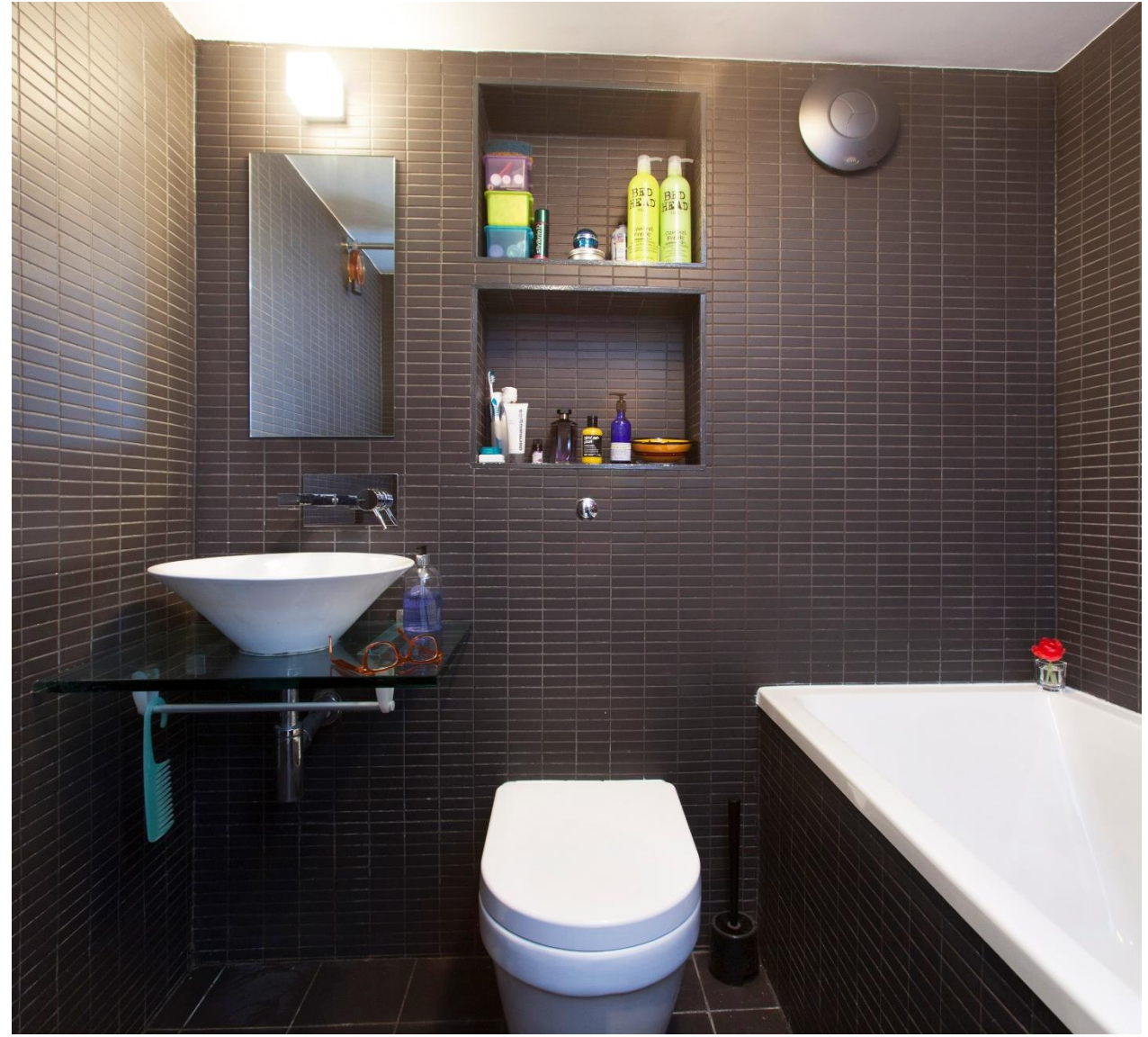
Bathroom area in flat 5, with shower bath and wc