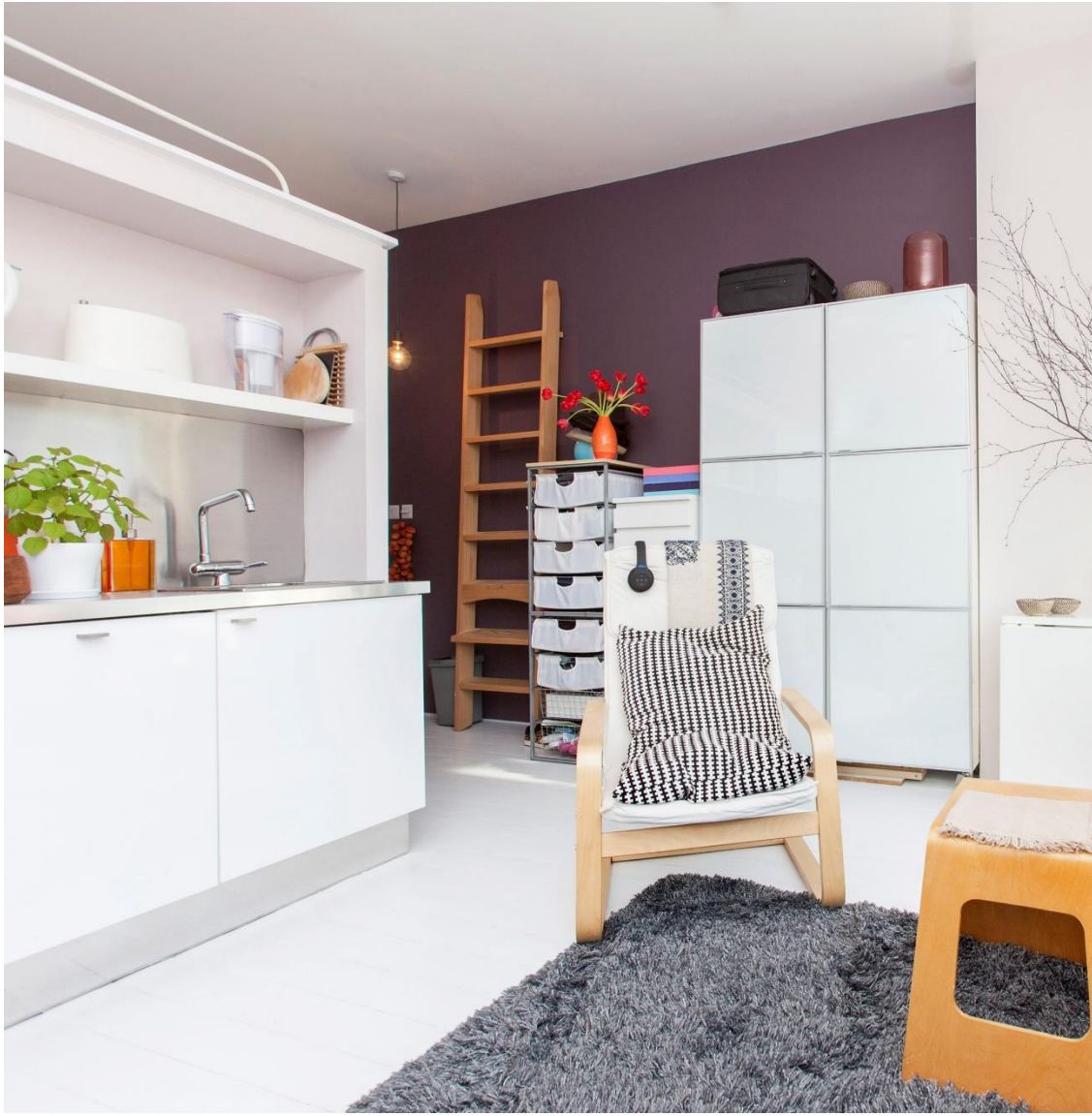
Living / kitchen area in flat 5