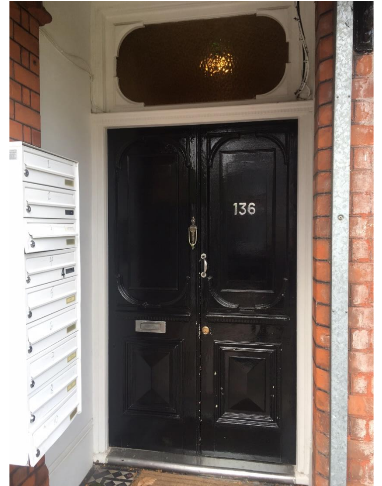
Front door of 136