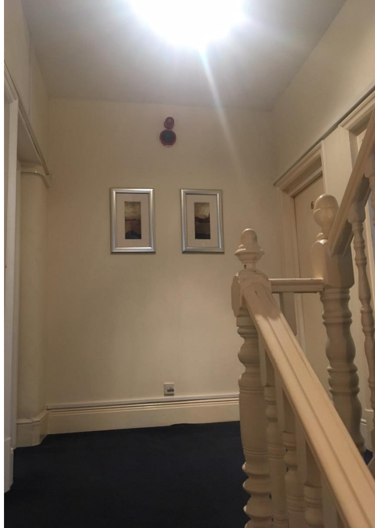
Communal hallway first floor with doors to flats