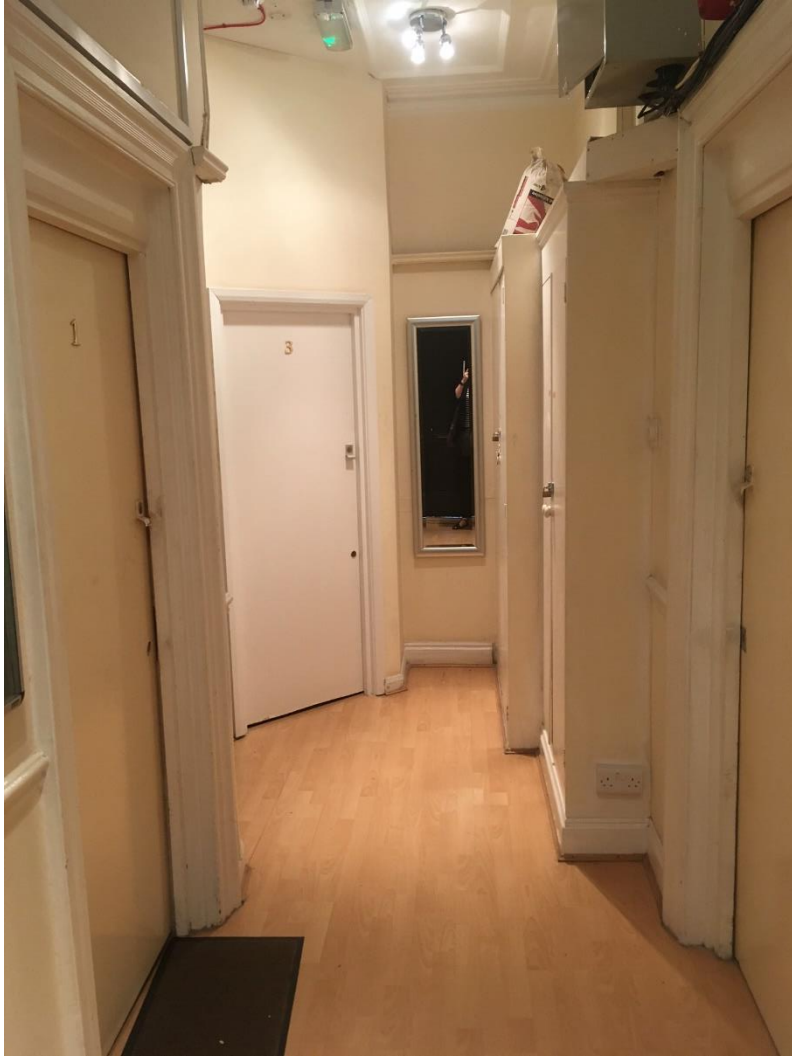
Communal hallway ground floor with doors to flats and meter cupboard