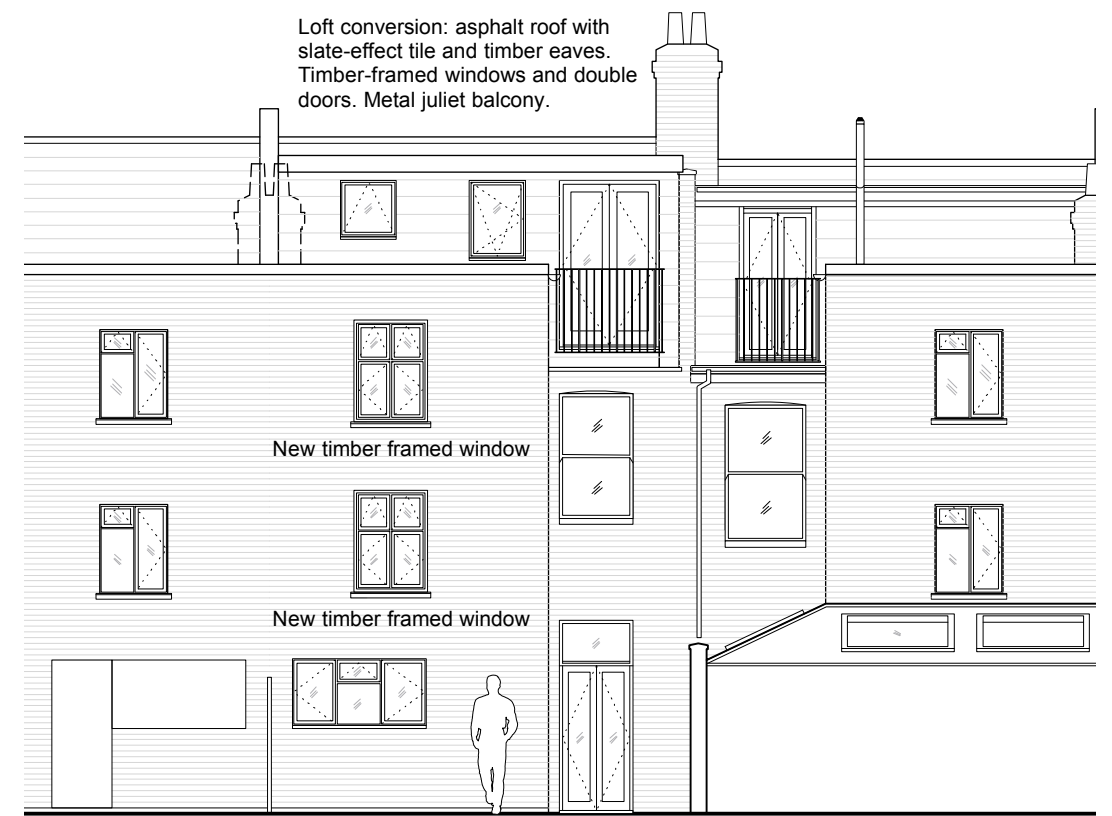
3 Proposed Rear Elevation