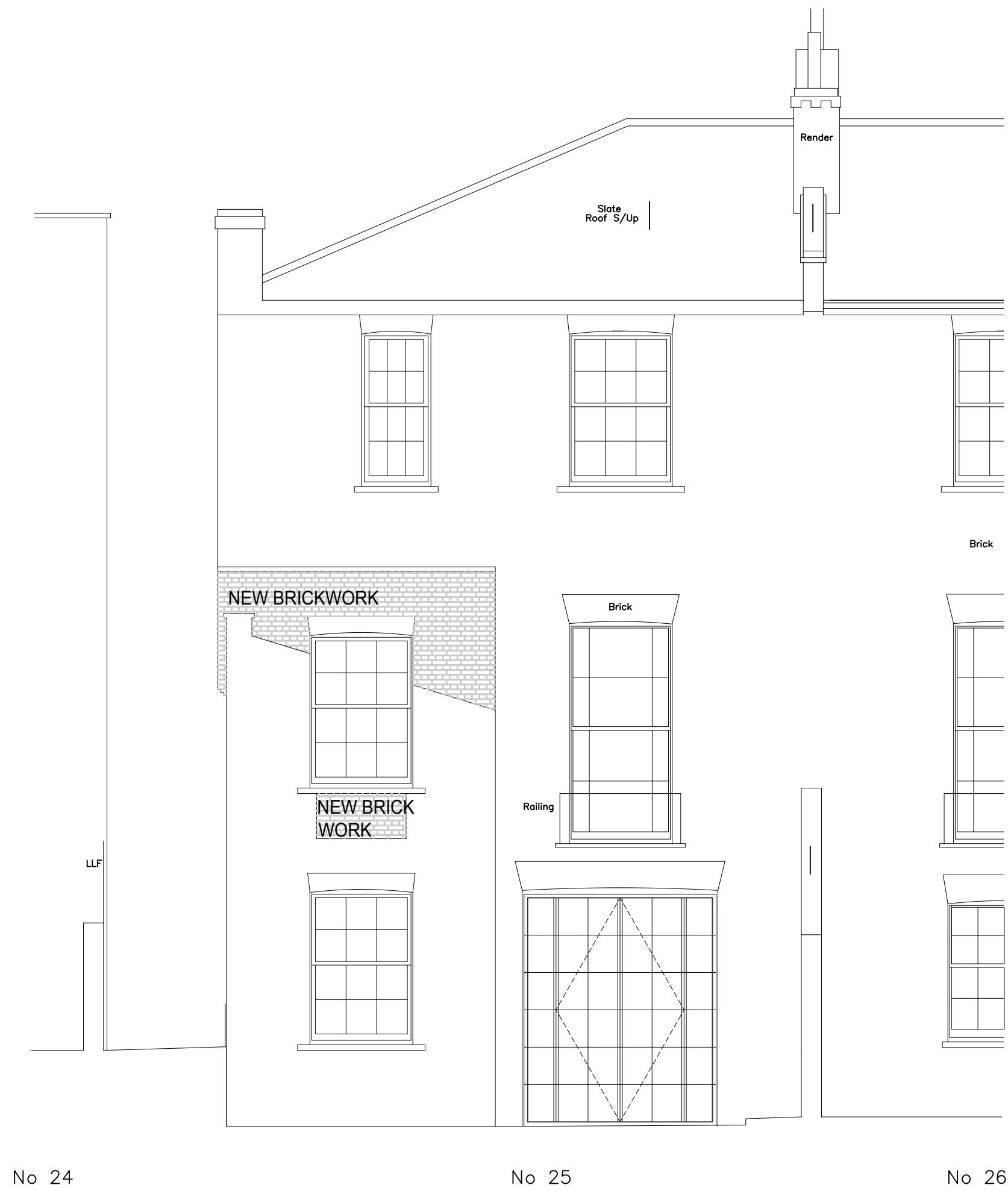
03 PROPOSED NORTH ELEVATION 1:50 @ A1 / 1:100 @ A3