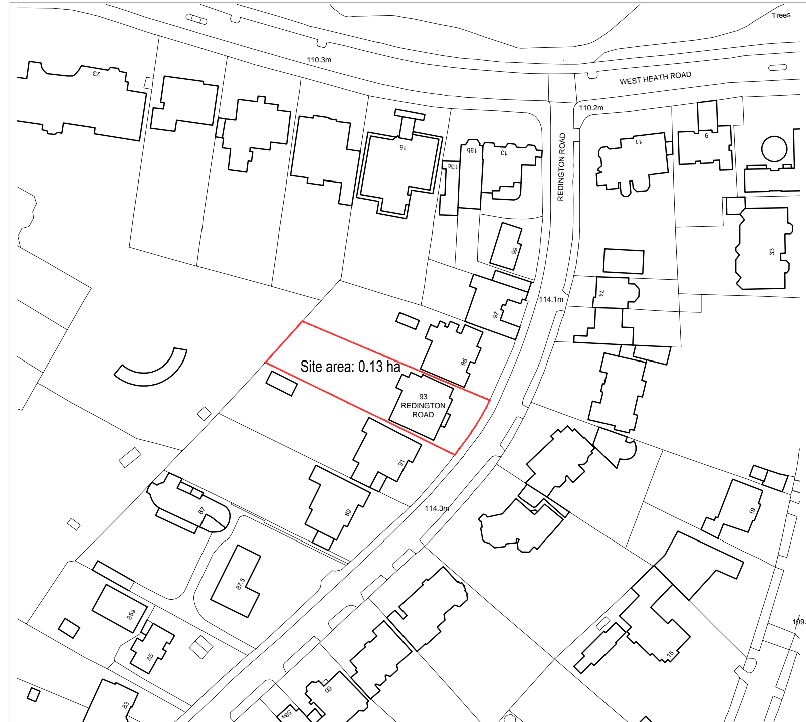
01 Existing Plan - Site Location Map D(0)1000 SCALE: 1:1250