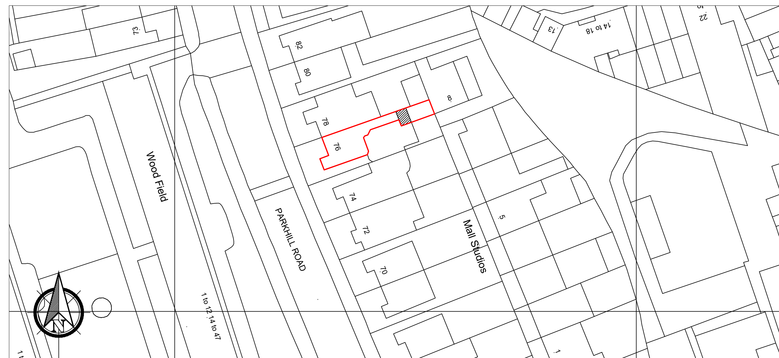
PROPOSED BLOCK PLAN (SCALE 1:500)

Finishes: New walls - brickwork to match existing Windows - Timber sash to match existing Roof - EDPM membrane finish to flat roof Roof - Aluminium glass roof lights where indicated Doors - double sliding aluminium doors to rear elevation Rainwater goods - to match existing Boundary wall - brick wall with timber infill at 1800mm high