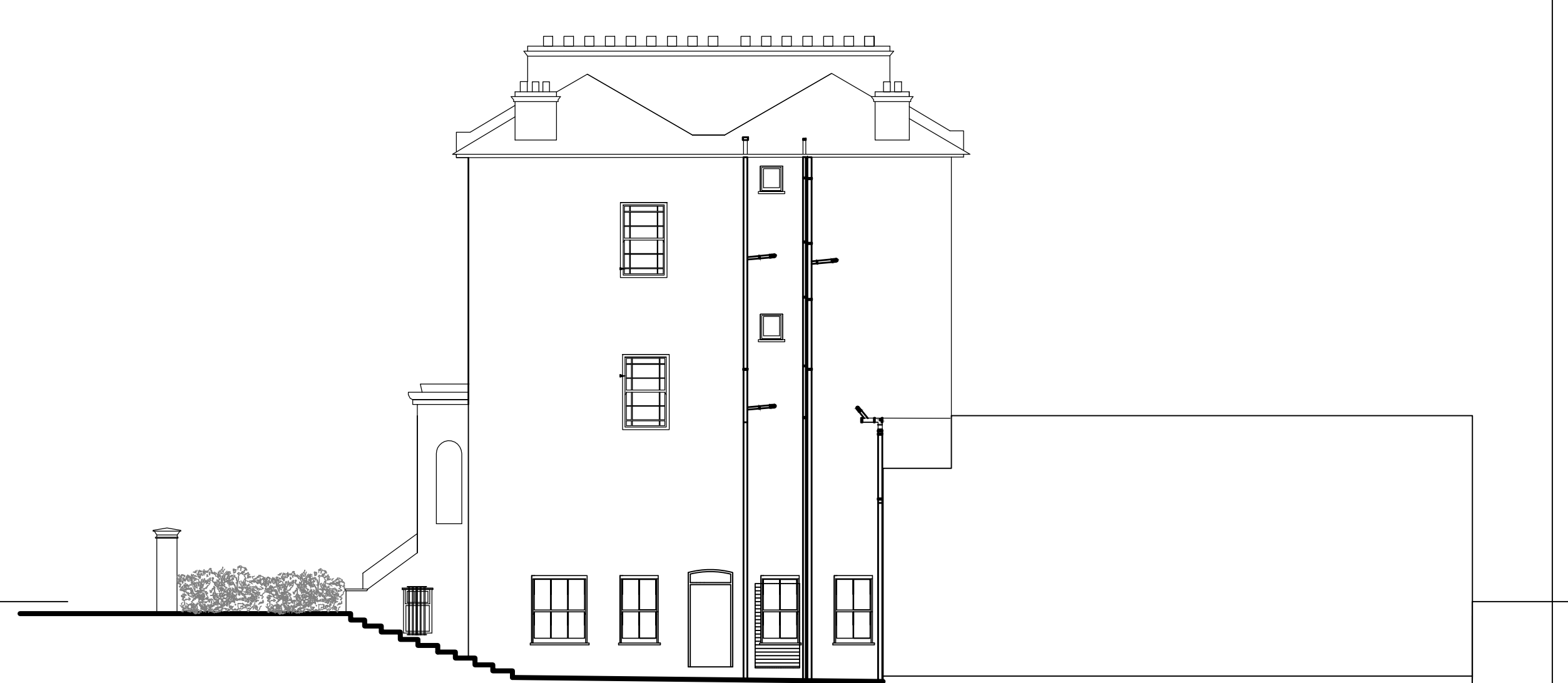
PROPOSED SIDE ELEVATION (FROM NO. 74)