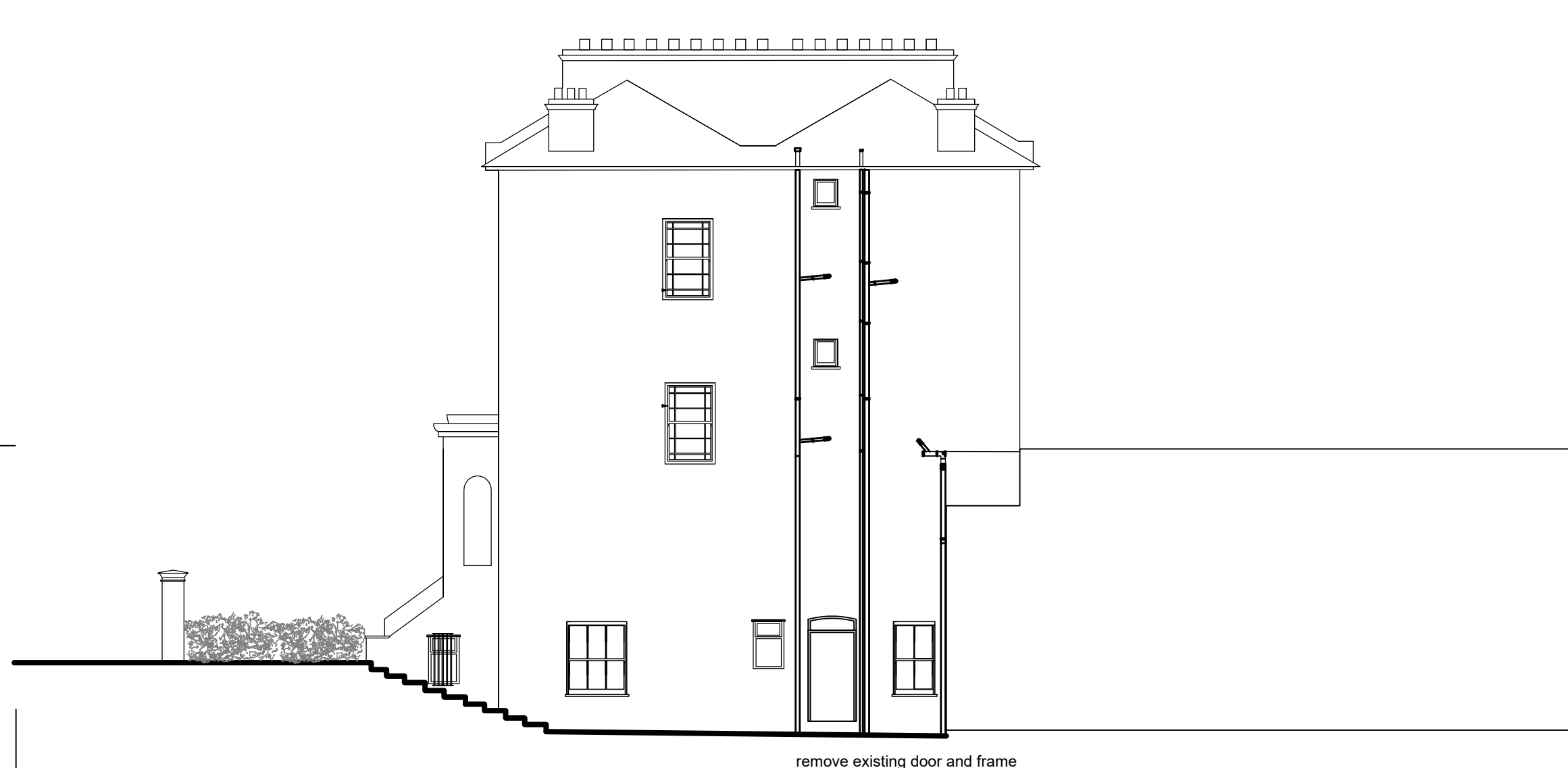
EXISTING SIDE ELEVATION (FROM NO. 74)