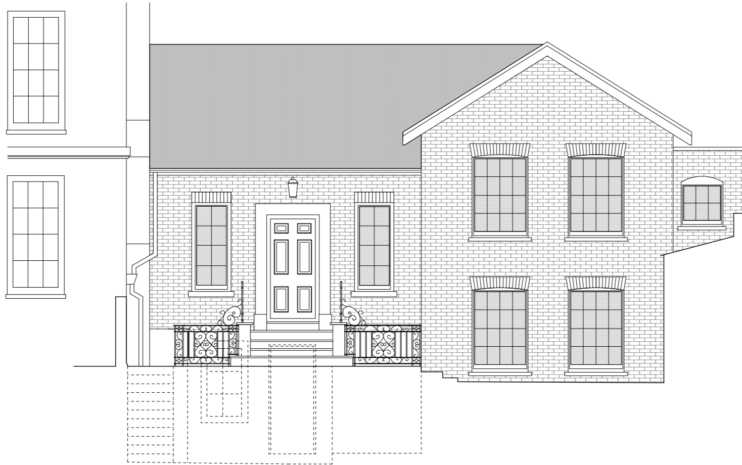
No. 1 Old Hall - Existing front facade

The main facade has been altered since 1971, and now features four identical, symmetrically arranged sash windows to the front gable.