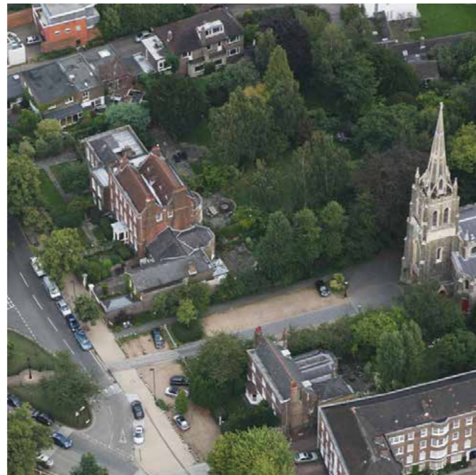
EXISTING BUILDING THE OLD HALL, HIGHGATE - Design & Access Statement: Front Alterations