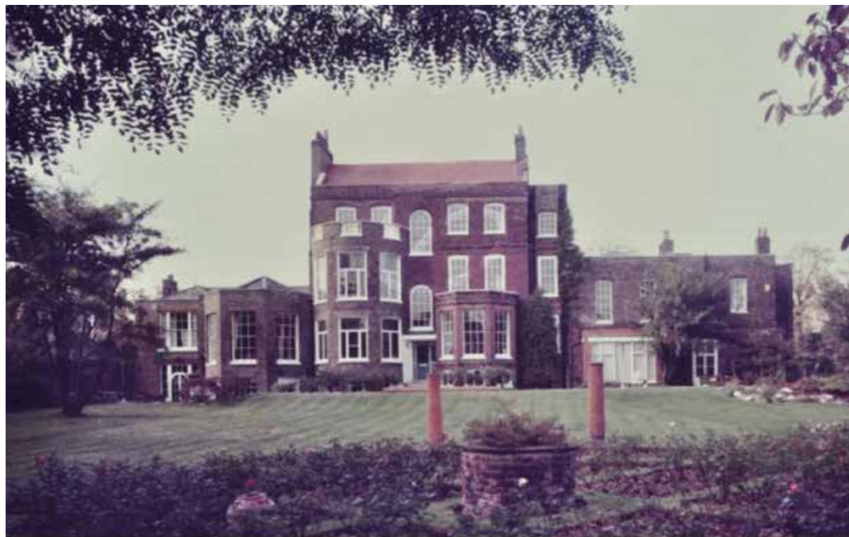
The Old Hall rear facade in 1983, prior to the conservatory construction