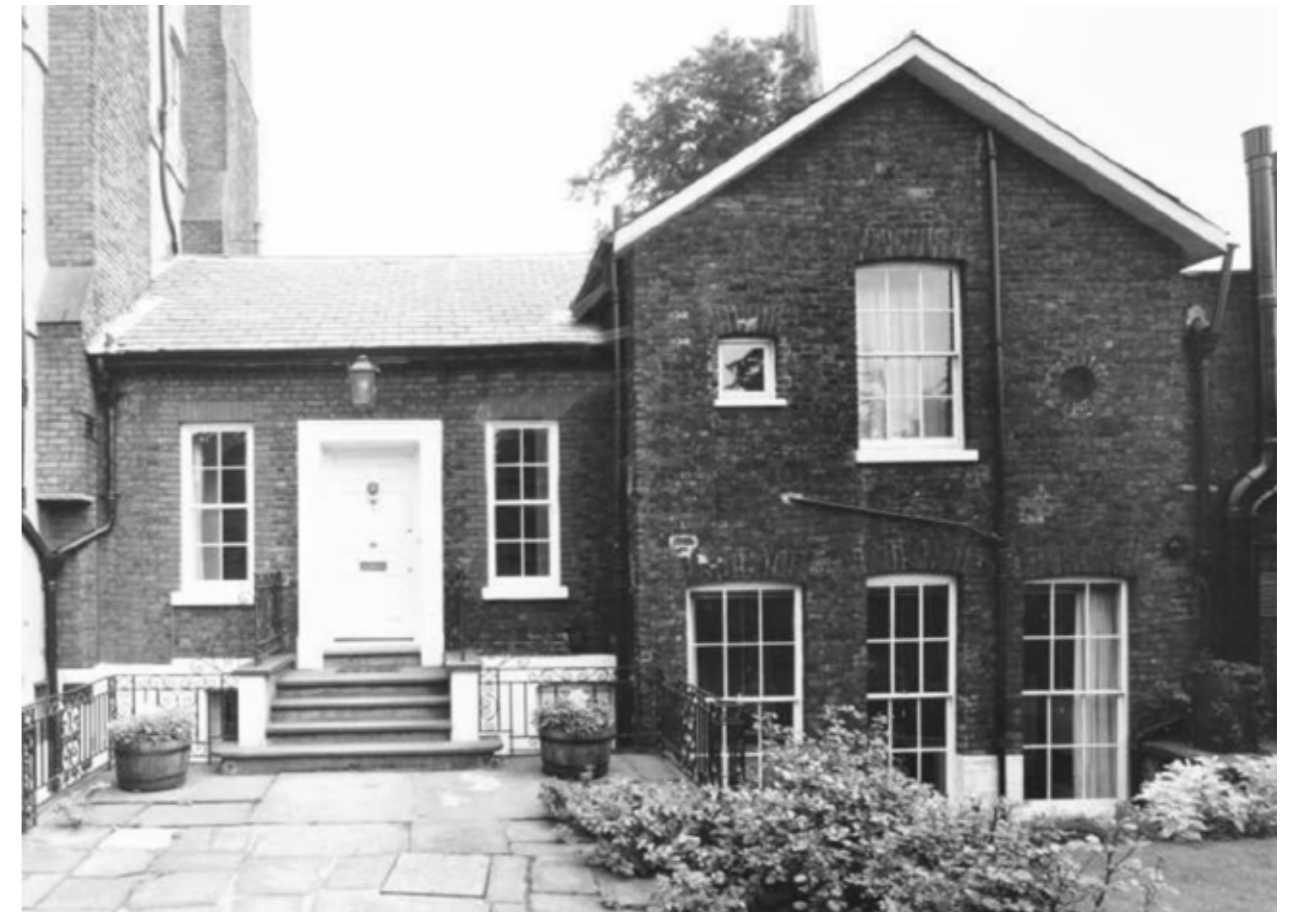
No. 1 Old Hall front facade in 1971, prior to the front extension construction