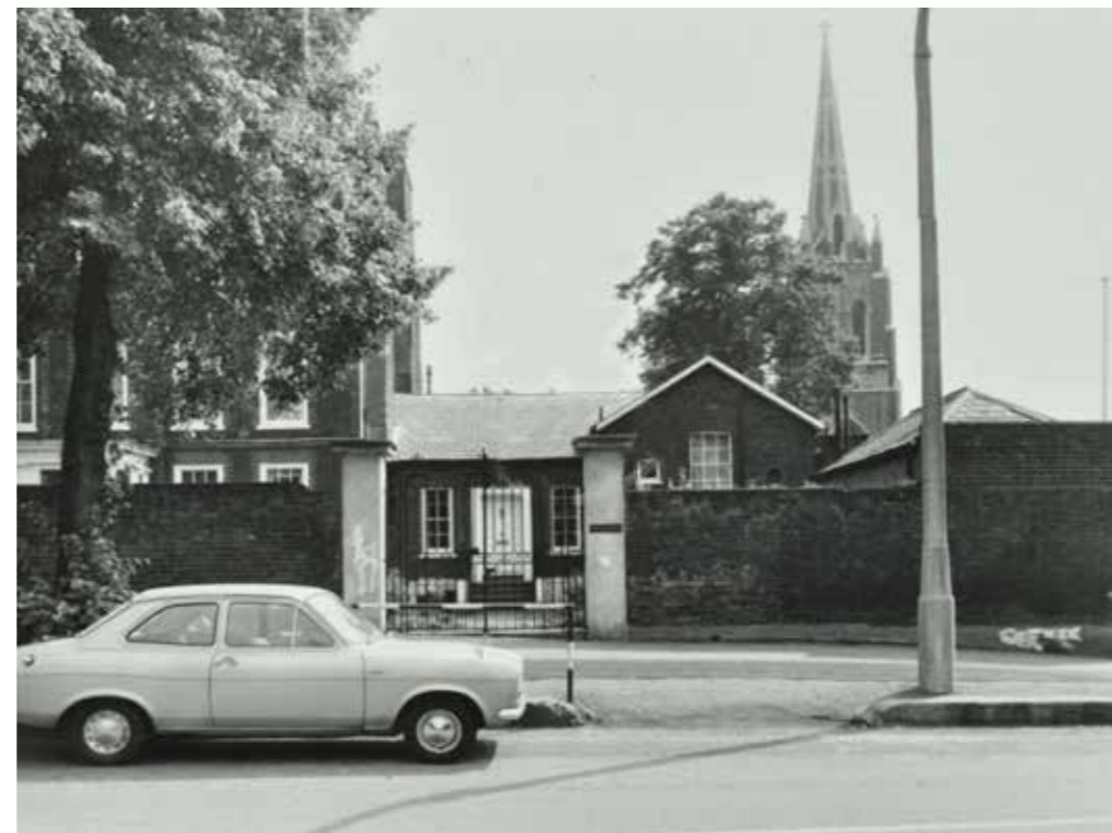
Western wing street view in 1971, prior to the front extension construction