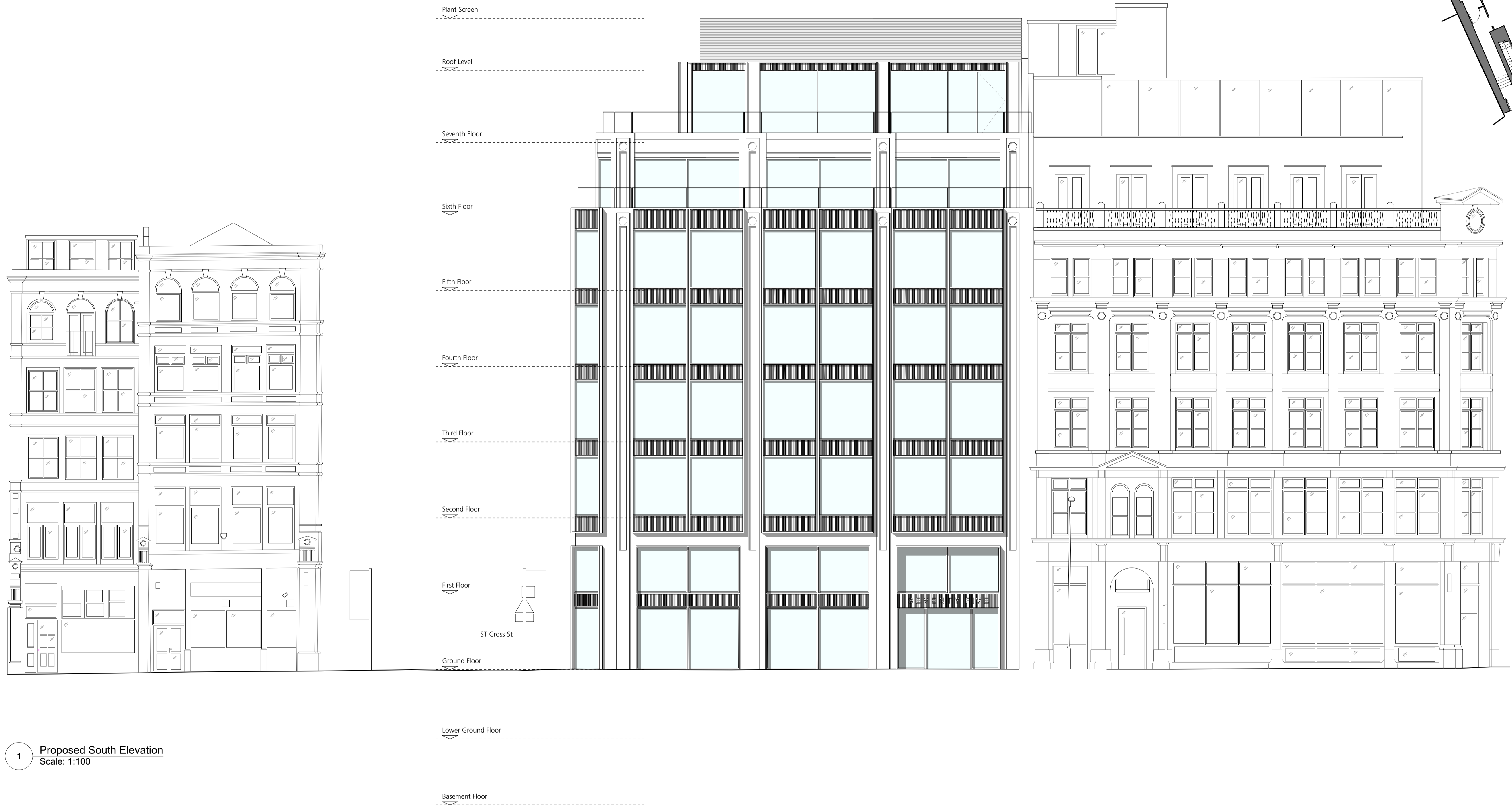
1 Proposed South Elevation Scale: 1:100