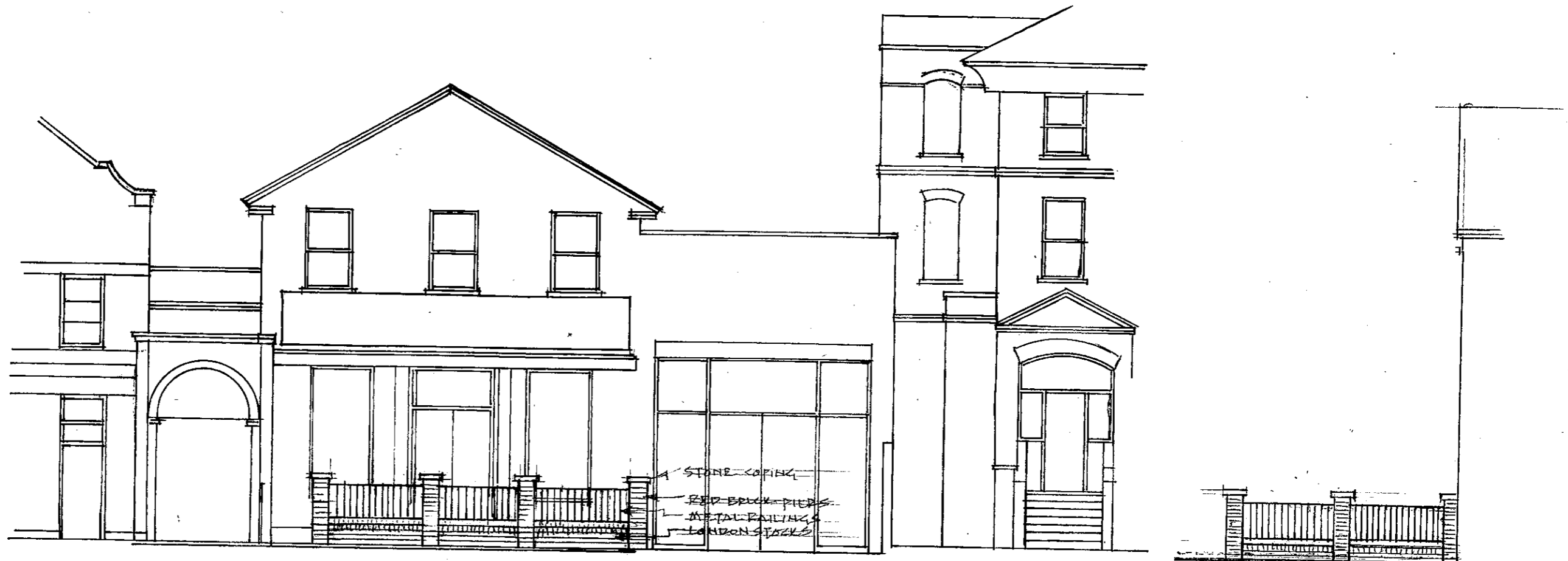
STONE COPING SIDE ELEVATION