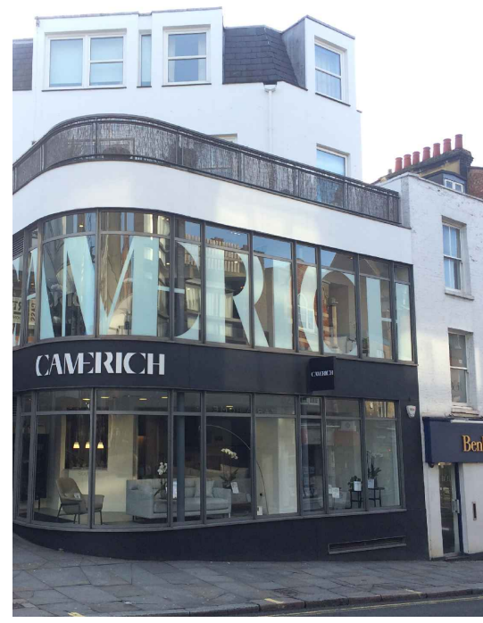
Existing street view photograph NTS@A3

Note: It is understood that the existing signage has been removed by previous tenant.