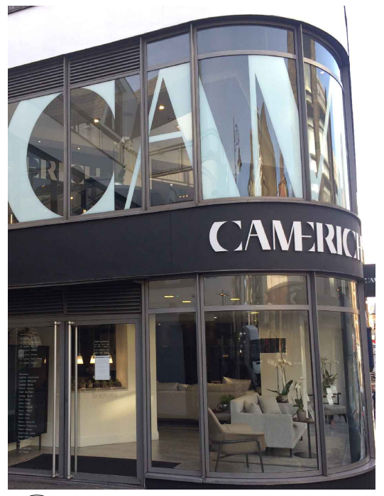
Existing entrance photograph NTS@A3

Note: It is understood that the existing signage has been removed by previous tenant.