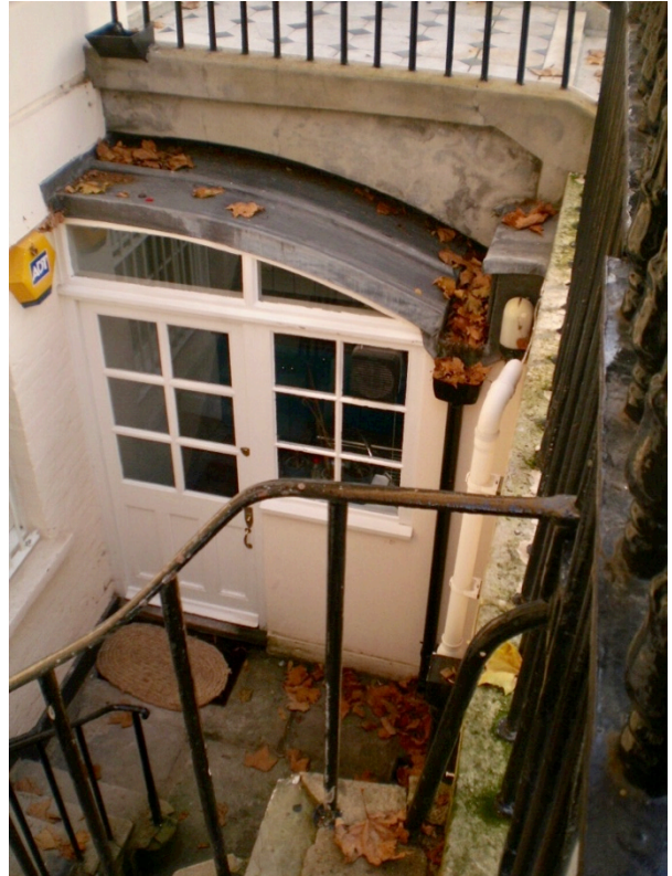
No. 10 Basement Area, Non-original door & window infill under bridge - No Significance.