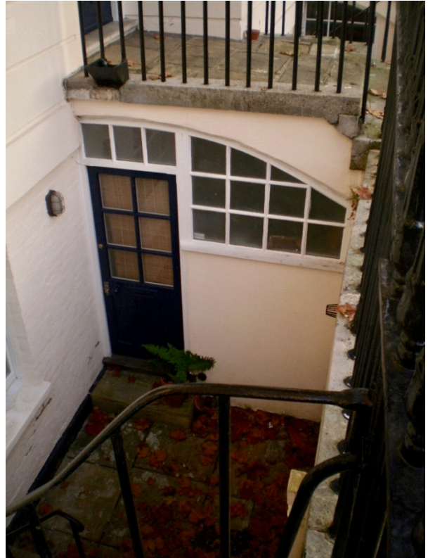
No. 6 Basement Area, Non-original door & window infill under bridge - No Significance.