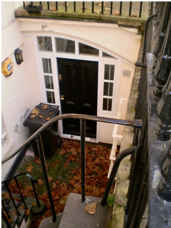
No. 7 Basement Area, Non-original door & window infill under bridge - No Significance.