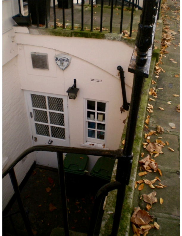
No. 14 Basement Area, Non-original door & window infill under bridge - No Significance.