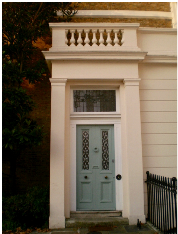
No. 22 Original Portland stone steps, four-panelled door with ogee bolection mouldings with central beaded moulding division - High Significance. Glazing, a later alteration.