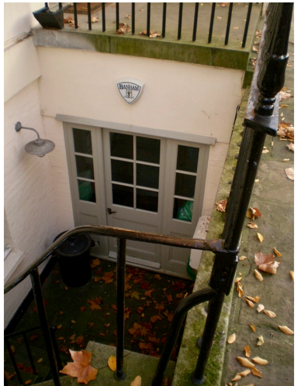
No. 12 Basement Area, Non-original door & window infill under bridge - No Significance.