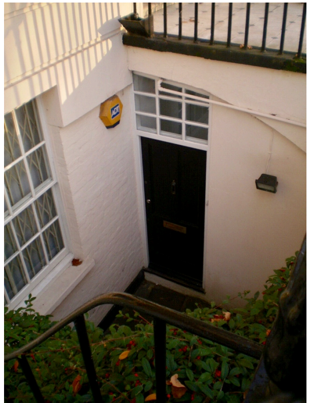
No. 16 Basement Area, Non-original door infill under bridge - No Significance.