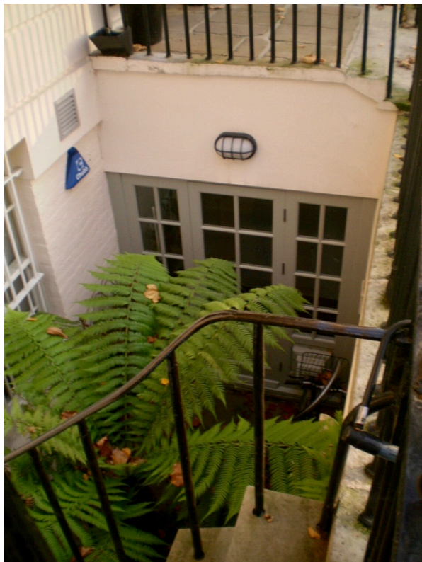
No. 11 Basement Area, Non-original door & window infill under bridge - No Significance.