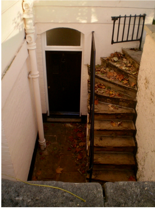
No. 1 Basement Area Stone steps. Door possibly original - Medium Significance.