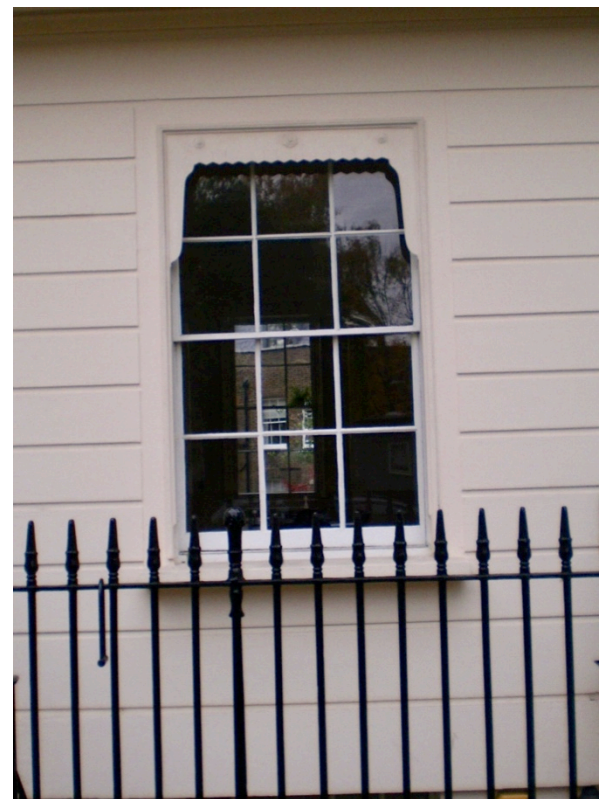
Historic window blind box example, slightly different design - High Significance.