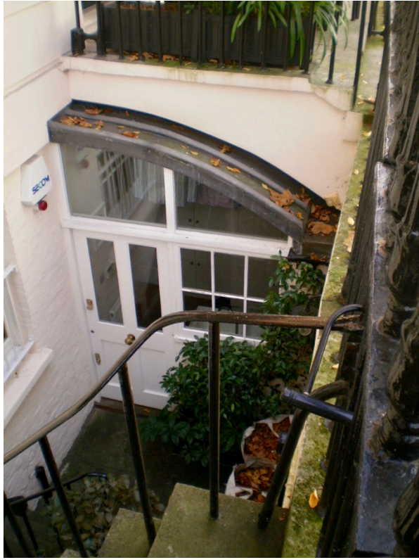
No. 13 Basement Area, Non-original door & window infill under bridge - No Significance.