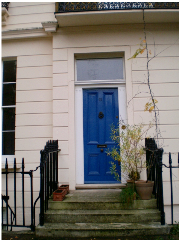
No. 21 Four-panelled door with ogee bolection mouldings - High Significance. Steps and landing reconstructed in Portland stone - Low Significance.