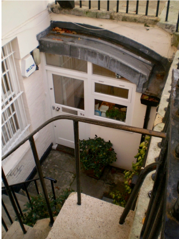
No. 9 Basement Area, Non-original door & window infill under bridge - No Significance.