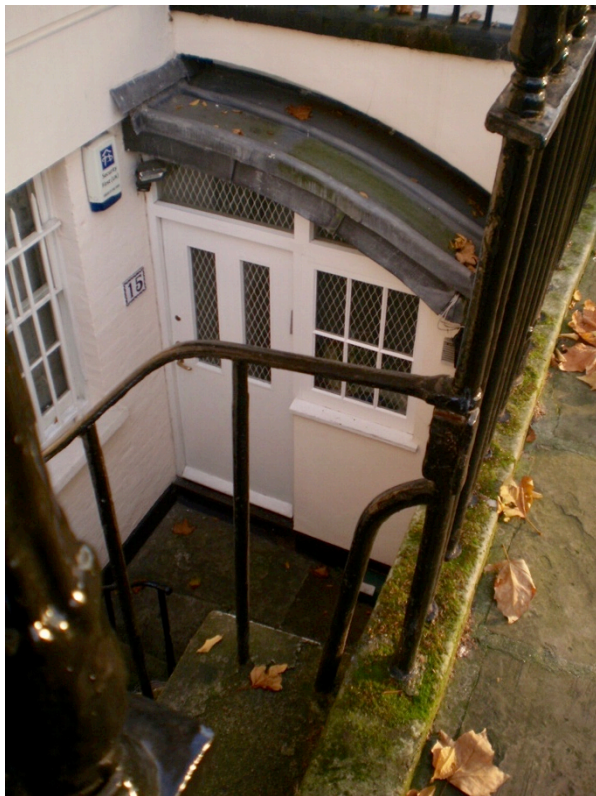
No. 15 Basement Area, Non-original door & window infill under bridge - No Significance.