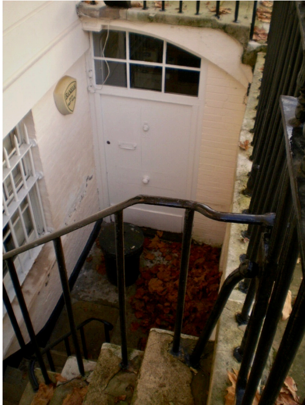
No. 5 Basement Area, Non-original door & window infill under bridge - No Significance.