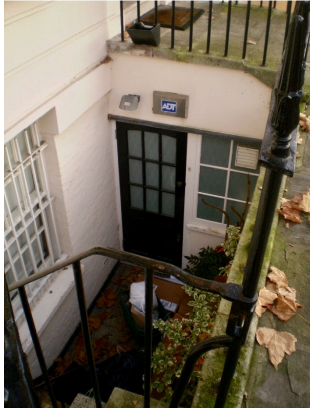
No. 2 Basement Area, Non-original door & window infill under bridge - No Significance.