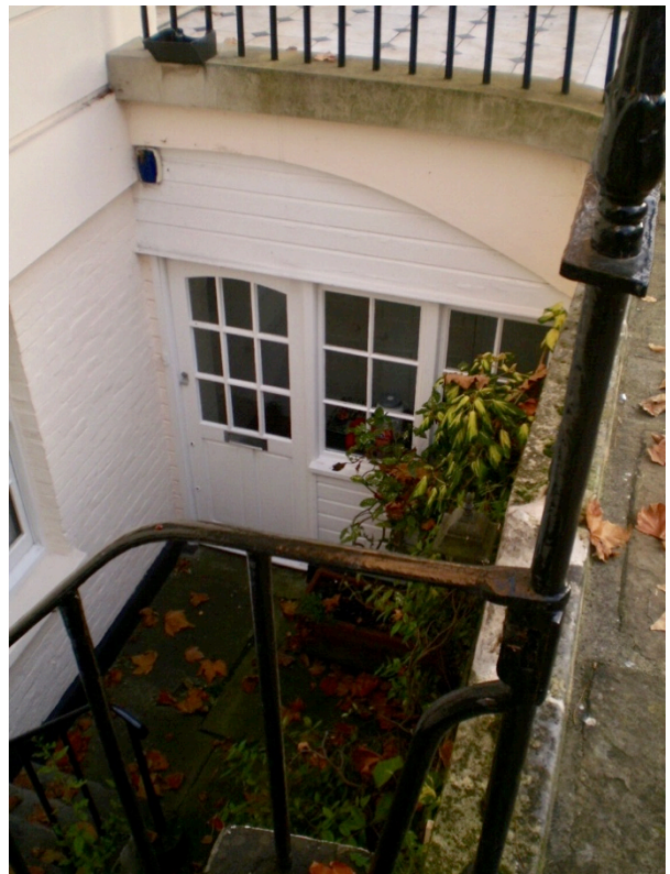
No. 8 Basement Area, Non-original door & window infill under bridge - No Significance.