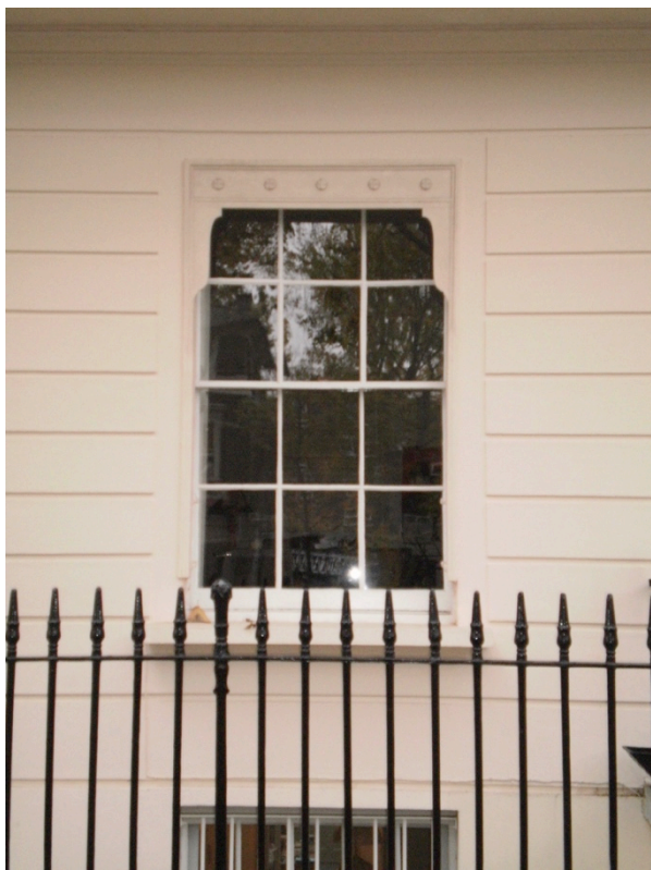
Historic window blind box example - High Significance