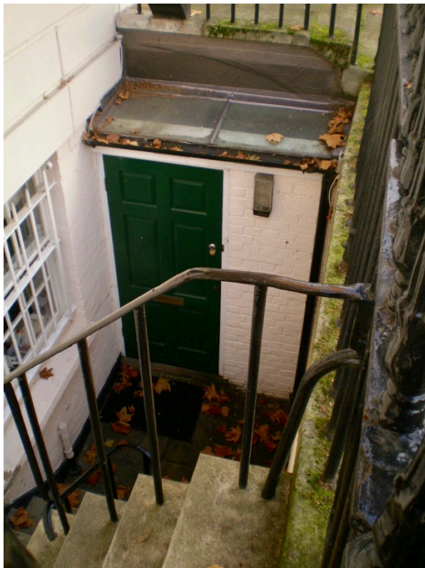
No. 3 Basement Area, Non-original door infill under bridge - No Significance.