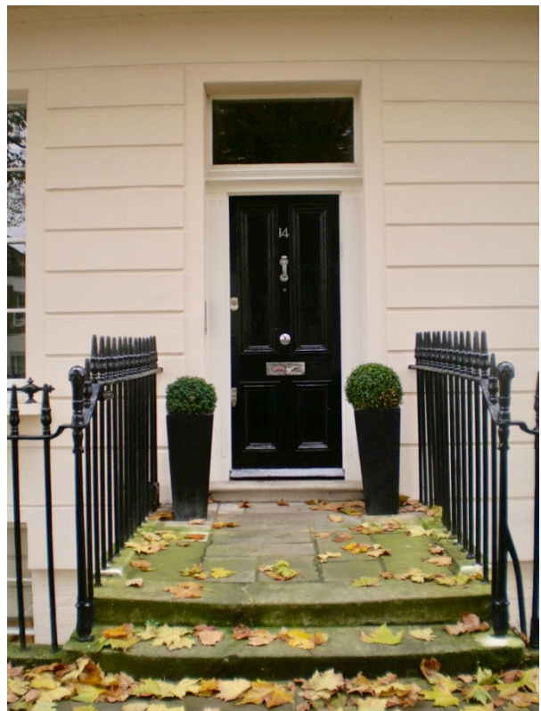
No. 14 Original Portland stone steps, four-panelled door with ogee bolection mouldings - High Significance. Landing reclad in small York stone slabs - Low Significance.