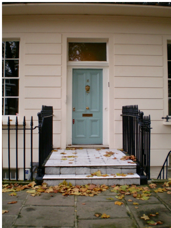
No. 15 Four-panelled door with ogee bolection mouldings - High Significance. Modern white marble tiles with black diamond tiles at corners - No Significance.