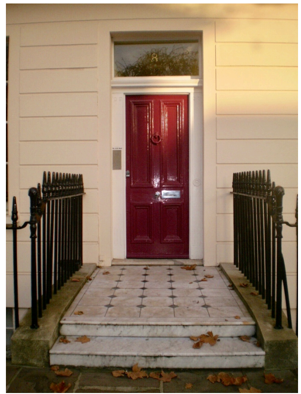
No. 8 Four-panelled door with ogee bolection mouldings - High Significance. Steps and Landing clad in modern tiles - No Significance.