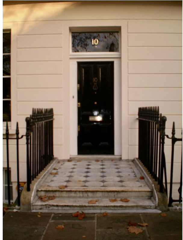
No. 10 Four-panelled door with ogee bolection mouldings - High Significance. Steps and landing clad in marble & marble tiles - No Significance.