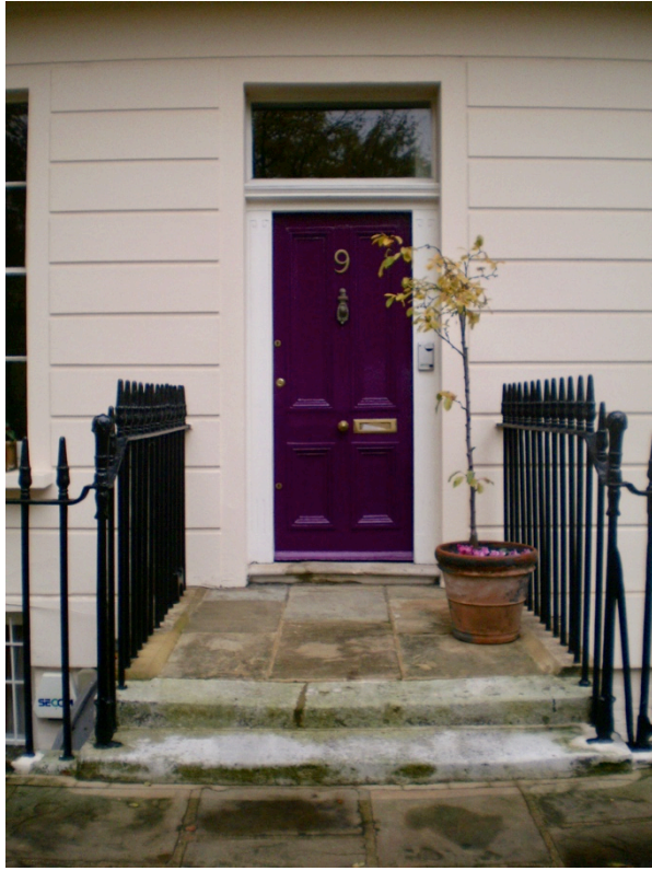
No. 9 Original Portland stone steps, four-panelled door with ogee bolection mouldings - High Significance. Landing reclad in small York stone slabs - Low Significance.