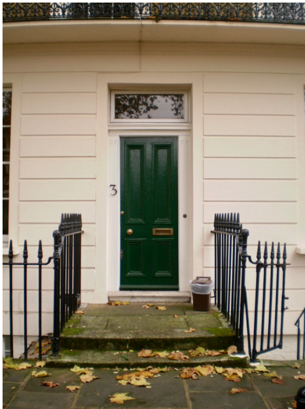
No. 3 Original Portland stone steps, four-panelled door with ogee bolection mouldings - High Significance. Non-original (?) York stone landing - Low Significance.