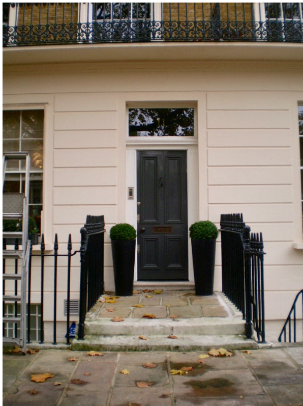
No. 11 Original Portland stone steps, four-panelled door with ogee bolection mouldings - High Significance. Landing reclad in small York stone slabs - Low Significance