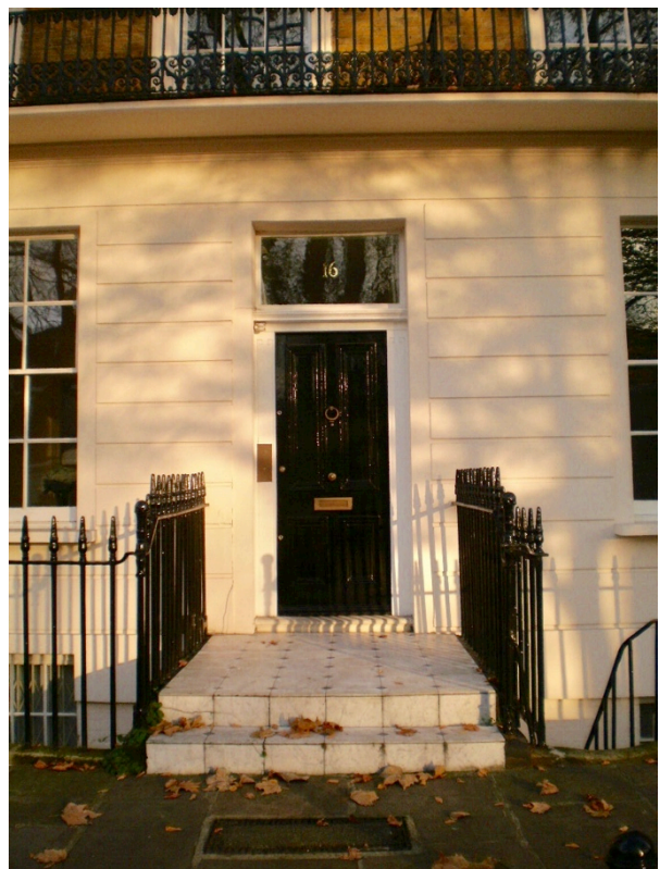
No. 16 Four-panelled door with ogee bolection mouldings - High Significance. Steps & landing clad in modern tiles - No Significance.