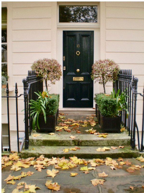
No. 13 Original Portland stone steps, four-panelled door with ogee bolection mouldings - High Significance. Landing reclad in small York stone slabs - Low Significance.