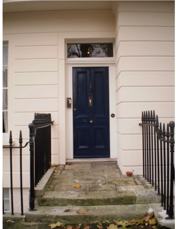
No. 6 Original Portland stone steps, four-panelled door with ogee bolection mouldings - High Significance. Landing reclad in small York stone slabs - Low Significance.