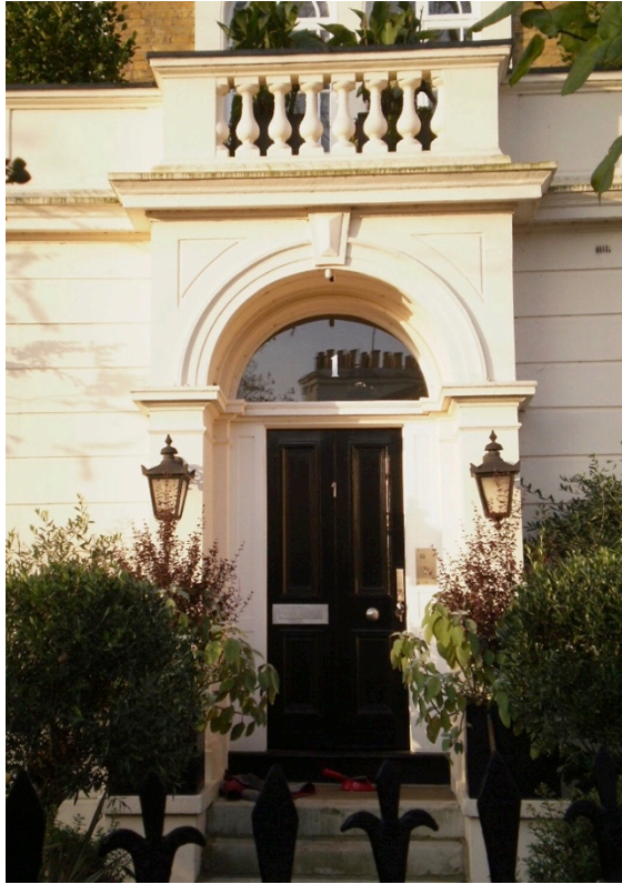
No. 1 Original Portland stone steps, four-panelled door with ogee bolection mouldings -High Significance. Pilasters, arched head & balustrade - High Significance.