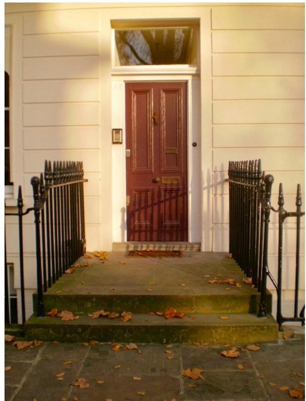
No. 12 Four-panelled door with ogee bolection mouldings - High Significance. Steps & landing rebuilt in York Stone - Low Significance.