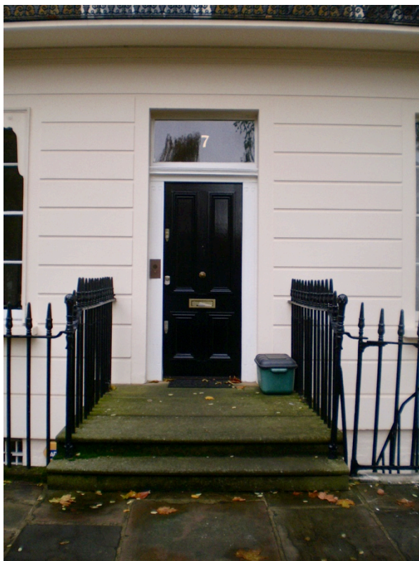
No. 7 Four-panelled door with ogee bolection mouldings - High Significance. Steps and landing reconstructed in Portland (?) stone - Low Significance