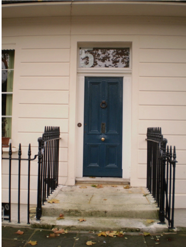
No. 5 Original Portland stone steps & original (?) Portland stone landing, four-panelled door with ogee bolection mouldings - High Significance.