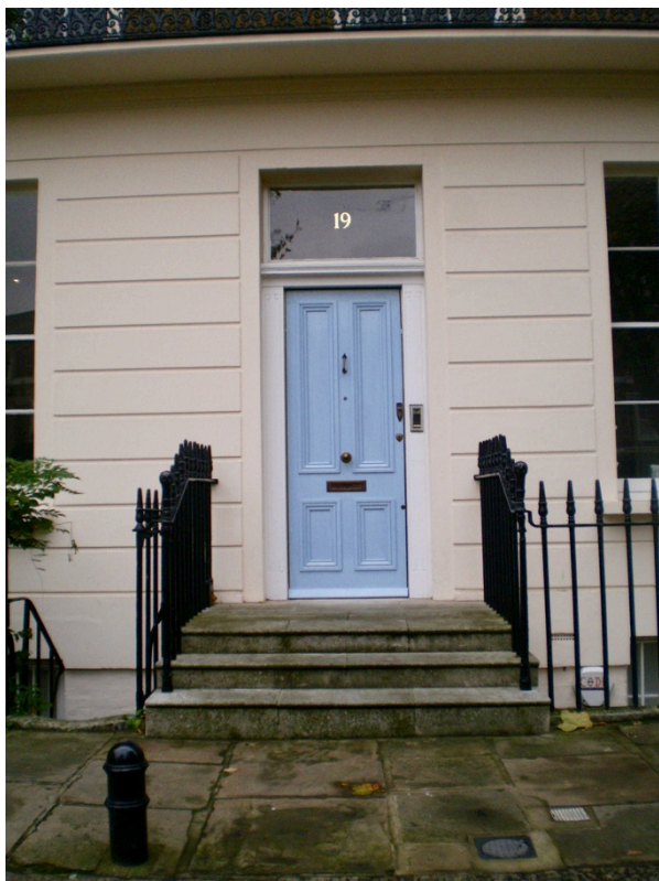
No. 19 Four-panelled door with ogee bolection mouldings - High Significance. Steps and landing reconstructed or clad in Portland stone - Low Significance.