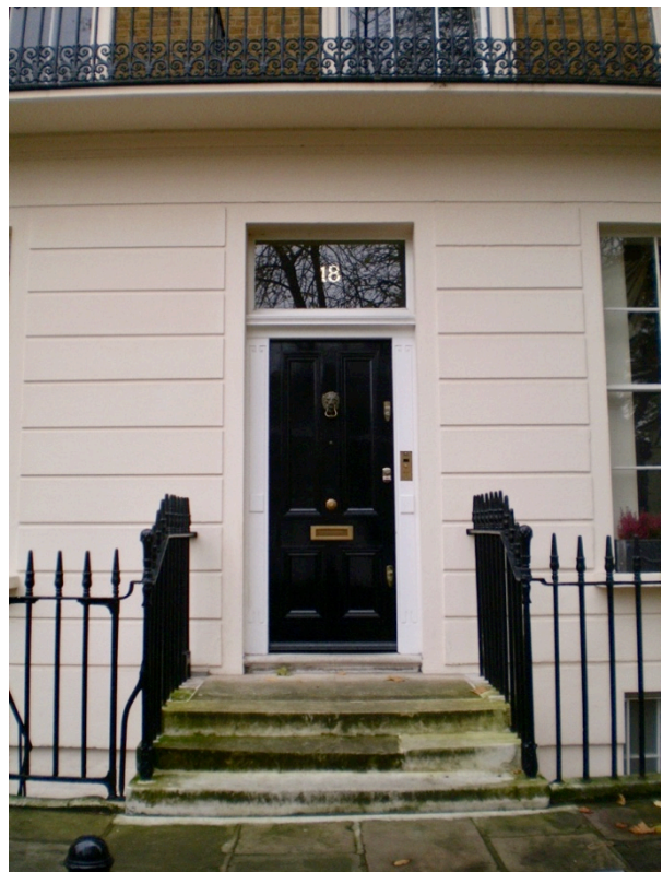
No. 18 Original Portland stone steps, four-panelled door with ogee bolection mouldings - High Significance. Landing reclad in Portland stone slabs - Low Significance.