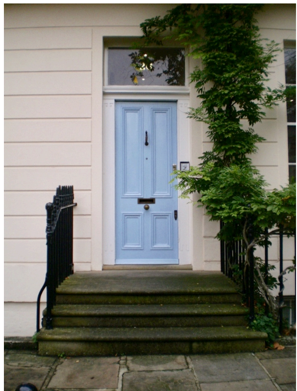
No.20 Four-panelled door with ogee bolection mouldings - High Significance. Steps and landing reconstructed in Portland stone - Low Significance