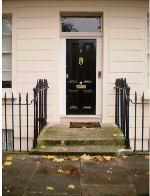
No. 2 Original Portland stone steps, original (?) Portland stone landing, four-panelled door with ogee bolection mouldings - High Significance.