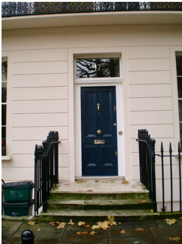
No. 17 Original Portland stone steps, four-panelled door with ogee bolection mouldings - High Significance. Landing reclad in Portland stone slabs - Low Significance.