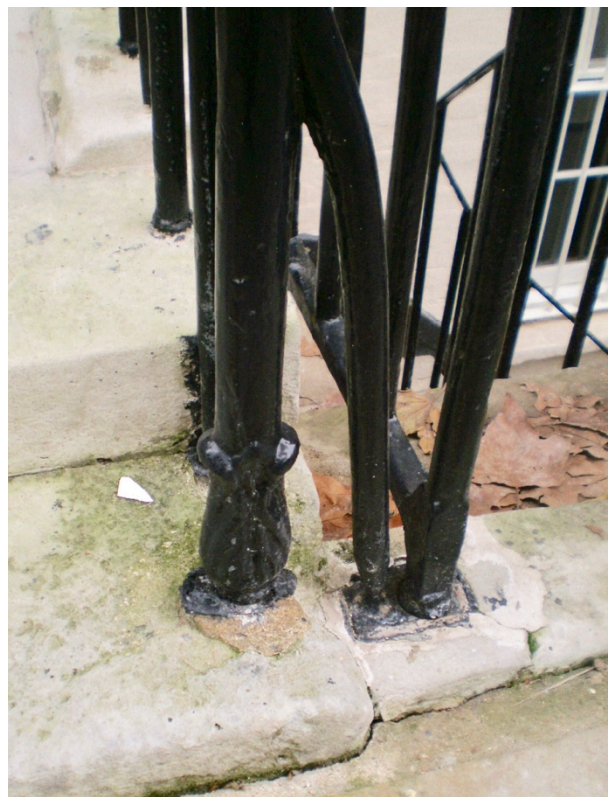
Foliate moulding to queen post - High Significance.