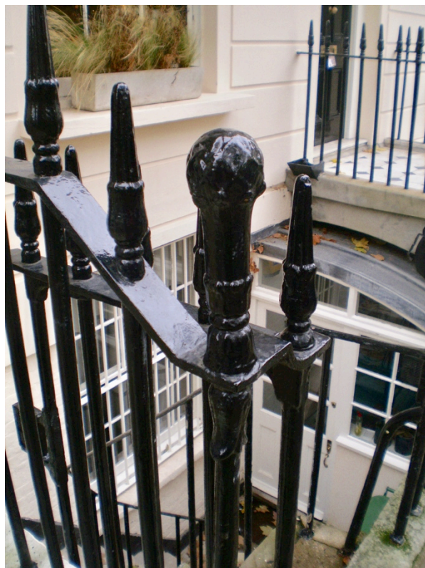
Foliated pointed finials to common rails and ball tipped foliated finial to queen post - High Significance.