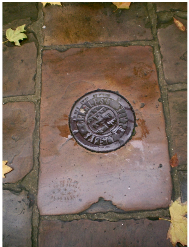
Example of cast iron coalhole plate, probably original - Medium - Significance.