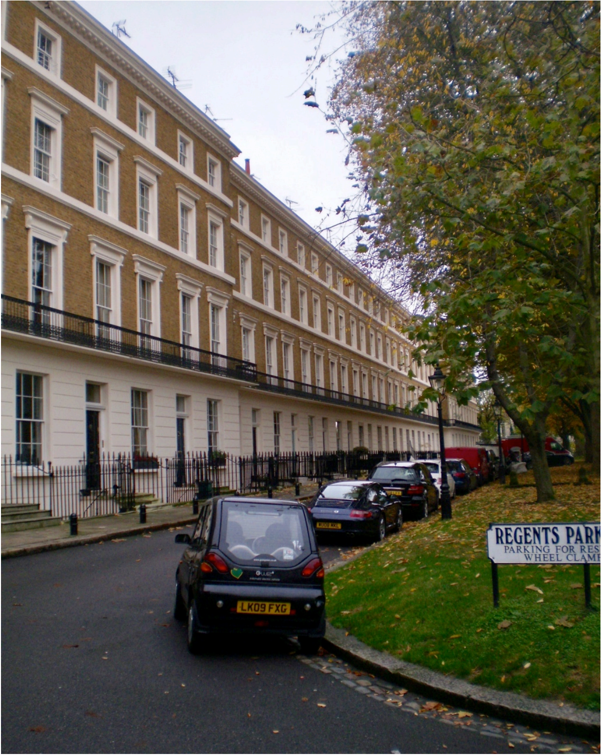
Regent's Park Terrace front elevation viewed from the north, overall - High Significance.