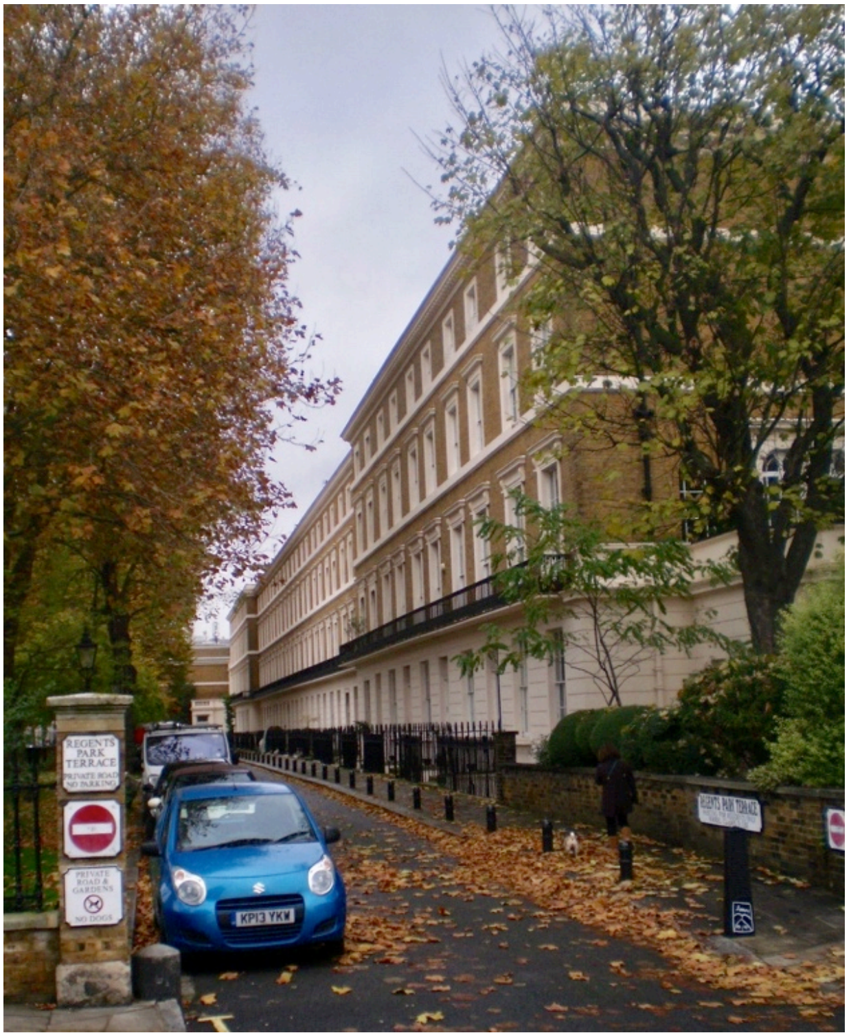
Regent's Park Terrace view from the south, overall - High Significance.