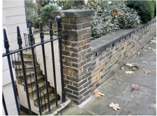
Original Basement lightwell railings terminated at a brick pillar. Original brick garden wall to No. 1 with brick dentils and Portland stone coping - High Significance.