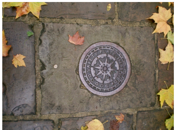
Example of cast iron coalhole plate, later replacement - Medium Significance.

York Stone Paving and Granite Kerbs - Medium Significance. Note: wide cemented joints indicate that paving has been relaid in modern times.