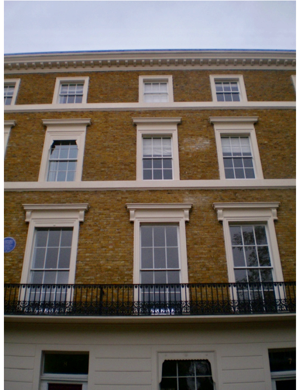
First floor stone balcony with cast iron railings. Windows with stucco architraves and corniced heads to first and second floors, Sliding sash windows. High Significance.