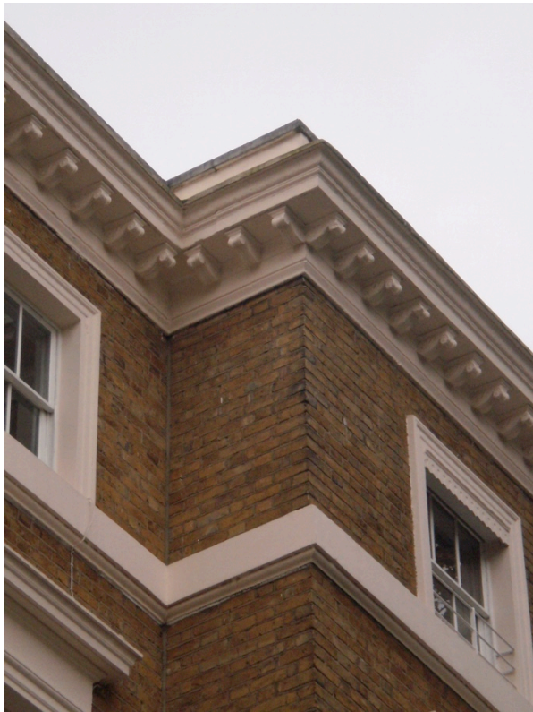
Parapet cornice with modillions, plain storey band below third floor windows. High Significance.