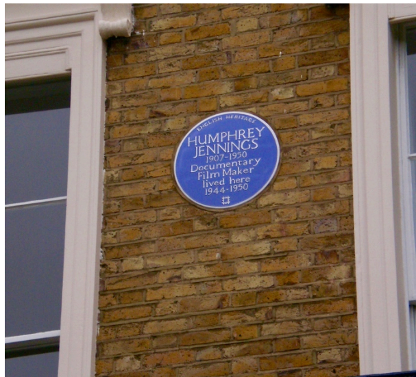
No. 8 Blue Plaque - social and cultural aspect of occupation by Humphrey Jennings - Medium Significance.