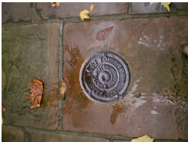
Example of cast iron coalhole plate, probably original - Medium Significance.