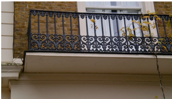
Detail of balcony and cast iron railings - High Significance.