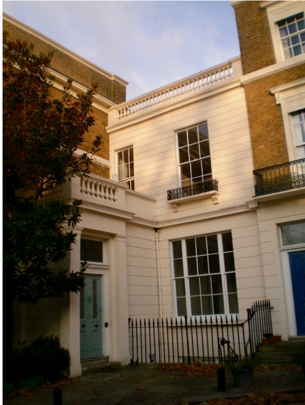
No. 22 Regent's Park Terrace, probably a later infill - High Significance.