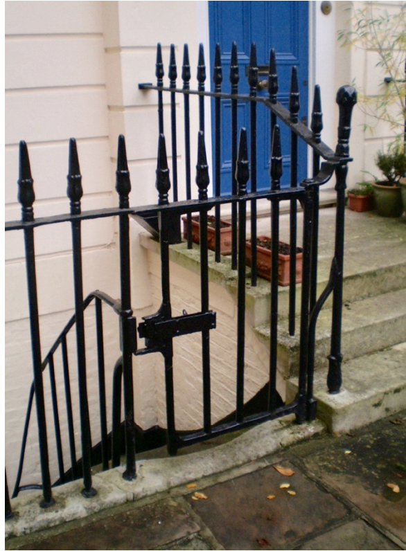
Original Basement lightwell and entrance step's railings & gate to basement steps - High Significance.