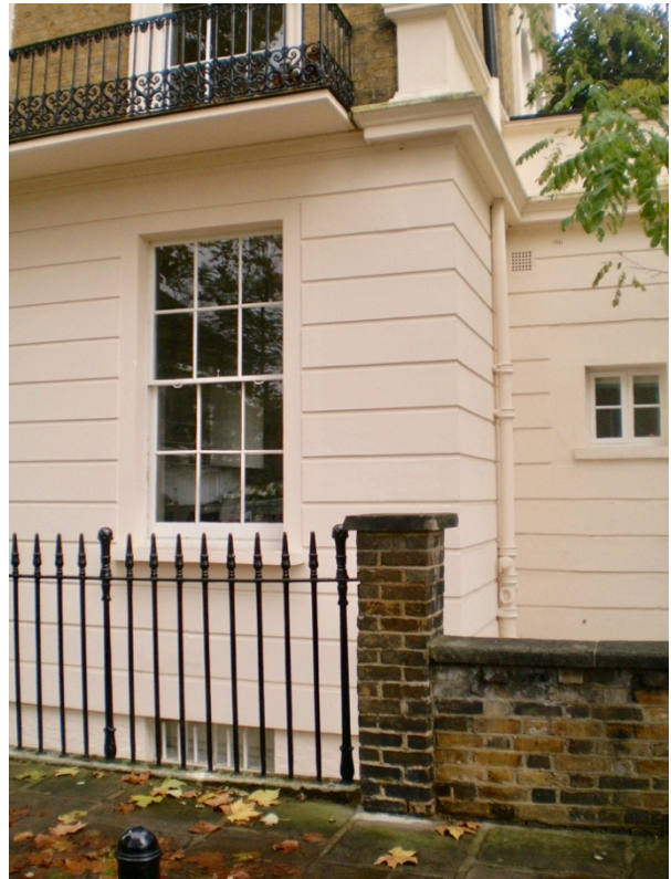
South end of terrace. Basement and ground floors stuccoed with incised horizontal rustication bandings. High Significance.