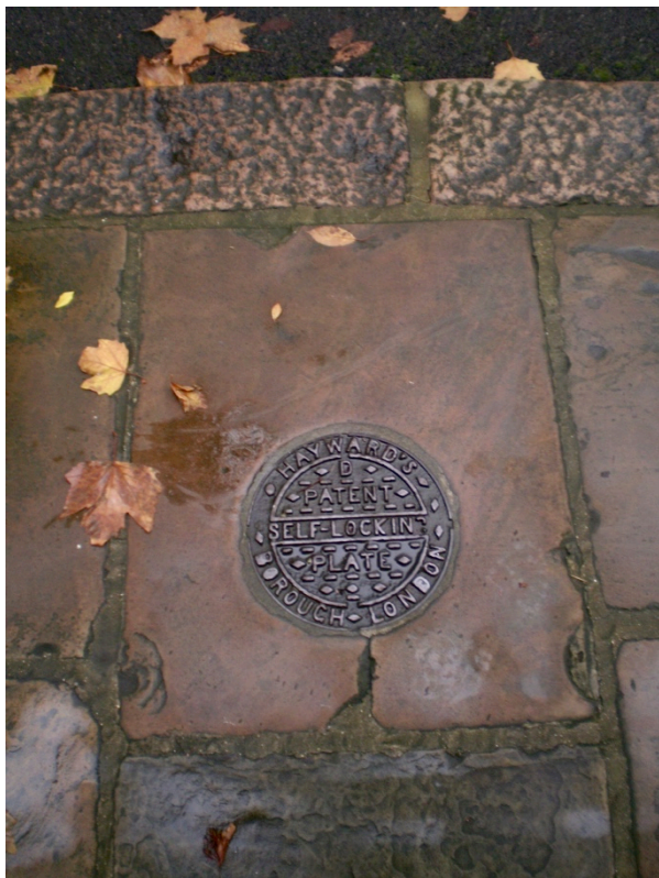
Example of cast iron coalhole plate, later replacement - Medium Significance.