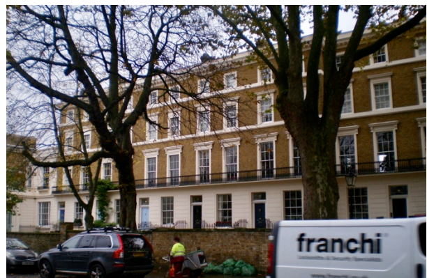
Front boundary wall on Oval Road, north end. Original parts - High Significance. Rebuilt part Medium Significance.