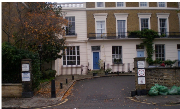
North entrance to Regent's Park Terrace with Original pillars either side - High Significance.