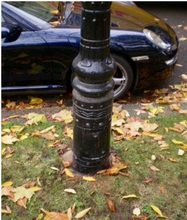
Base of modern date lamppost on grass verge. Door plate to access electric. No Heritage Significance. but an attractive and appropriate feature worthy of retention.