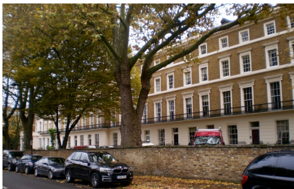
Front boundary wall on Oval Road, middle section. Original parts - High Significance. Rebuilt part Medium Significance.