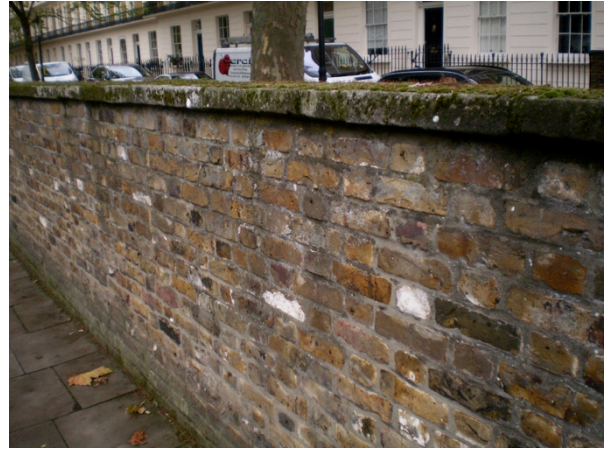
Front boundary wall on Oval Road. Rebuilt using reclaimed bricks and original coping - Medium Significance.