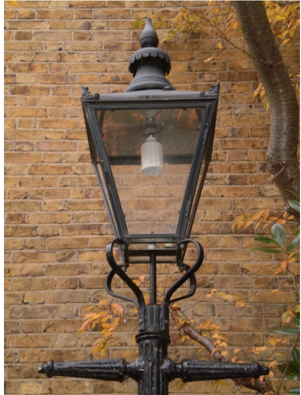
Lamppost at north end. Lantern of modern date - No Heritage Significance, but an attractive and appropriate feature worthy of retention.