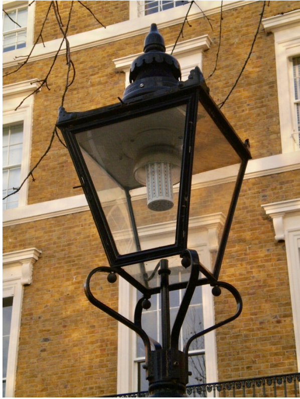
Lamppost on grass verge. Lantern of Modern date - No Heritage Significance, but an attractive and appropriate feature worthy of retention.