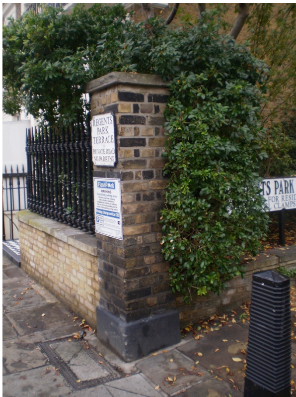
North entrance, original left hand pillar Original parts – High Significance. Rebuilt part Medium Significance. Original railings – High Significance. Rebuilt wall – Medium Significance. Signage clutter.