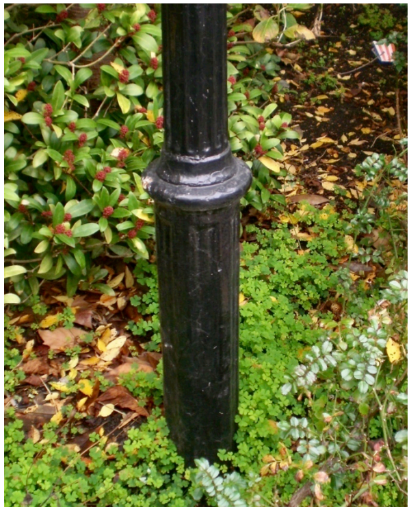
Base of lamppost at north end. No door plate. Lamppost of High Heritage Significance if it is original.