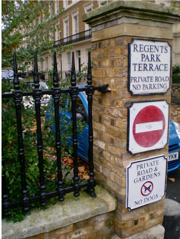
Detail: rebuilt entrance pillar with Portland stone cap & base - Medium Significance. Original decorative cast iron railings - High Significance. Signage clutter.