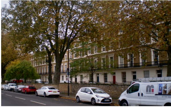
Front boundary wall on Oval Road, south end.