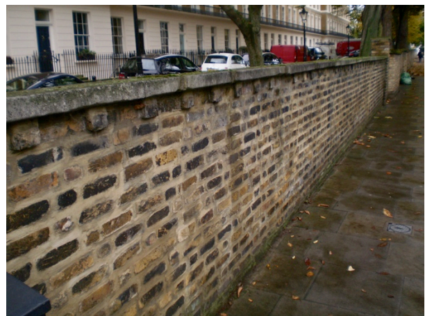
Original section of front boundary wall at north end, with brick dentils and Portland stone coping - High Significance, notwithstanding poor pointing.