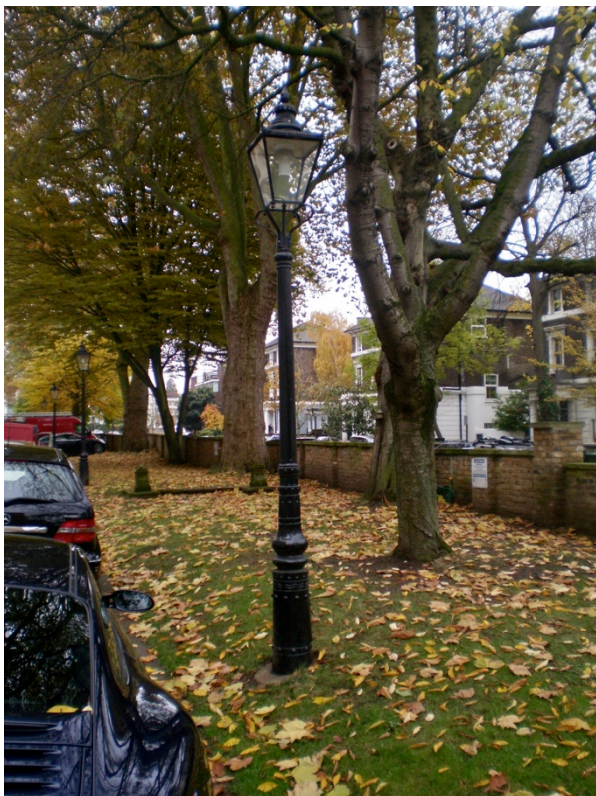
Grass verge & trees within the wall. Traditional design cast iron lampposts and lanterns of modern date. No Significance