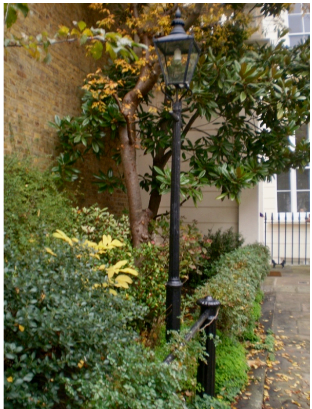
Cast iron lamppost at north end, possibly an original gas lamp adapted to electricity. If original, High Significance.