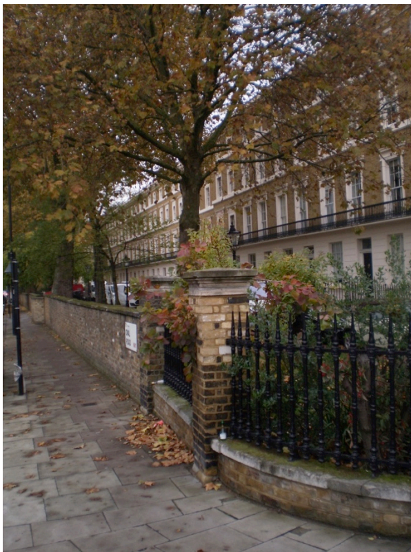
Railings and pillars on the corner of Gloucester Crescent and Oval Road, - High Significance.