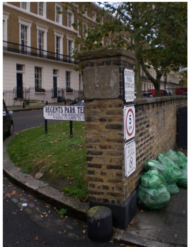
North entrance, original right-hand pillar – High Significance. Signage clutter.