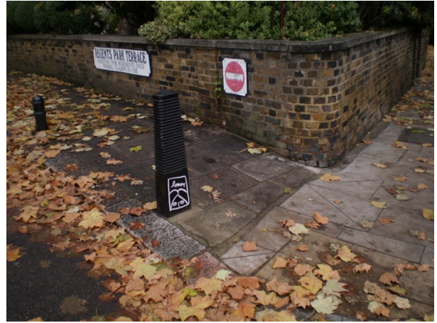
Right-hand side of south entrance: no evidence of a right-hand gate pillar. Original garden wall to No. 1 - High Significance.