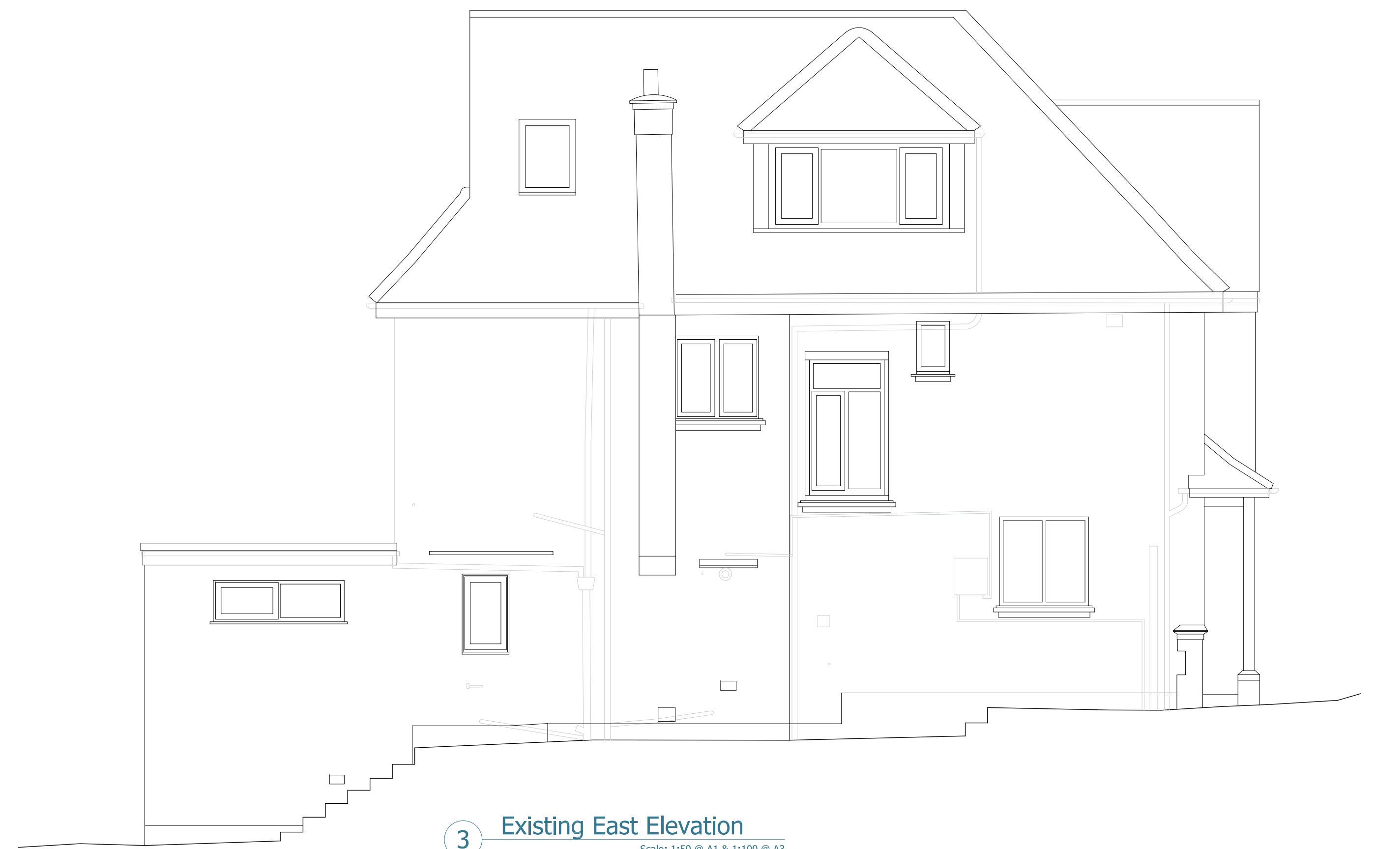
3 Existing East Elevation Scale: 1:50 @ A1 & 1:100 @ A3