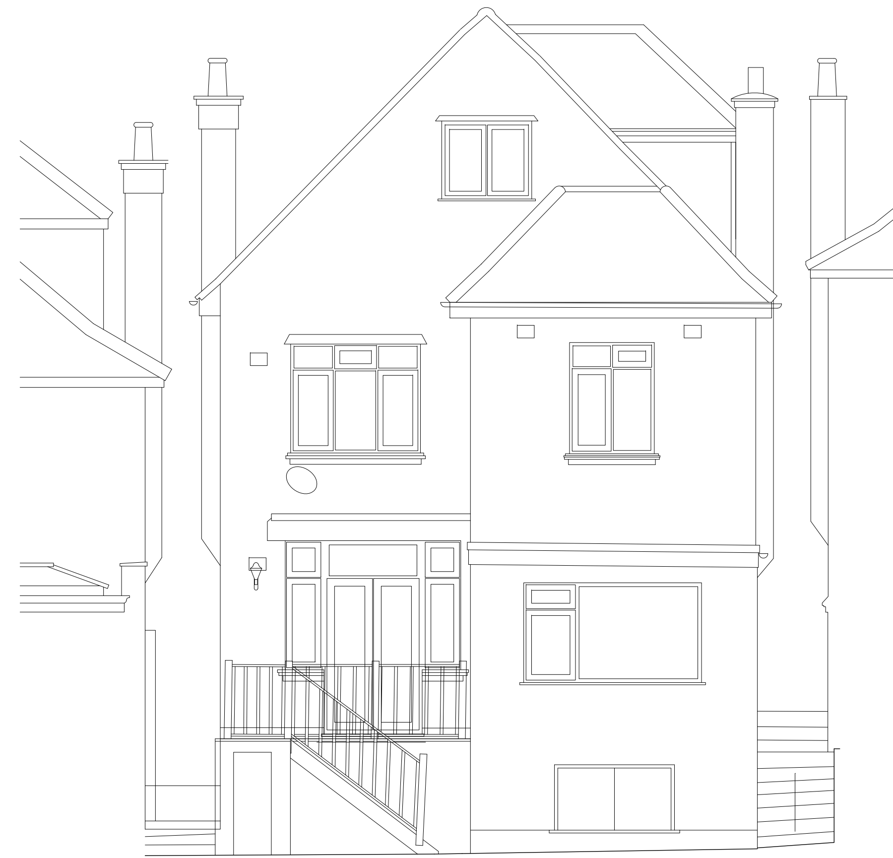
2 Existing Rear Elevation Scale: 1:50 @ A1 & 1:100 @ A3