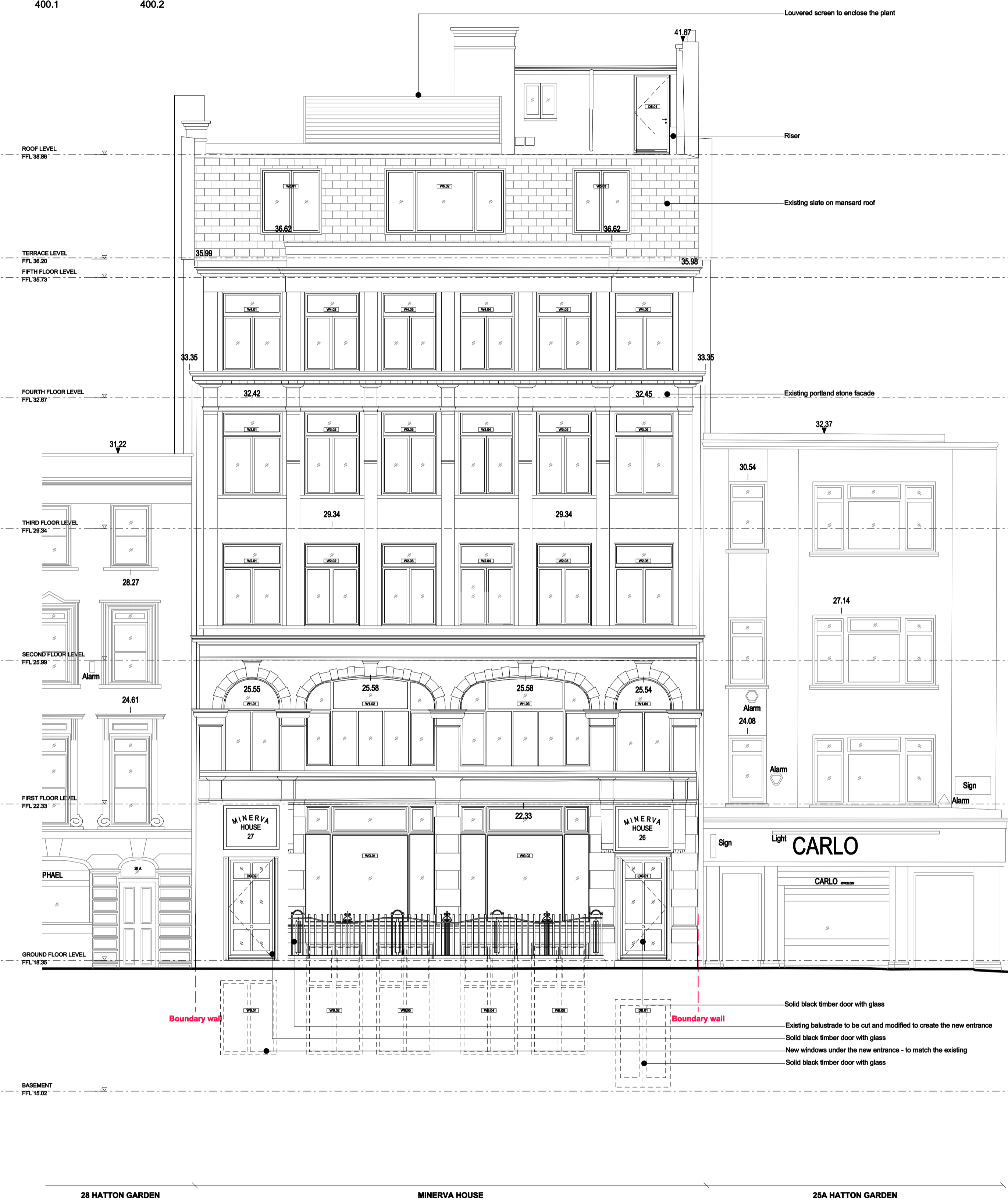
400.1 PROPOSED SOUTH WEST ELEVATION