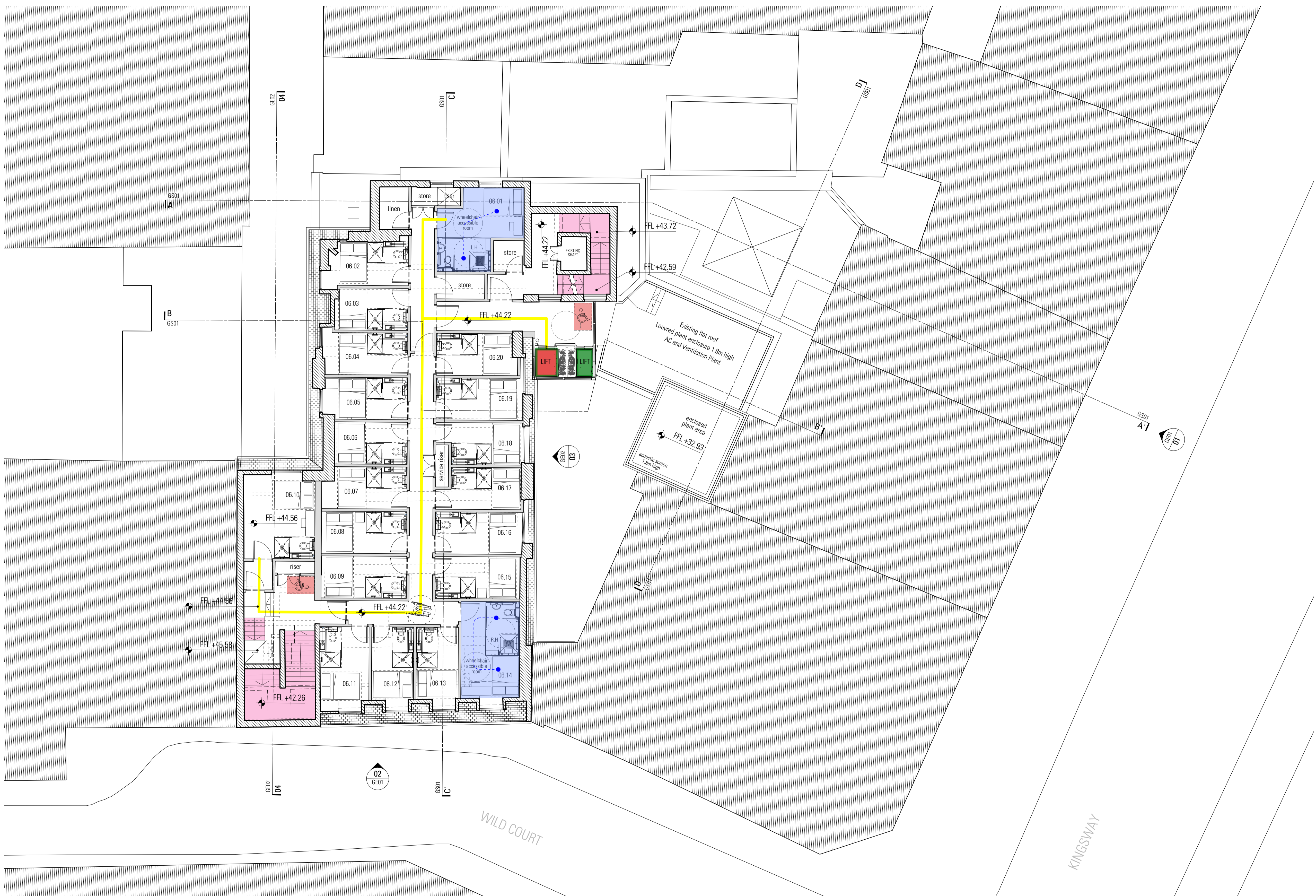
06 Proposed Sixth Floor Scale 1:100 @ A1 / 1:200 @ A3