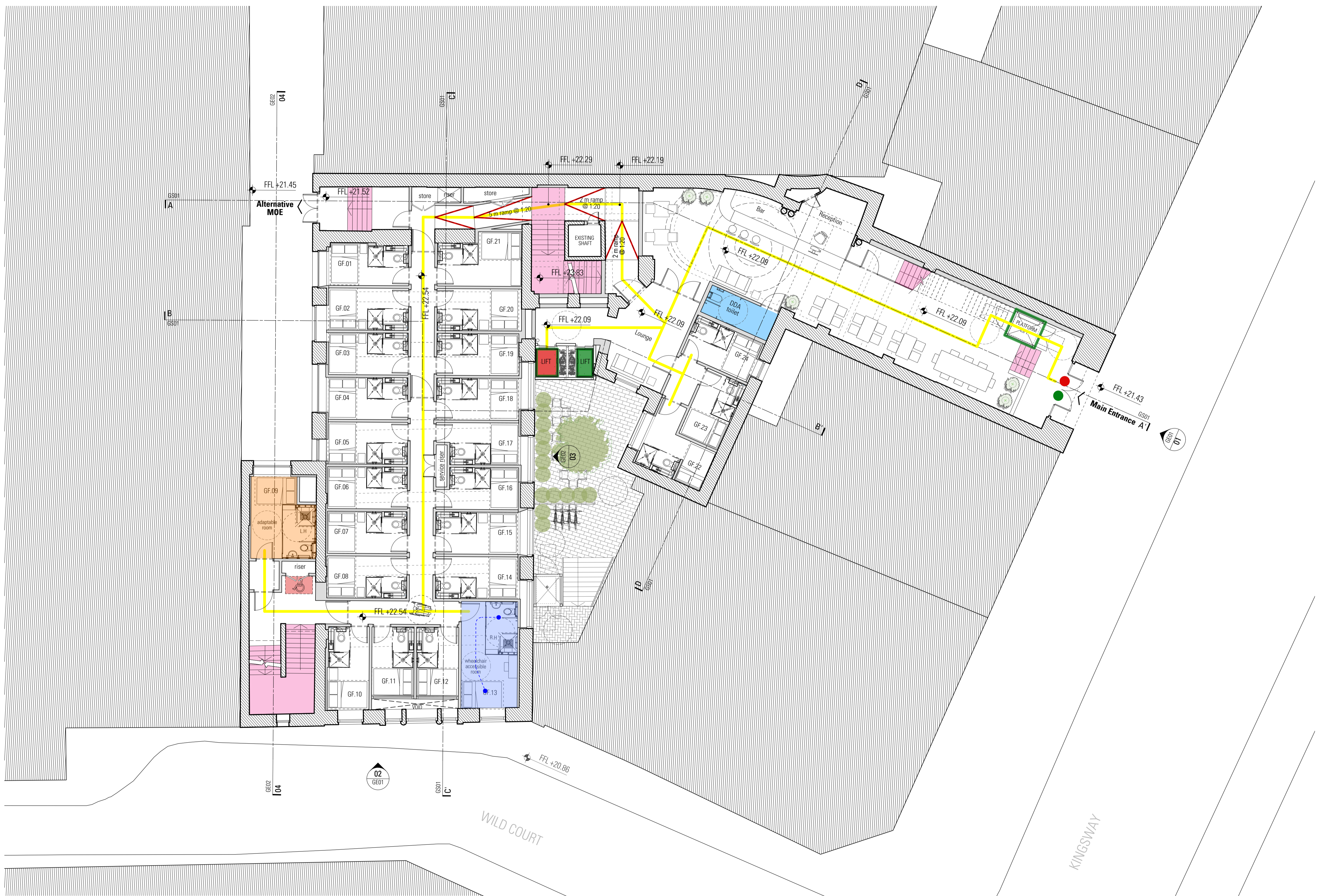
GF Proposed Ground Floor Scale 1:100 @ A1 / 1:200 @ A3