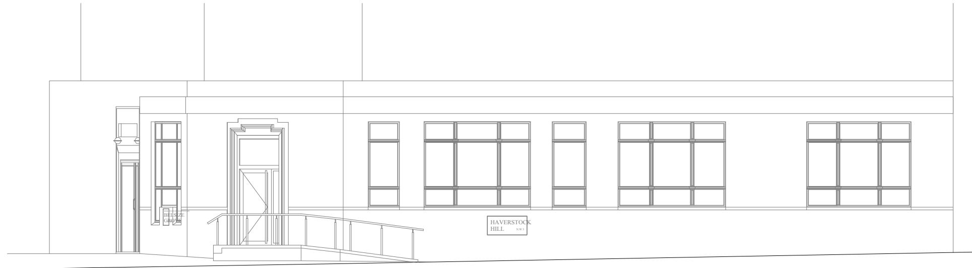
THE BANK - FRONT ELEVATION

Figured dimensions to be read in preference to scaled drawings DO NOT SCALE FROM THIS DRAWING.